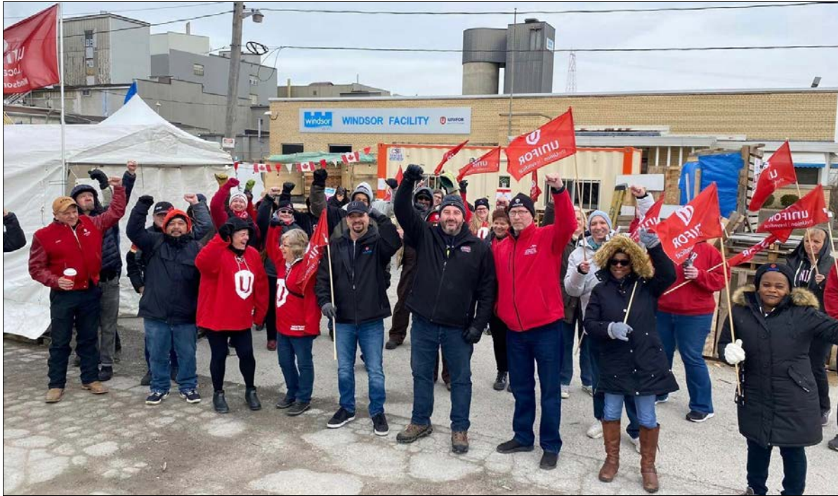
Unifor Locals from London, Ontario show their support, March 28, 2023.

The salt workers on strike in Windsor, Ontario, are receiving important expressions of support from far and wide. The more workers across the country become aware of the salt workers' valiant stand against the company's plans to contract out their jobs, which amounts to union-busting, and their determination to engage in negotiations for wages and working conditions which meet their just claims, the more they identify with the salt workers and express their support.