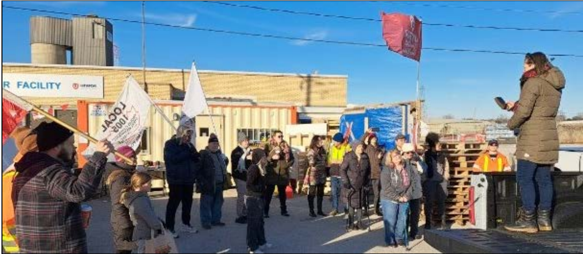
United Steelworkers Local 1005 retirees and EmpowerYourselfNow.ca join rally at Windsor Salt picket line, International Women's Day.