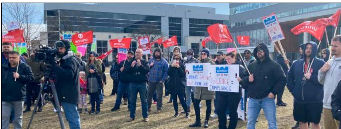
Rally at Windsor city hall March 16, 2023 in support of striking salt workers.

A salt miner's wife from Goderich, Ontario