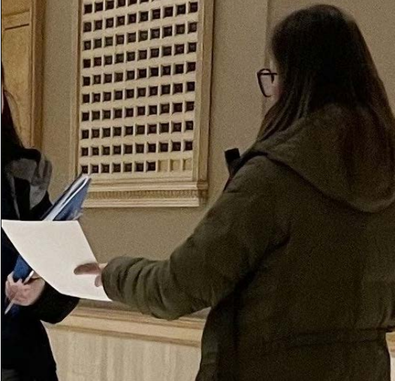
Leaflets distributed in support of Windsor Salt workers at provincial teacher and education worker meetings in Toronto (left) and local meeting of elementary teachers in Windsor.