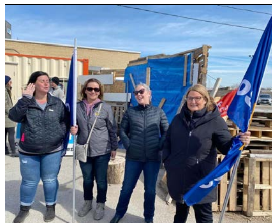
Windsor municipal workers (left) and teachers and education workers visit the picket line.

From Ontario, Unifor members from London as well as representatives of the Carpenters' District Council of Ontario came to visit the picket lines, as have miners from Goderich's salt mine operations. A delegation of retired steelworkers from USW Local 1005 in Hamilton have also visited the line.