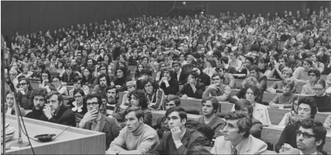
Rally at the University of Montreal, October 1970.

"On October 19, in Vancouver, British Columbia, and Regina, Saskatchewan, mass demonstrations were organized in support of Quebec patriots and to denounce the War Measures Act [...]. One thousand students participated in the rally in Regina. After the rally, 300 activists marched angrily to government buildings where they organized a powerful demonstration. In Vancouver, 1,500 demonstrators heard speakers at the courthouse supporting the struggle of the Quebec people and calling for total opposition to the measures imposed by the Trudeau lackey regime. Students from the University of Calgary did the same. After the rally, 300 students marched angrily to central Calgary in an act of defiance to express their militant protest against the government's fascist measures." [3] In Ottawa, on October 16, a meeting of more than 300 french-speaking students from the University of Ottawa voted by a two-thirds majority to strike against the War Measures Act .