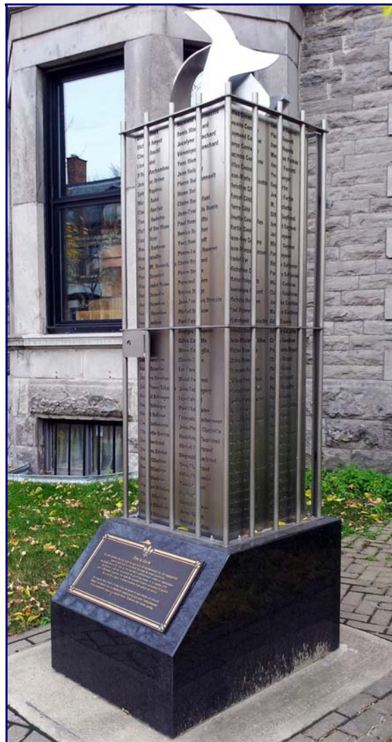
Freedom by Marcel Barbeau (click to enlarge).

Of note is the fact that the list of persons imprisoned by virtue of the War Measures Act was never made public. Journalists and historians who have looked into the events estimate that between 500 and 1,000 arrests were made, and between 10,000 and 15,000 warrants served.