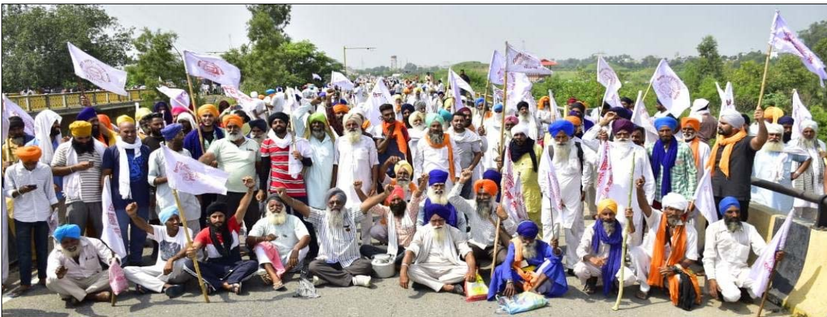
Protest against farm bills passed by central government, September 14, 2020.

In many parts of India a movement called Gram Sabha Adhikar Jagrukta Abhiyan (Village Empowerment Awareness Campaign) is going on quietly at a village level. People are discussing very substantive issues such as: "What is our vision for our village? How can we bring it into being? What are the hurdles in realizing this vision?" Ordinary women, men and children are discussing these important issues and discussing strategies, tactics and mechanisms to realize their vision. This work is inspiring because it sets down the building blocks of renewal and renovation.