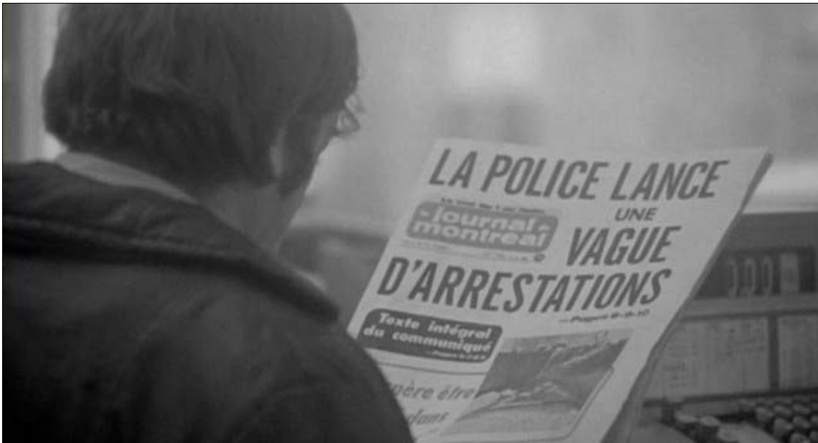
Image from the film Les Ordres

Michel Brault's film Les Ordres (The Orders) was made four years after the events triggered by the proclamation of the War Measures Act in October 1970. The film focuses on the repercussions of the War Measures Act , and more precisely on the resulting arbitrary arrests. At the time of the making of the film, the frustration among the people arising from the events of October 1970 was still palpable as a result of the flagrant violation of the individual freedoms of citizens. The film deals with this legislation and the reaction of the government of Pierre Elliot Trudeau to trample the rights and freedoms of citizens in the name of public safety. The message conveyed by Michel Brault is clear. He explains that he "didn't want to make a film about the October Crisis, but rather about humiliation."