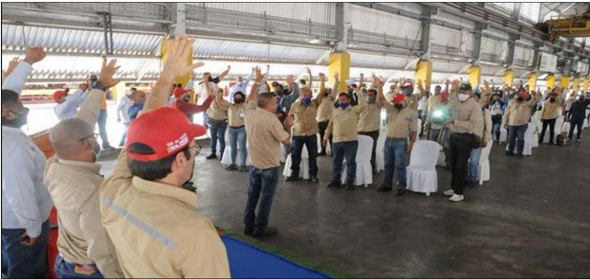
A workers' assembly approves the anti-blockade law as part of broad consultations.

It is a necessary legal response from the Venezuelan State, in perfect harmony with International Law, that will allow for the creation of mechanisms to improve the nation's income and generate rational and adequate incentives, under flexible controls, to stimulate internal economic activity and enter into partnerships, through foreign investment, that favour national development.