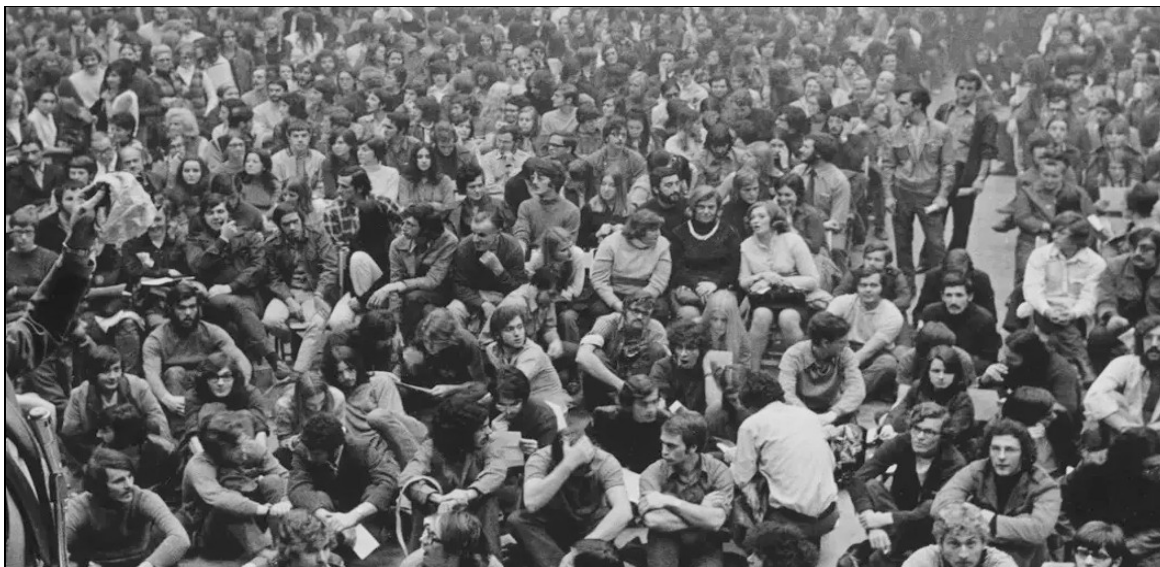
Youth fill Paul Sauvé Arena in Montreal in support of Quebec national liberation on the eve of the declaration of the War Measures Act in October 1970. A number of the youth in attendance are among those arrested in the raids which follow the Act being invoked.

On the occasion of the 50th anniversary of the proclamation of the War Measures Act by Pierre