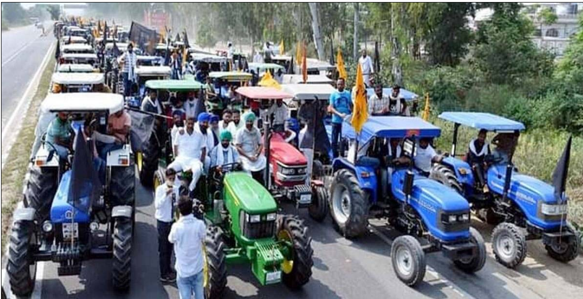
Farmers' protest in Punjab, September 2020.

Farmers in many parts of India have mounted the barricades against the policy of the central government to pauperize them, force them into debt, evict them from their lands, drive them to commit suicide and hand their lands to the big corporations. "Haryana and Punjab are boiling," reported a news channel. In Haryana, the state unleashed its terror on the farmers who were demonstrating against the policies of the central government.