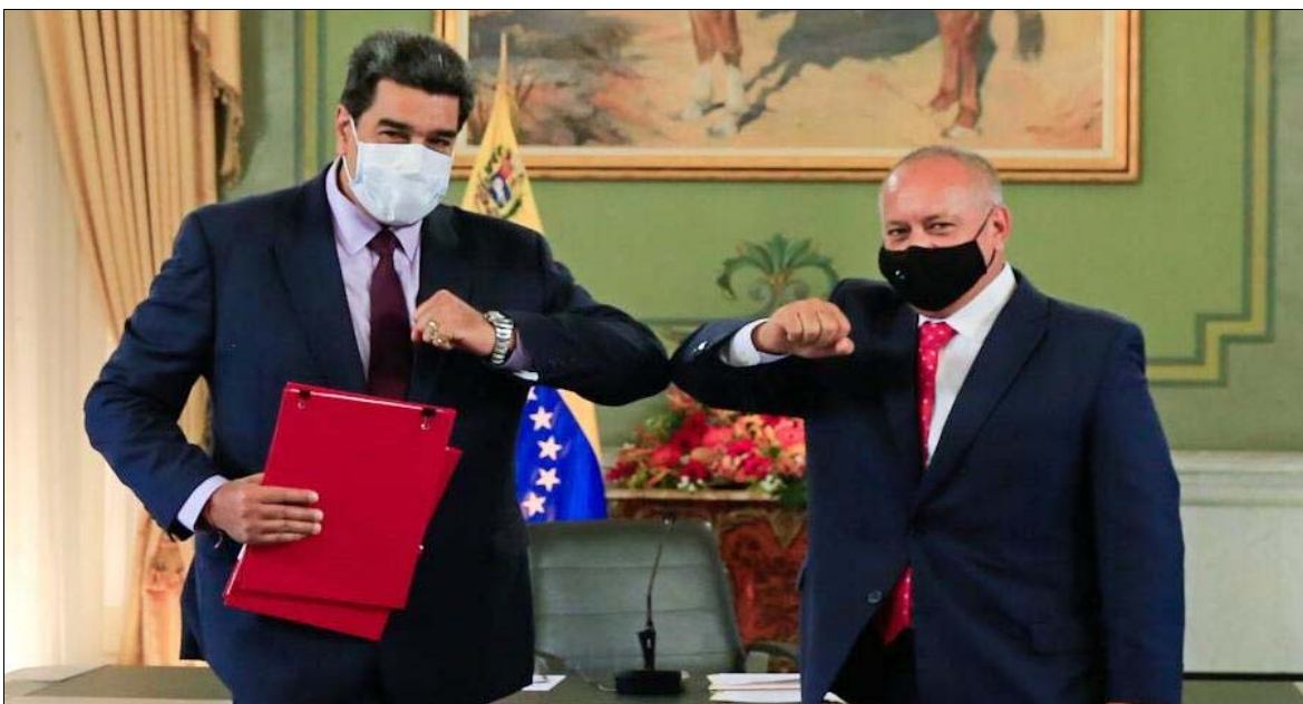
The anti-blockade law is received by President Maduro, October 9, 2020, from the National Constituent Assembly following its deliberations.

- Nicolás Maduro Moros, President of the Bolivarian Republic of Venezuela -