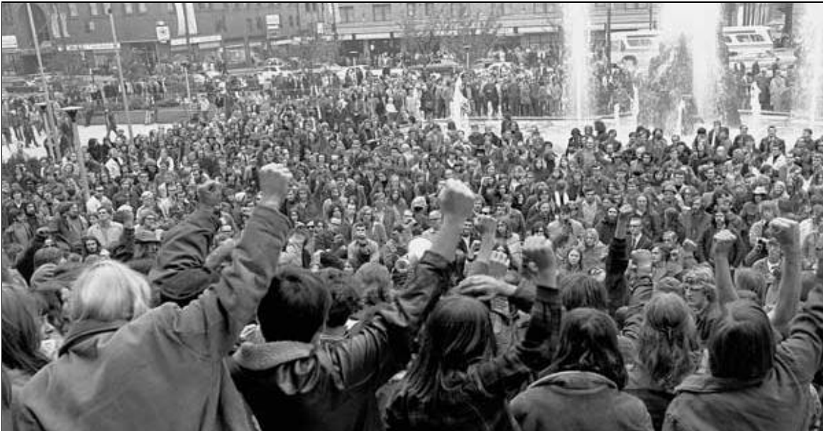
Rally of 1,500 in Vancouver, October 19, 1970, one of many actions across the country supporting the Quebec people's struggle and opposing imposition of the War Measures Act .