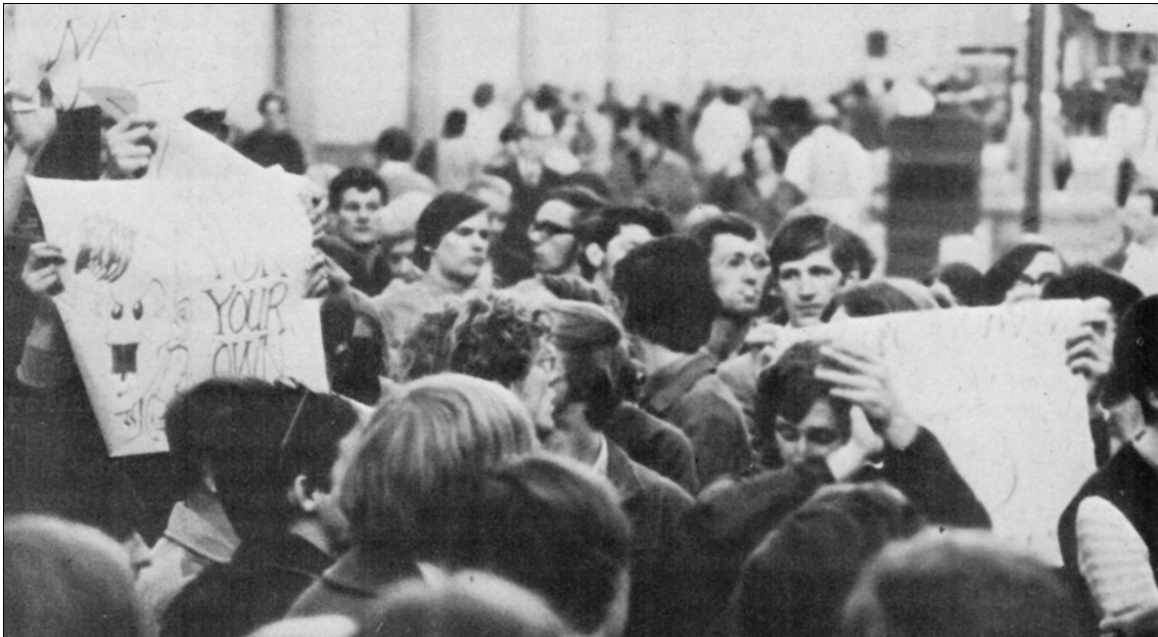
Demonstration against the War Measures Act at the University of Calgary, October 27, 1970.

When the government of Pierre Elliot Trudeau enacted the War Measures Act on October 16, 1970 and the army was deployed in the streets of Ottawa and Montreal before that and arrests began, opposition and resistance was immediate across the country. Students and youth, intellectuals, working people and other collectives in their thousands protested all across the country. The following account is taken from newspapers published by the Communist Party of Canada (Marxist-Leninist) and its affiliated organizations at the time the events were taking place.