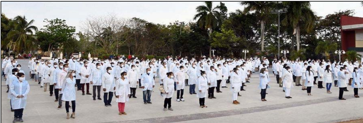
Members of the Henry Reeve Brigade prepare to leave Cuba for South Africa, April 25, 2020, as part of their contribution to the fight against COVID-19.

The Canadian Network On Cuba (CNC) informed this week on its successful Campaign to Support Cuba's Contribution to the World's Fight Against COVID-19. The CNC reports that it sent $53,512 to Cuba.