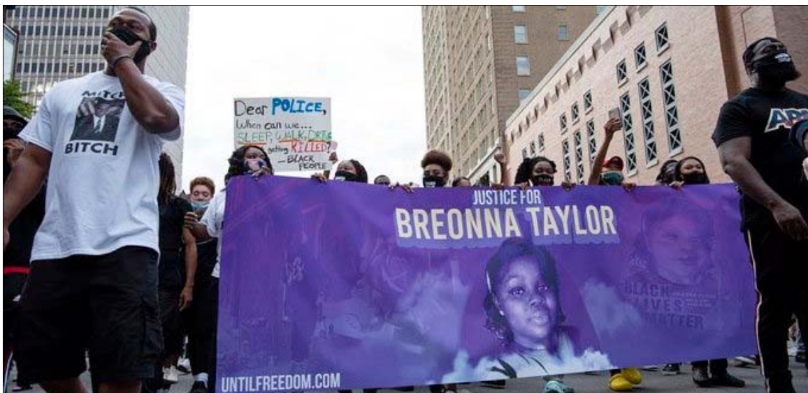
Louisville, Kentucky, September 27, 2020.