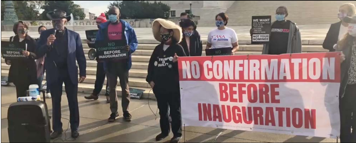
Protesters demand recognition of LGBTQ+ rights, October 2, 2020, following Supreme Court nomination.