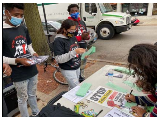
Youth set up an info table, September 26, 2020, calling for an end to police brutality and the establishment of a civilian police accountability committee.