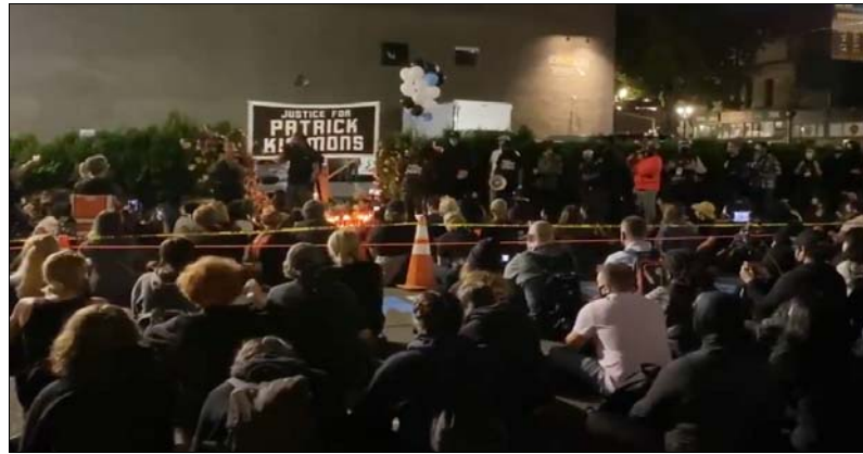
Memorial for Patrick Kimmons, who was shot and killed by Portland police in 2018. September 30, 2020 also marked the 115th day of protests.