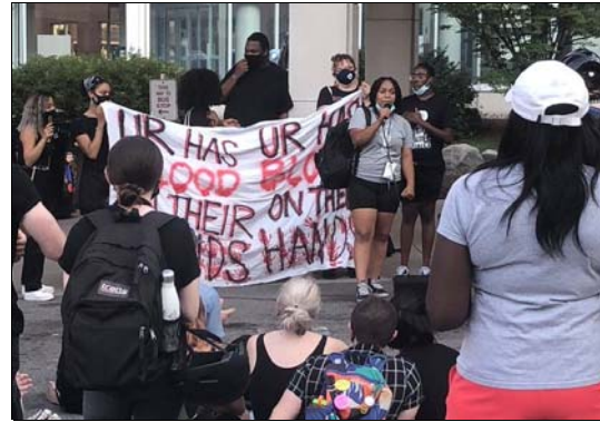
New York City, New York