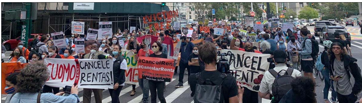
Housing activists call on Mayor Cuomo to extend the moratorium on evictions, as many face homelessness during ongoing pandemic and economic crisis, October 1, 2020.