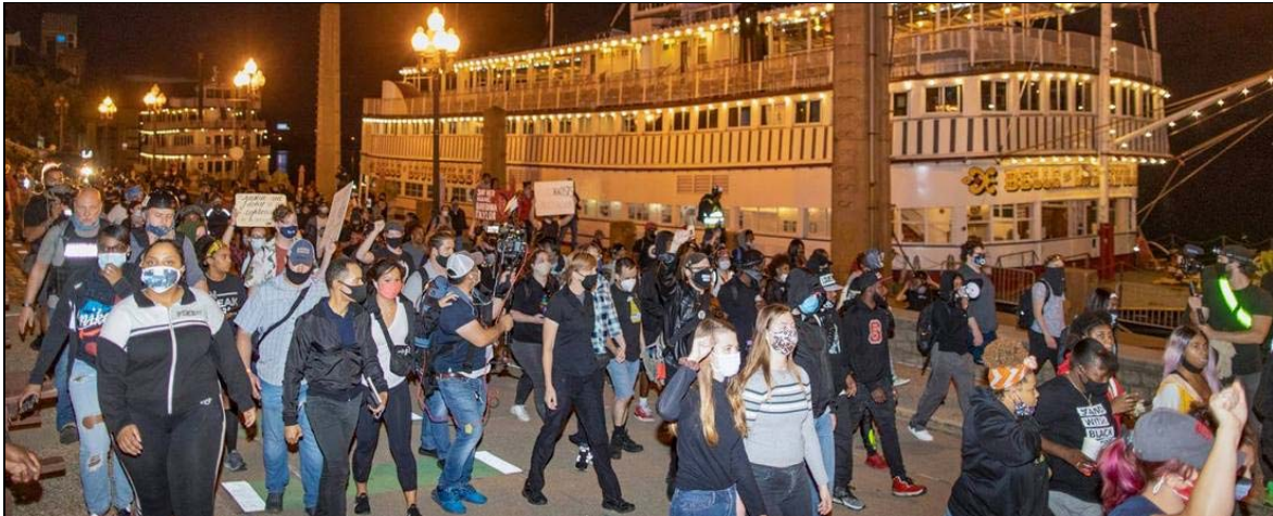
Demonstrations September 26, 2020, as actions continue in Louisville, Kentucky demanding justice for Breonna Taylor.

occurs -- as happened with George Floyd and is now occurring with Breonna Taylor and in many other cases.