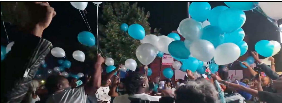
Teach-in and memorial for Laquan McDonald, killed by Chicago police in 2014. The 400 balloons released there marked the 400 days it took for the truth to come out about his murder.