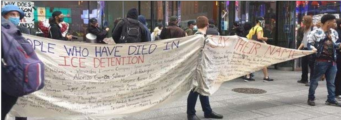
Abolish Immigration and Customs Enforcement protest demands freedom for all detained and an end to detentions, spying and abuse. Their banner names those who have died in ICE custody, October 2, 2020.