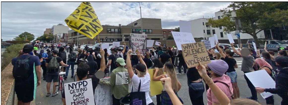
Action against police impunity and violence, September 26, 2020.