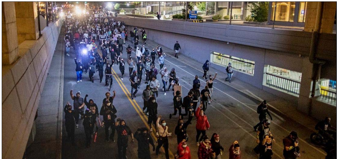
Louisville, Kentucky, September 26, 2020.