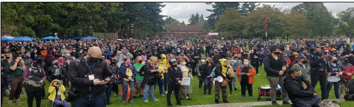
Mass mobilization in Portland, Oregon, to affirm Black Lives Matter at the same time as a Proud Boys rally was being held in the city, September 26, 2020.