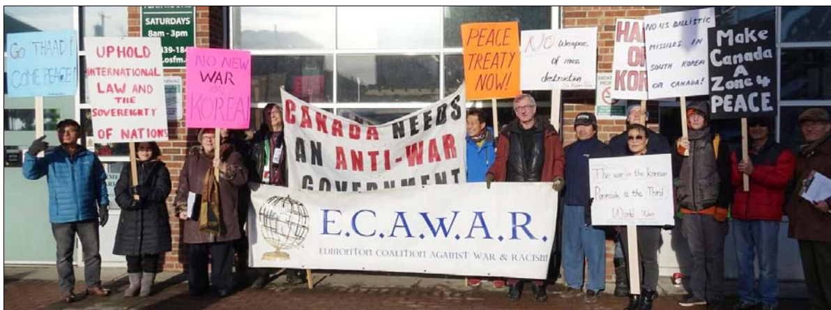
Edmonton picket and petition signing, November 25, 2017.

In co-hosting the January meeting with the U.S., it is evident that Canada is marching in lock-step with the United States whose president has already threatened to "destroy" the DPRK and unleash "fire, fury and frankly power, the likes of which this world has never seen before." By its actions, the government is placing Canada more directly in the service of bullying and threats, something Canadians do not accept. For Canada to present its military expansion and phony diplomatic efforts as attempts to seek a peaceful solution on the Korean Peninsula is unacceptable.