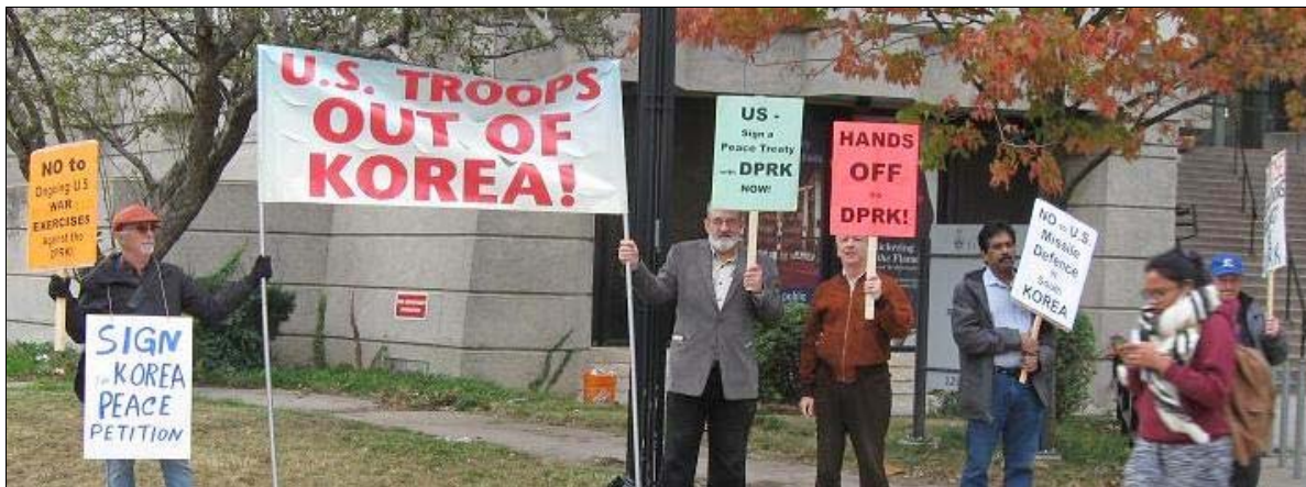
Launch of Canadian Petition Against War and Aggression on the Korean Peninsula in Toronto, October 25, 2017.

stands it contains to assist in creating the public opinion across the country required to block attempts by the ruling circles in Canada to make Canada a zone for war against Korea and meddling in Asia. By taking a stand to support peace on the Korean Peninsula Canadians can speak in their own name and empower themselves to make a contribution to world peace.