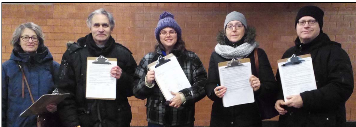
Collecting signatures on the Canadian Petition Against War and Aggression on the Korean Peninsula, Montreal, December 13, 2017.

For further information e-mail cankorpeace@gmail.com