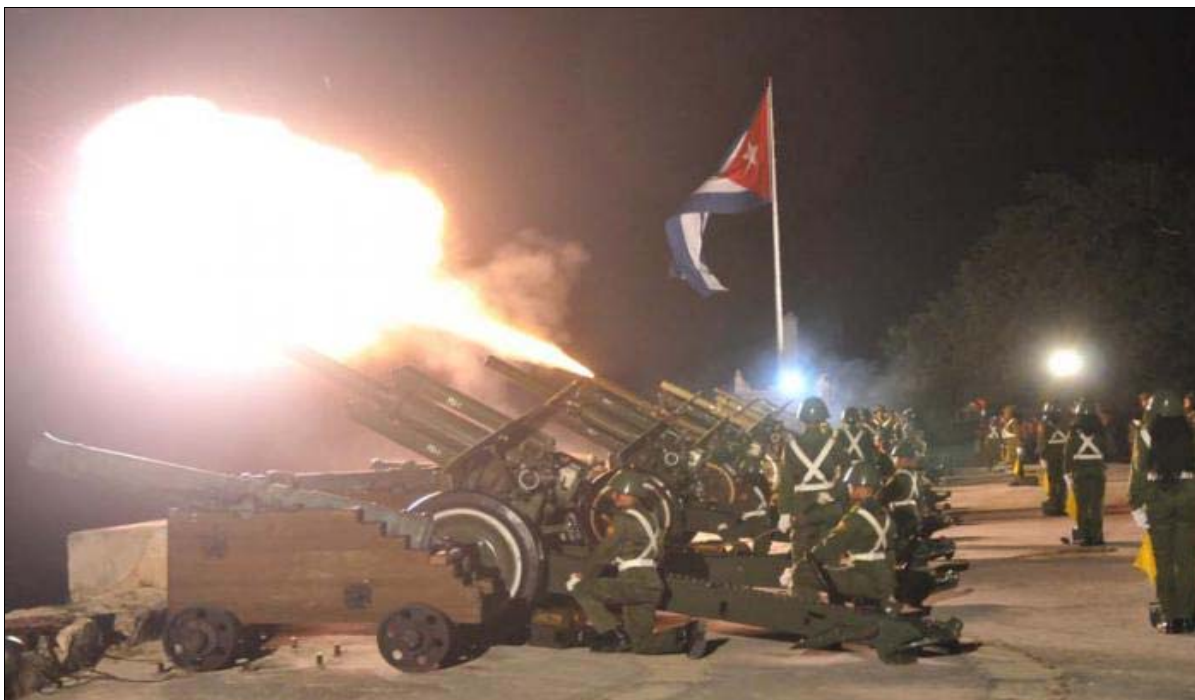
A 21-gun salute in Havana rings in the New Year and the 60th year of the Cuban Revolution, December 31, 2017.