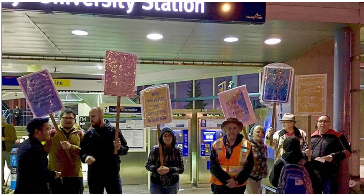
Picket and signature collection, November 23, 2017, at Production Way -- University Skytrain Station in Burnaby.

As well as threatening the Korean and world's people into submitting to U.S. imperialist control of the Korean Peninsula, this is part and parcel of the Trudeau government's aim to boost Canada's "expeditionary" military forces in the Asia-Pacific region, a geopolitical tinderbox where the rivalries between the U.S. drive for domination of the South China Sea and China's increasing ambitions and role in the region are being played out.