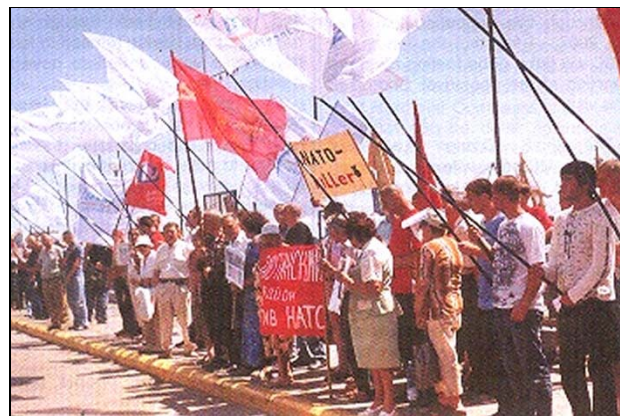
Demonstrations in Ukraine, July 9, 2007 against "Seabreeze" NATO military exercises in Black Sea.

In September 1997, the same year that "Rapid Trident" was launched, the U.S. launched its annual "Sea Breeze" naval-military manoeuvres -- presented as "multinational exercises" -- in the Crimea, Odessa and Black Sea coastal regions, which focuses on taking control of the strategic Black Sea and converting it into an American lake. Maritime Command of the Canadian Forces regularly participated, either by deploying a warship or specialists as observers. In particular, armed forces from Black Sea riparian nations participated -- units from NATO countries Turkey and Romania, but also the non-NATO nations Georgia and Ukraine. On October 25, 1998 thousands of U.S. marines "invaded" the shores of Odessa during the "Sea Breeze" exercise, with U.S. warships participating in full war conditions. The aim of the war manoeuvres was to ascertain and learn about the terrain of the former Soviet Union and the Black Sea region.