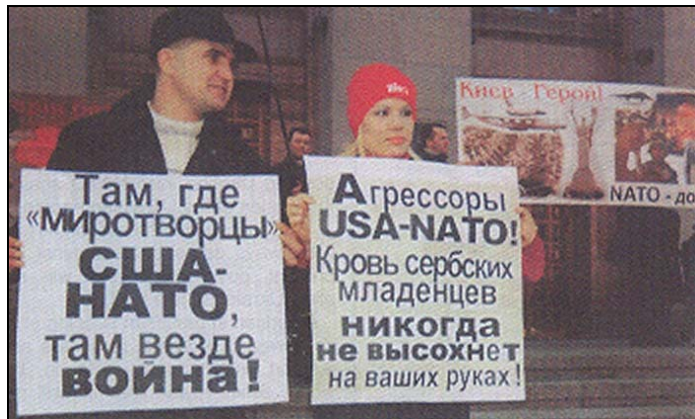
Ukrainians oppose "visit" of U.S. president George Bush to Kiev enroute to the 2008 Bucharest NATO Summit, April 1, 2008.

Since the creation of the Standing NATO Response Force Maritime Group 1 Fleet and the NATO transformation pushed by then U.S. Secretary of Defense Donald Rumsfeld (2001-2006), Maritime Command has regularly participated in NATO Fleet patrols of the Black Sea, which have become ceaseless. Canada currently deploys a warship to NATO's "assurance and deterrence" mission in Eastern Europe.