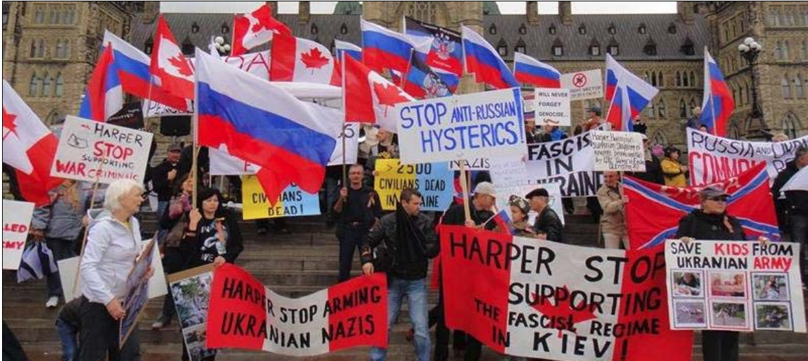
Demonstration in Ottawa October 5, 2015 demanding Canadian government end its support for Ukrainian fascists, which continues to this day under the Trudeau Liberal government.

criminal organization by Nuremberg. Far from being a Remembrance Day it was a Day of Shame, a dishonouring of the dead.