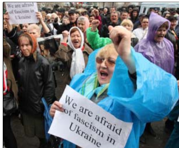
Demonstrations in Donetsk in 2014 against coup government.

At the same time, Canada began providing military intelligence. The Globe and Mail reported on February 12, 2014 that the Harper government was negotiating with the coup regime to provide the Ukrainian military high-resolution images from Canada's RADARSAT-2 satellite twice per day. "RADARSAT-2, a satellite launched in 2007, is operated by Richmond, BC's MacDonald Dettwiler and Associates for the Canadian government and is used for everything from coastal surveillance by the military to mapping and keeping track of sea ice, crops, pollution and ships," the Globe informed. It added, "The Canadian government will stipulate in the agreement that the satellite pictures should only be used to help Ukraine take defensive measures and not offensive operations such as targeting opposing forces." "Defensive measures" presuppose an aggression against Ukraine or an invasion, neither of which was the case. If the surveillance was not needed for defence, then what is its purpose?