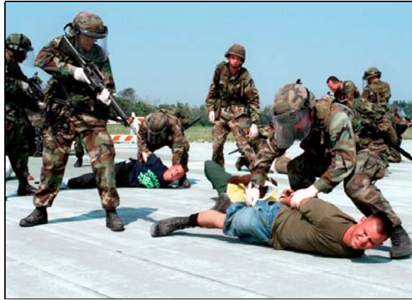
Canadian Forces "training" in crowd suppression, of troops from Ukraine and related "Partners for Peace" of NATO at the U.S. Marine base, Camp Lejeune, South Carolina, 1998.

The danger to the world's people posed by the Jean Chrétien and Stephen Harper campaign for Ukraine's integration into NATO came to the fore at the Bucharest Summit in the capital of Romania on April 2-4, 2008, the clearest example of this pressure and its danger to peace. The venue symbolized the expansion of NATO from the Baltic to the Black Sea, the host government's aims for a "Greater Romania" (including Moldova and parts of Ukraine), and set new goals for years to come. Enlargement of NATO, NATO's crisis in Afghanistan and, for the first time, energy security, were dominant themes. The Bush and Harper administrations demanded the immediate admission of Ukraine and Georgia. France and Germany opposed the move for fear that it would unduly antagonize Russia, on which the EU depended for a substantial amount of its energy. German Chancellor Angela Merkel prevented, against U.S., British and Canadian insistence, Ukraine and Georgia's further rapprochement to the war alliance and not solely out of fear that NATO's eastward expansion could seriously jeopardize German-Russian cooperation. The Konrad-Adenauer Foundation (associated with the Christian Democratic Union of German Chancellor Angela Merkel) had already warned at the end of 2006 that the U.S. sought "to include more pro-