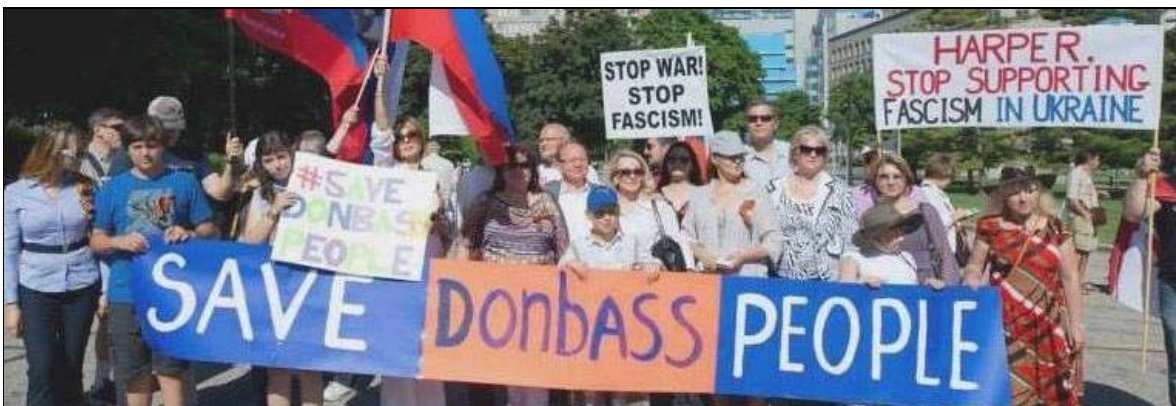
Toronto demonstration, June 23, 2014 supporting Donbass.

Officials tell media that as part of the current mission of the Trudeau government, the Canadian