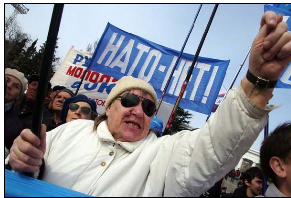
Activists from the Ukrainian Communist Party and Russian Bloc party, hold a banner reading "No NATO!" and chanting "Yankee Go Home!" during a protest as the U.S. Navy frigate Klarkring sails into the Ukrainian city of Sevastopol, the main base of the Russian Black Sea Fleet on March 25, 2009. Following the 2014 coup, the Ukrainian Communist Party was banned along with the public display of "communist symbols."

Nevertheless, during the August War, the Harper government activated the HMCS Ville de Québec to be deployed to the Black Sea as part of a NATO fleet, away from its normal area of operations in the eastern Atlantic (and murky missions in the Caribbean Sea, off the coast of Venezuela, etc.). According to reports from the Canadian Press and Chronicle Herald at the time, NATO was deploying this highly armed fleet of warships to the Black Sea and the Mediterranean, including the Canadian frigate HMCS Ville de Québec fully three weeks before the onset of the Georgian aggression. One hundred and twenty-seven Pentagon advisers were already stationed in Tiflis. It is