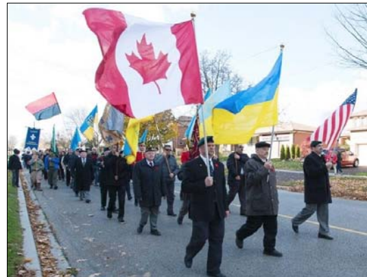
Cadets from Royal Military College, as well as representatives of the Canadian Armed Forces, participate in "Ukrainian Remembrance Day," in Etobicoke, November 11, 2015, alongside supporters of the fascist Ukrainian formations from World War II and supporters of neo-Nazi organizations that are part of the current coup regime.