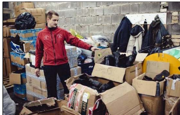
SOS Army warehouse in Kiev, March 2015.

While maintaining the pretense that it was supplying "non-lethal" weaponry, Canada privatized the supply of lethal weaponry to the fascist militias through the creation of Army SOS, a so-called NGO organized by the highest levels of the state through the Ukrainian Canadian Congress, as well as by the Canadian unit of Pravi Sektor (Right Sector) terrorist organization. The armed organization, which played a major role in overthrowing the Yanukovich government, originated as an alliance of right-wing extremist groups. Army SOS maintains a warehouse and a drone factory in Kiev. It has supplied military equipment, including parts for weapons such as sniper rifles, tripwire detonators, targeting software, encrypted communication equipment and drones, directly to the front lines. This has frequently meant bypassing Ukrainian government control and working directly with "nationalist" and outright fascist militias, over which the Kiev regime has only partial control. Wrote Mark MacKinnon in the Globe and Mail , "Most obviously, the fundraising campaign is going where no country, including Canada, is willing to go -- supplying sometimes-lethal equipment to Ukrainian fighters, including irregulars."