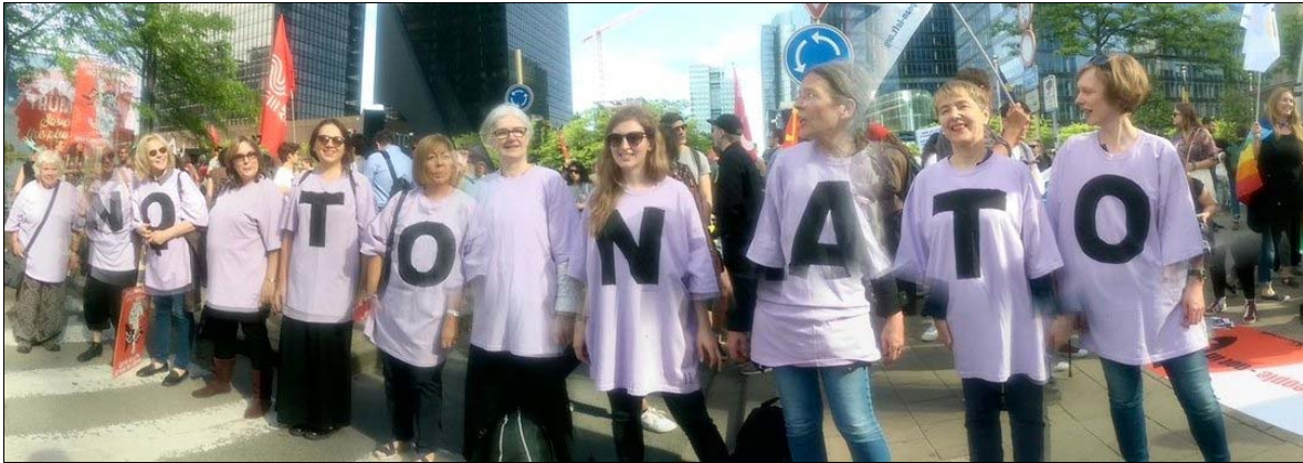
Brussels, May 24, 2017

A controversy arose at the May 24-25 NATO Leaders' Summit in Brussels after U.S. President Trump's remarks at the ceremony dedicating two memorials at the new NATO headquarters: one commemorating September 11, 2001 and the other Article 5 of the NATO Charter, the mutual defence clause. This incident and the response of NATO members underscores the fact that, despite contention within the ruling circles and the private defence contractors and intelligence agencies allied to competing imperialist interests, they also collude to the detriment of the peoples everywhere.