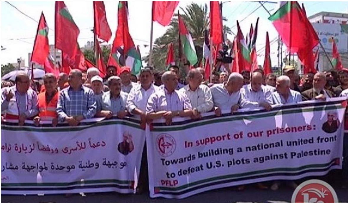
Protest against Trump's visit to Palestine, May 23, 2017.

U.S. President Donald Trump visited Saudi Arabia on May 20 and 21 in his first trip outside the United States since his inauguration. From Saudi Arabia, Trump travelled to occupied Palestine and the Vatican, then attended NATO and G7 meetings in Brussels, Belgium and Sicily, Italy respectively. According to Trump's National Security Advisor H.R. McMaster, the trip was aimed at "reaffirming America's global leadership."