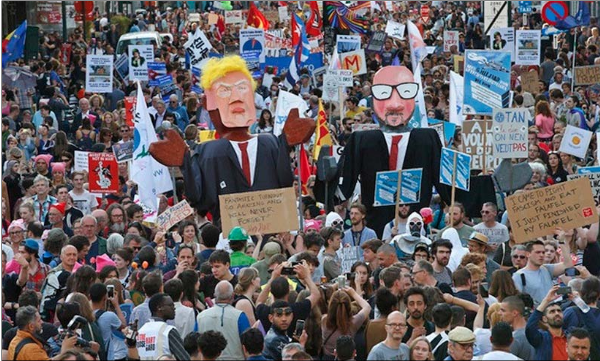
In Brussels 10,000 people participate in march and rally, called by Belgian college students, on May 24, 2017, the day NATO heads of state and government arrived.

opening of a new NATO headquarters that has been under construction since December 2010, revealed sharpening contradictions between European so-called Atlanticists, with whom Canada sided, and the agenda of the U.S. Trump Administration to force NATO members to finance its own war preparations.[1]