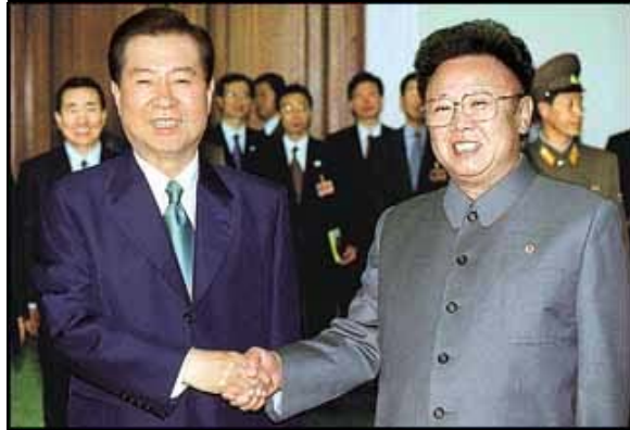
Leader of the DPRK Kim Jong-il (right) and then-south Korean President Kim Dae-jung take part in the historic June 15, 2000 summit of the two Koreas.

to 1948 to ensure that the U.S. could lay claim to all the factories, mines, and other industries that the Japanese had developed in Korea for their war machine during World War Two. The U.S. then instigated the Korean War in 1950 to expand its occupation to all of Korea but this plan was defeated by the Korean people united around the Korean People's Army, which forced the U.S. to sign the Armistice Agreement in 1953.