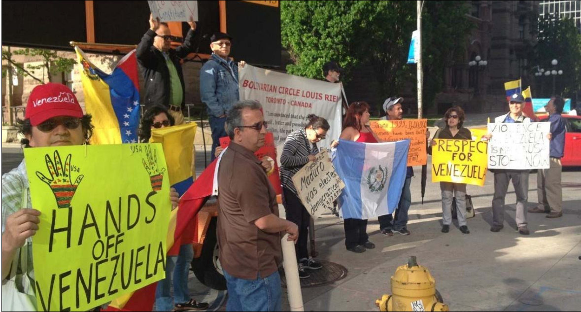
Toronto picket, June 2, 2017

On May 16, the Subcommittee on International Human Rights of the House of Commons Standing Committee on Foreign Affairs and International Development met to hear witnesses speak on "the deteriorating situation in Venezuela." A good part of the discussion centred on how Canada could help "rescue democracy" in that country. The meeting took place one day after an op-ed appeared in the Globe and Mail entitled "Canada can help save Venezuela's democracy." The item was written by Lilian Tintori, who represents a section of the U.S.-linked opposition forces calling for international intervention to help them carry out regime change in Venezuela.