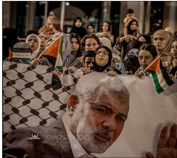
Demonstration against the assassination of Ismail Haniyeh, August 1