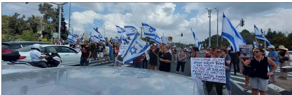
Jerusalem, September 1, 2024

On the evening of September 1, Israelis protested in major cities across the country to demand that Prime Minister Benjamin Netanyahu negotiate a ceasefire and a prisoner exchange deal, after the bodies of six hostages were recovered the night before. Many protesters hold Netanyahu responsible for the deaths of the six captives, arguing that their lives could have been saved if a deal had been reached earlier. An estimated 300,000 took to the streets of Tel Aviv, organizers stated. Protesters also blocked the entrance to Jerusalem on September 1 to protest outside the security cabinet meeting. Demonstrators are also protesting the government as a whole and calling for early elections.