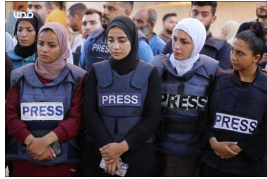
Journalists protest targeting by Israel, August 1, after two Al Jazeera reporters were killed