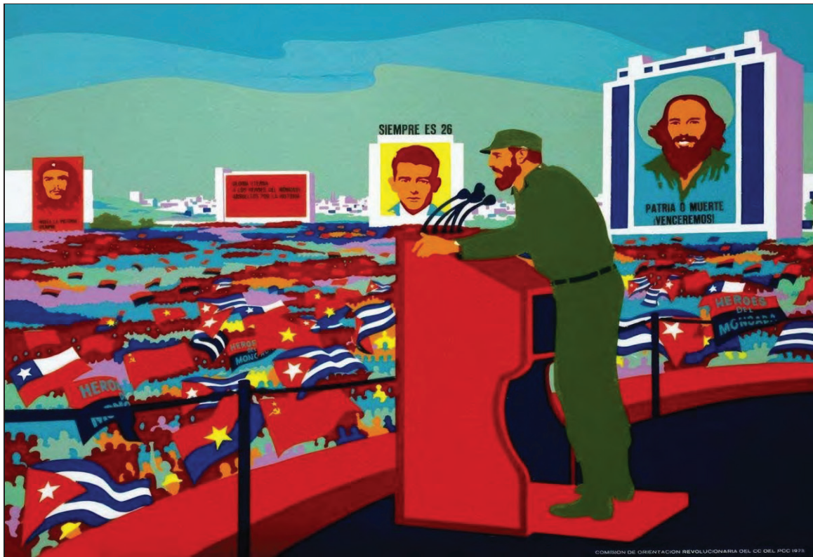
"History Will Absolve Me," poster by Rene Mederos, part of a series of posters commissioned by the Communist Party of Cuba in 1973 on the 20th anniversary of the Moncada attack. The other posters show the untenable situation facing the Cuban people in 1953 under U.S. domination, the preparation for the attack, and finally the launch of the attack under Fidel's leadership, with the patriots disguised as soldiers.