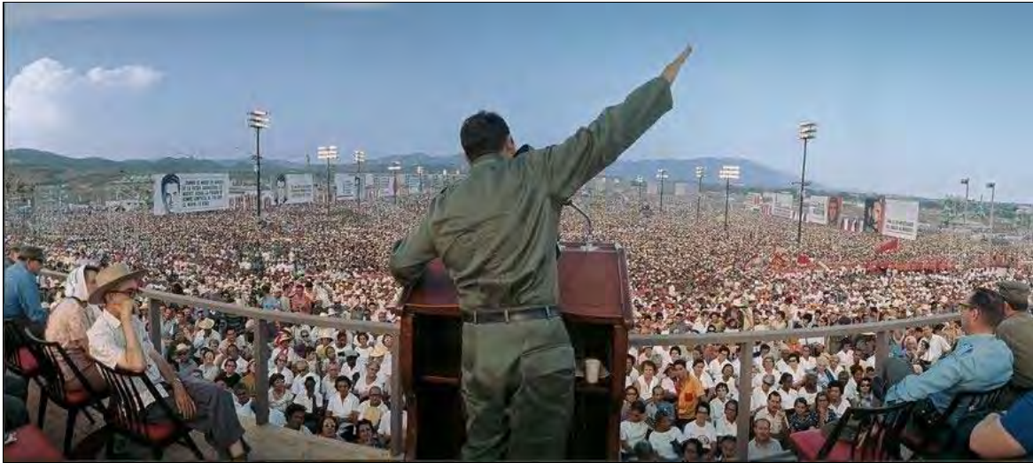
Fidel speaking to the people of Santiago, July 26, 1967.

On the 30th anniversary, in Santiago de Cuba, on July 26, 1983, the Commander said: