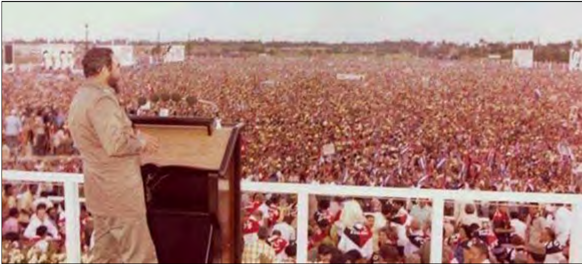
Fidel in Pinar del Río, July 26, 1976.

"[...] what are they this July 26th? An indestructible path that unites the thought, the heroism and the will to fight of the inextinguishable bastion, whose independence Mart wanted so as to prevent and that did prevent the powerful and expansionist neighbour to the north from expanding into the Antilles and falling with that added strength on our lands in America."