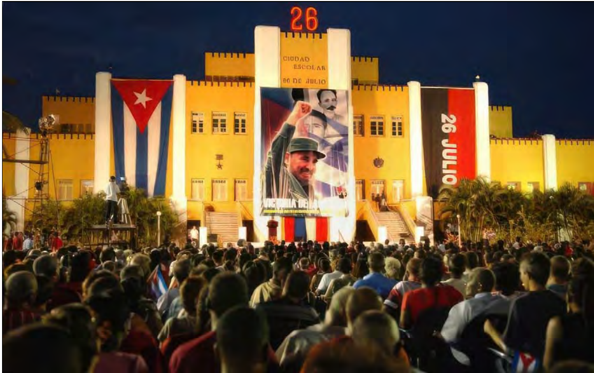
Commemoration of 70th anniversary of the attack on Moncada and Carlos Manuel de Céspedes Barracks, July 26, 2023.

Stand with the Cuban People and Their Revolution!