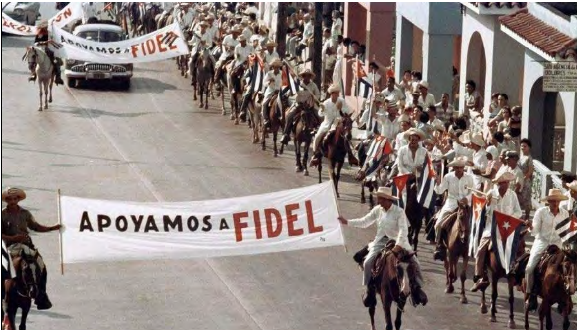
"We support Fidel!!" Havana, July 26, 1959.

"To rectify meant on July 26, 1953, to fight to erase the old, to open a channel, to make a revolution, to create a new life; it means that today as well. Rectify has a really broad meaning, and I am actually satisfied , stimulated by what I see, the results that I see, even though we know that we are still far from all our possibilities, that there are many more possibilities ahead."