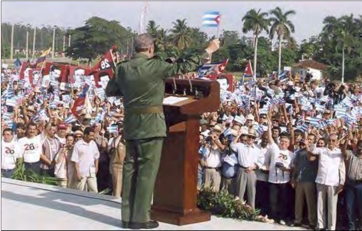
Speech in the Open Tribune in commemoration of the 47th anniversary of the assault on the Moncada and Carlos M. de Céspedes barracks on July 26, 1953, in the Provisional Square of the Revolution in Pinar del Río, August 5, 2000.