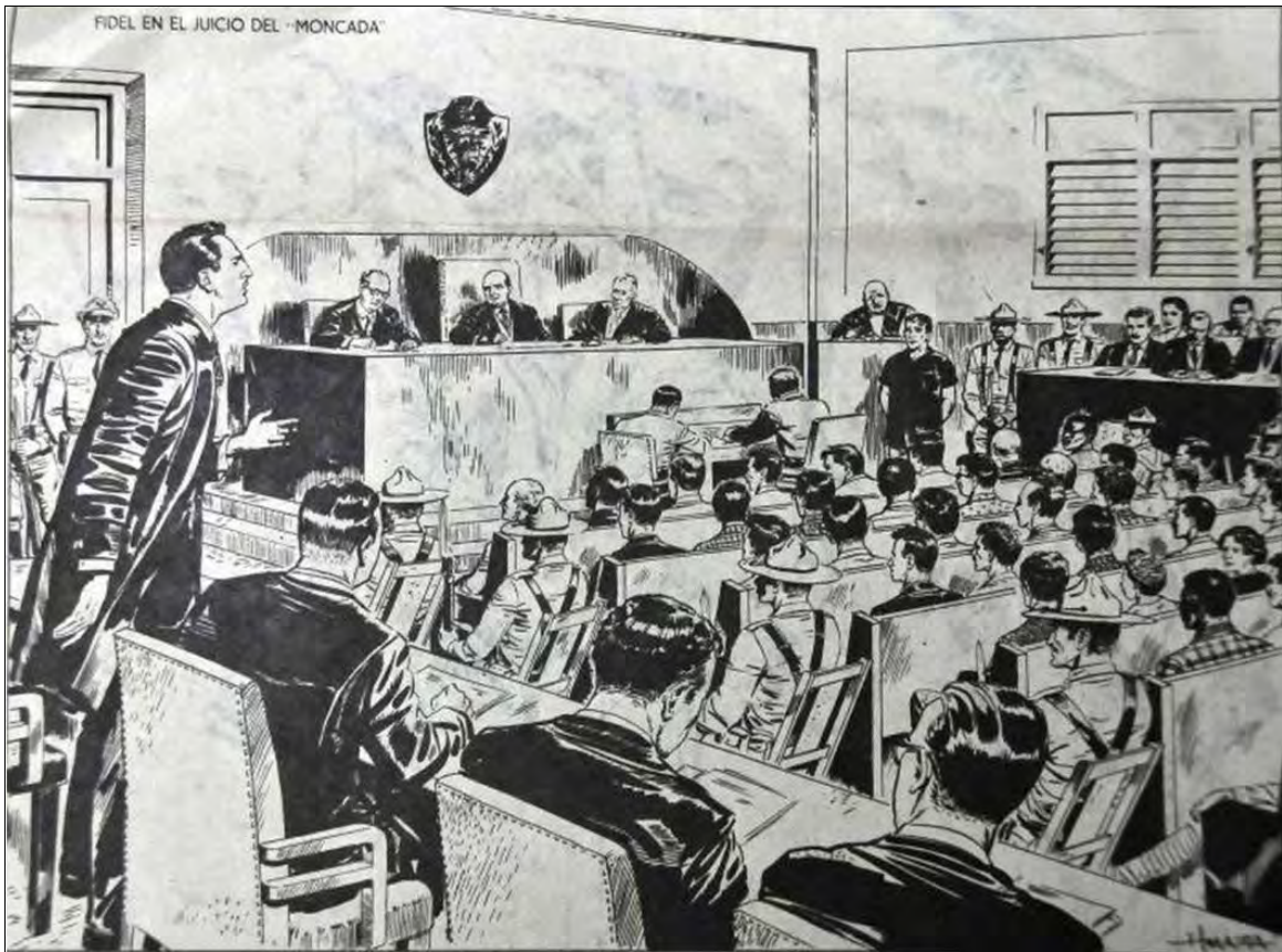
Top: the Moncada martyrs; Fidel imprisoned after the Moncada attack. Bottom: Fidel, demanding the right to defend himself, delivers his famous "History Will Absolve Me" speech.

Most of the Moncada fighters who had been imprisoned, including Fidel Castro, were released after they won amnesty in May 1955 due to the broad mobilization of support from the Cuban people for the aims of the action. They would later regroup in Mexico, joined by Che Guevara and others, returning to continue the armed struggle a year and a half later.