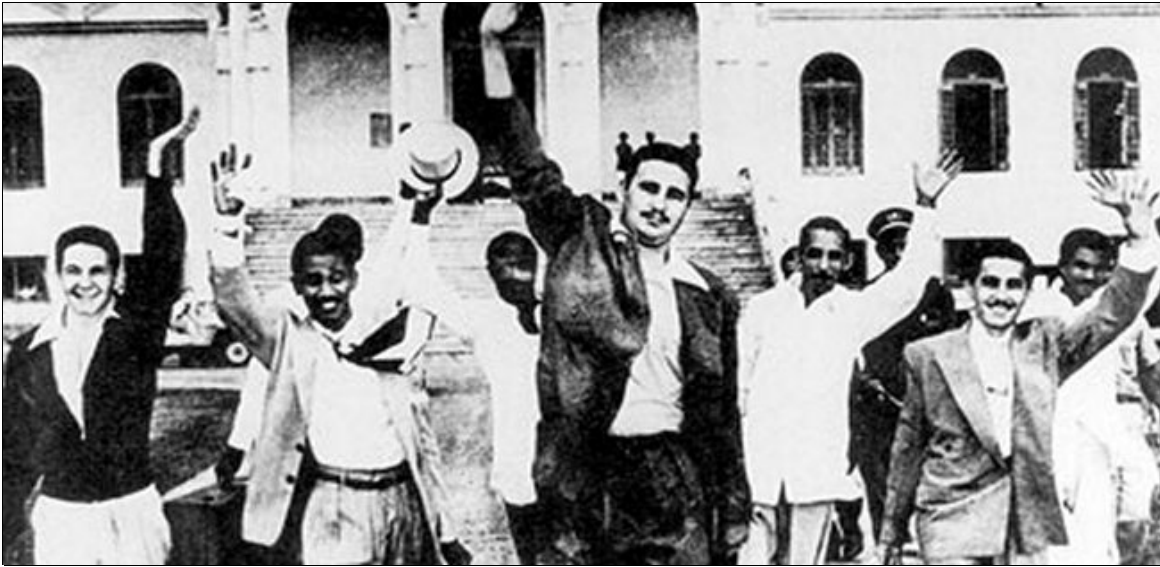
Above, Raúl Castro (far left), Fidel Castro (centre) and other Moncada combatants are released from prison, May 1955.

This audacious action became the rallying cry for the fight of the youth of Cuba for a bright future for themselves and the nation. It played a decisive role in galvanizing the struggle of the Cuban people to affirm their sovereignty, ultimately leading to the victory of the Cuban Revolution in 1959. The action also stirred the revolutionary spirit of the peoples of the world.