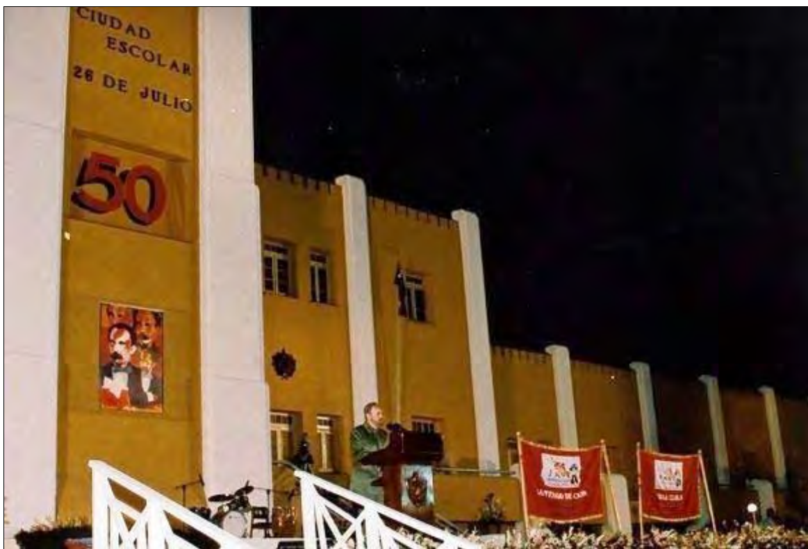
Fidel Castro, Santiago de Cuba, July 26, 2003.

Cubadebate and the website Fidel Soldado de las Ideas are proposing that you walk the path of this historical date today, through the speeches that the Commander in Chief gave on several occasions on July 26.