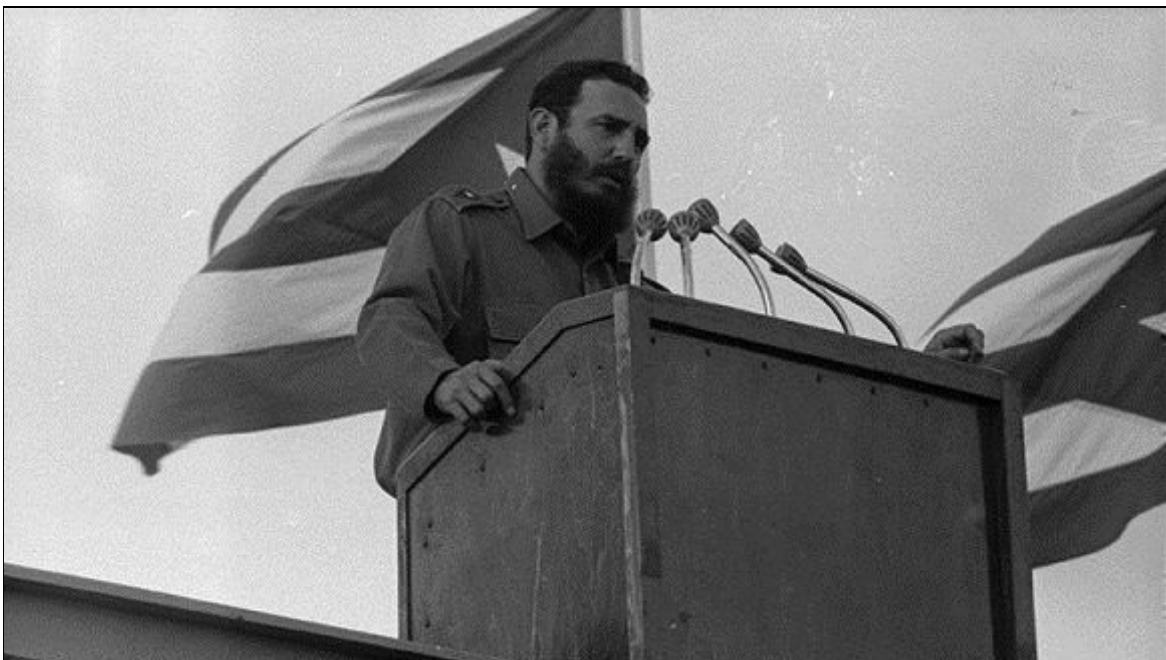
On the 11th anniversary of the assault on the Moncada and Carlos M. de Céspedes barracks held in the city of Santiago de Cuba where the people were responding to the anti-Cuba manoeuvres adopted the day before by the Organization of American States.

(Cubadebate, July 20, 2020. Translated from original Spanish by TML. Photos: Estudios Revolución/Fidel Soldado de las Ideas, L. Lockwood)