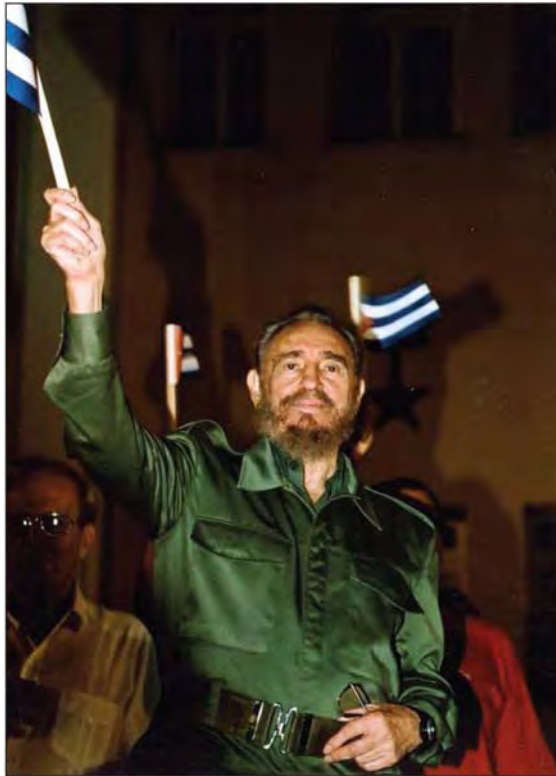
Fidel Castro during commemoration of the 50th Anniversary of the Assault on the Moncada Barracks held in Santiago de Cuba, July 26, 2003

The following article was provided by the editorial team of the website Fidel Soldado de las Ideas and originally published by Cubadebate on July 20, 2020.