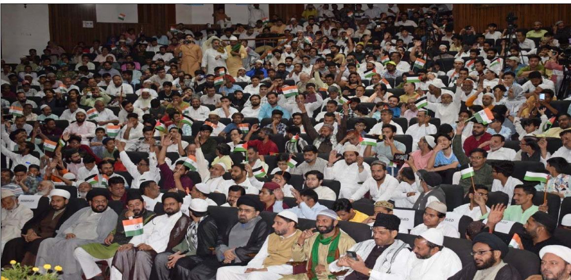
Conference on Palestine, April 5