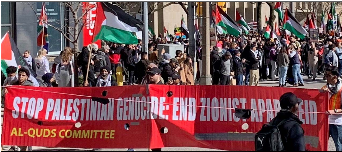
Toronto, al-Quds Day, April 6

The week of April 1-7 was marked by the celebration of al-Quds Day. Millions of people participated in al-Quds Day protests around the world to express solidarity with the Palestinian people and their resistance and to denounce Israeli atrocities and aggression against them. Since 1979 al-Quds Day has been celebrated as an international day to express support for Palestine and oppose the Israeli occupation. "Quds" or "al-Quds" is the Arabic name for Jerusalem and al-Quds Day is celebrated on the last Friday of Ramadan with actions this year taking place on Friday, April 5 and into the weekend of April 6 to 7.