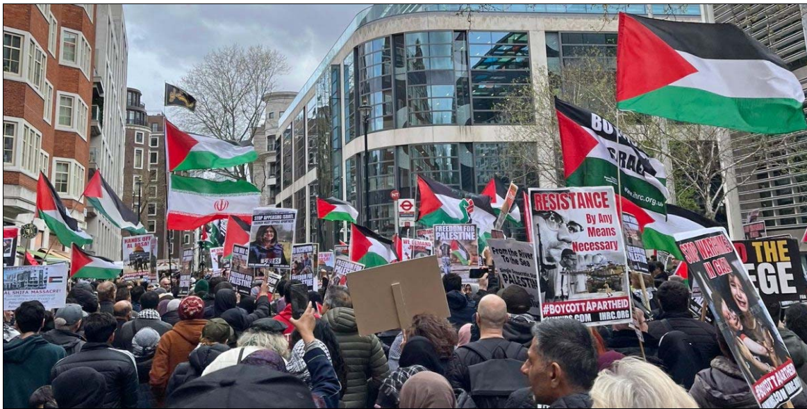
April 5 Bletchley