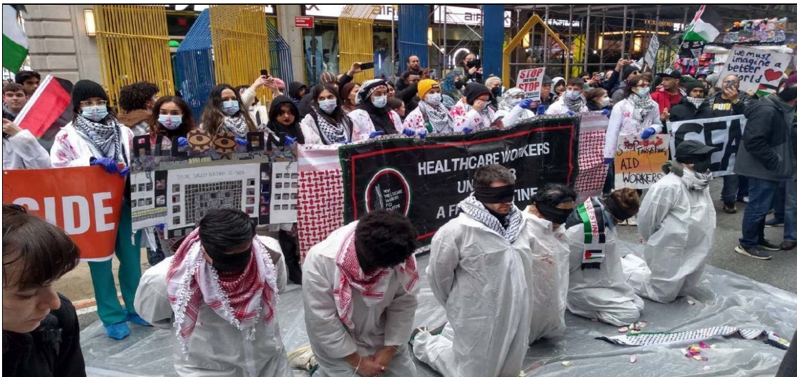
al-Quds Day, April 5