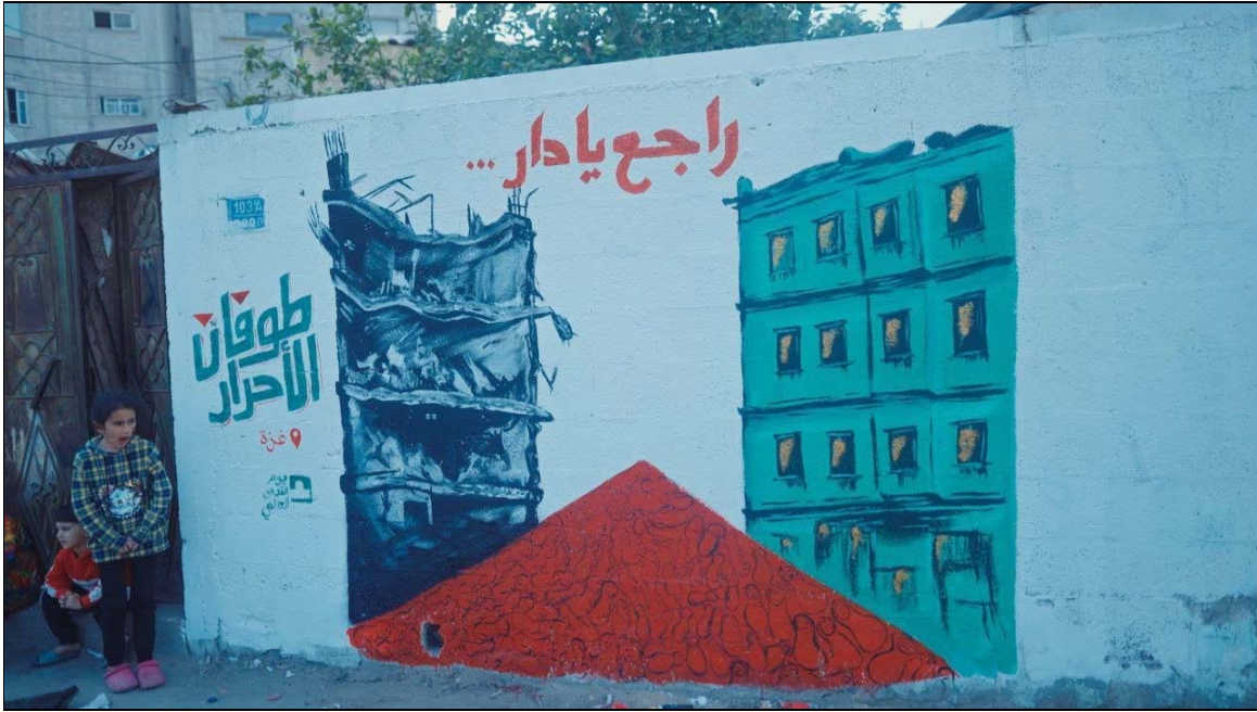
al-Quds Day mural, April 4