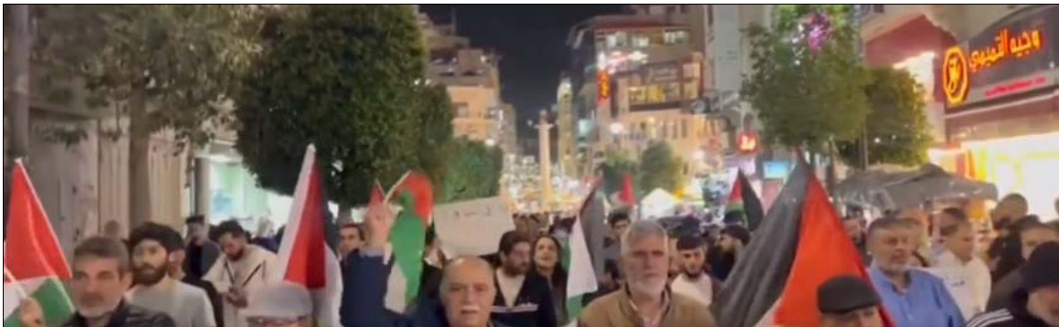
Standing with the Resistance, April 4