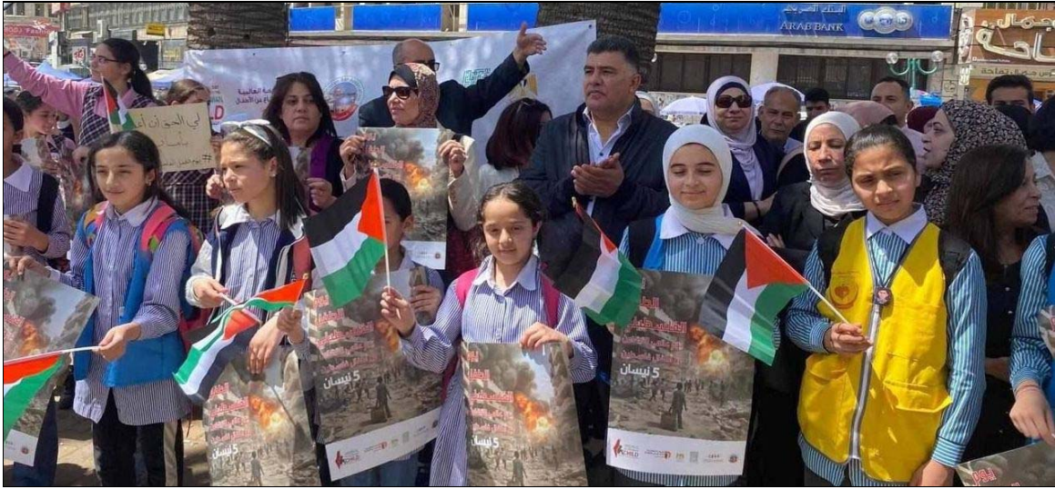
For the children of Gaza on Palestinian Child's Day, April 5