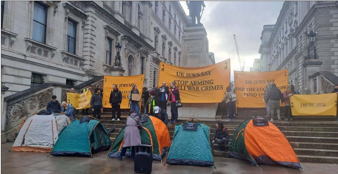
Protest outside Foreign Office, April 2