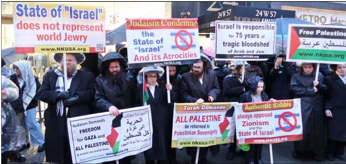
Protest against sale of stolen Palestinian lands, April 3