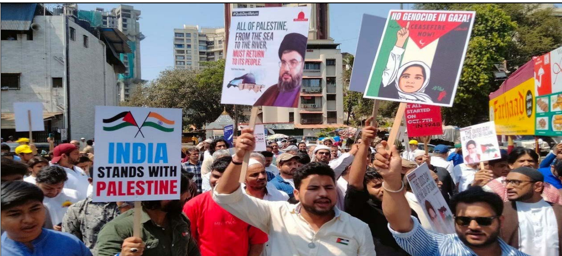
Despite a strict country-wide ban on al-Quds Day demonstrations one took place, April 5