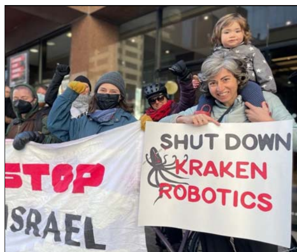
Protest at supplier to Israeli military, Kraken Robotics, March 7