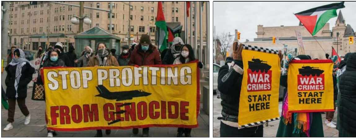
Action at Women in Defence and Security Annual Awards Breakfast sponsored by Lockheed Martin, Boeing, BAE Systems, L3Harris and other weapons companies, March 1

On March 2, more than 1,000 people gathered at the Human Rights Monument in Ottawa and marched for Palestine. A member of the Palestinian Youth Movement spoke before the march, reminding everyone why people have been marching for the past five months. She said: "This has been five months of a genocide of our people in Gaza, of continued massacres of our mothers, fathers, and children. A blockade of food and water in Gaza is causing forced starvation. Just two days ago, we witnessed a massacre of over 100 starving people as they searched for food. It has been five months of attacks on hospitals, health care, of brutal and horrifying attacks on our prisoners. But it has also been five months of glorious and unstoppable resistance. Long live the Resistance!"