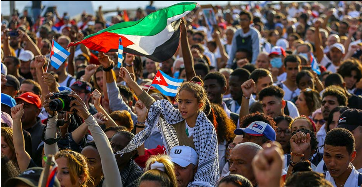
March 2 Santiago