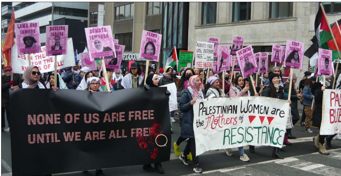
International Women's Day March, March 2