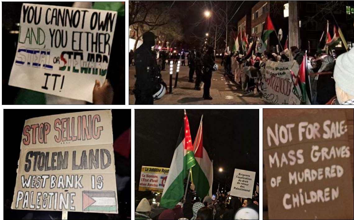
Protest against illegal sales of Palestinian land, March 5

"You can be proud and Jewish and stand for Palestinian lives! We stand here as Jews out of love for Judaism and love for our Jewish community and for the Palestinian siblings. We are building Jewish communities beyond Zionism and beyond settler colonialism. We will reclaim Judaism from colonialism, and we will fight for justice. Free, Free Palestine!"