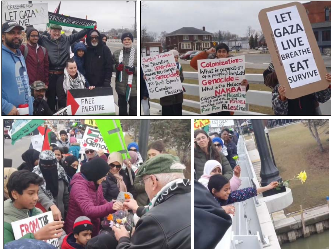
Children toss flowers into the Thames River "bound for the sea" and the children of Palestine, and in representation of the call for a Free Palestine "from the river to the sea," March 2.