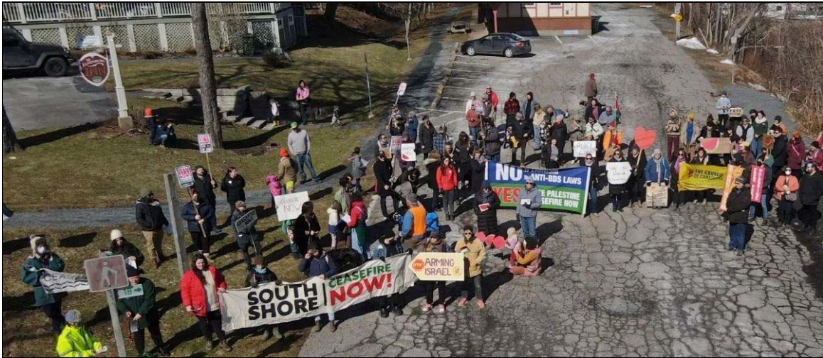
Protest outside Stelia, military contractor doing business with Israel, March 2.