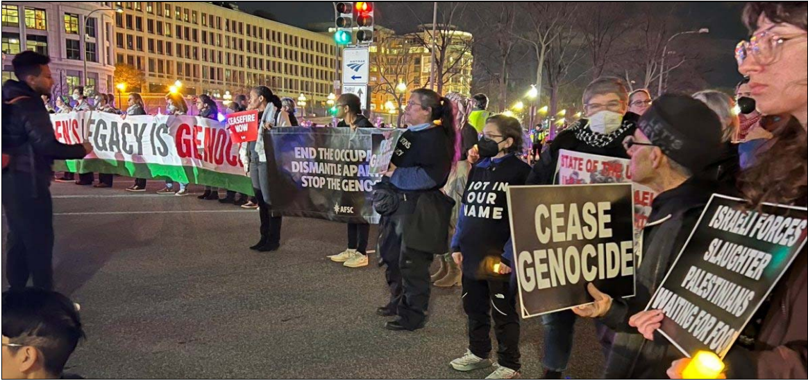
Protest outside U.S. President Biden's State of the Union address, Washington, DC, March 7, 2024