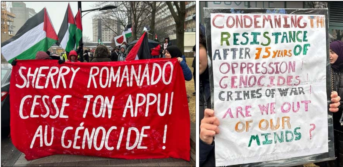
Longueuil metro station, March 2

Montrealers assembled downtown on March 3 with Palestinian flags, banners and placards to reaffirm that they are one with the Palestinian people.