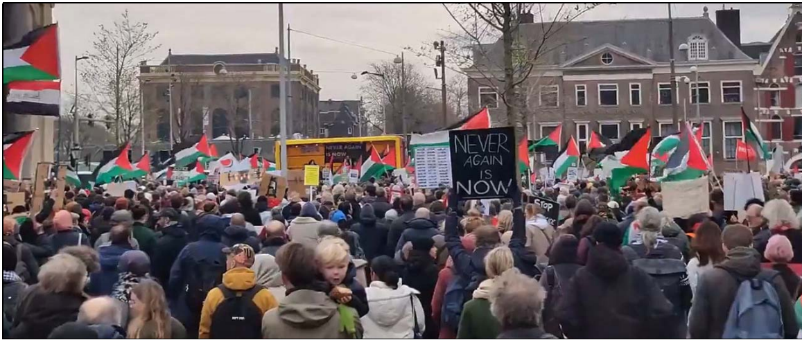
Protest against visit of Israeli Prime Minister Isaac Herzog, March 10.