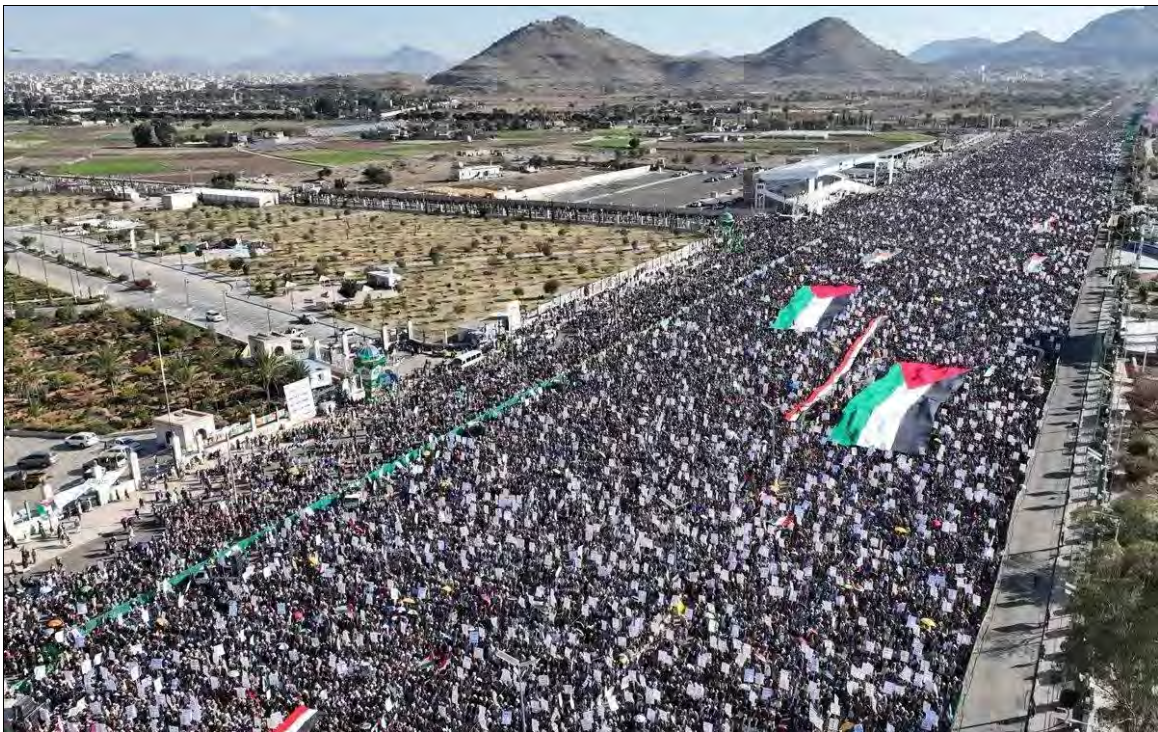
Sana'a, Yemen, February 2, 2024