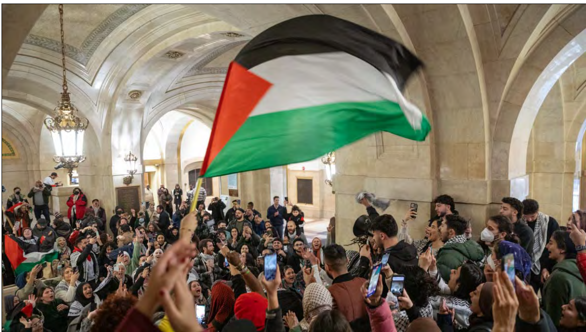
City Council passes resolution calling for a ceasefire in Gaza, January 31.