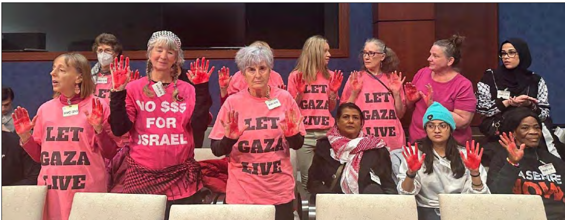
January 30, protest inside Congress opposes defunding UNRWA.