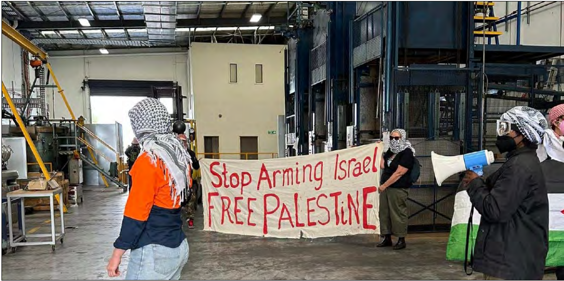
January 31, blocking plant making components for Israeli military.