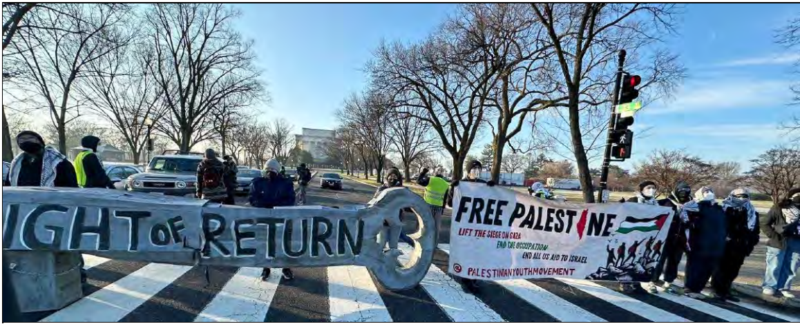
Shutdowns of four highways, February 1.