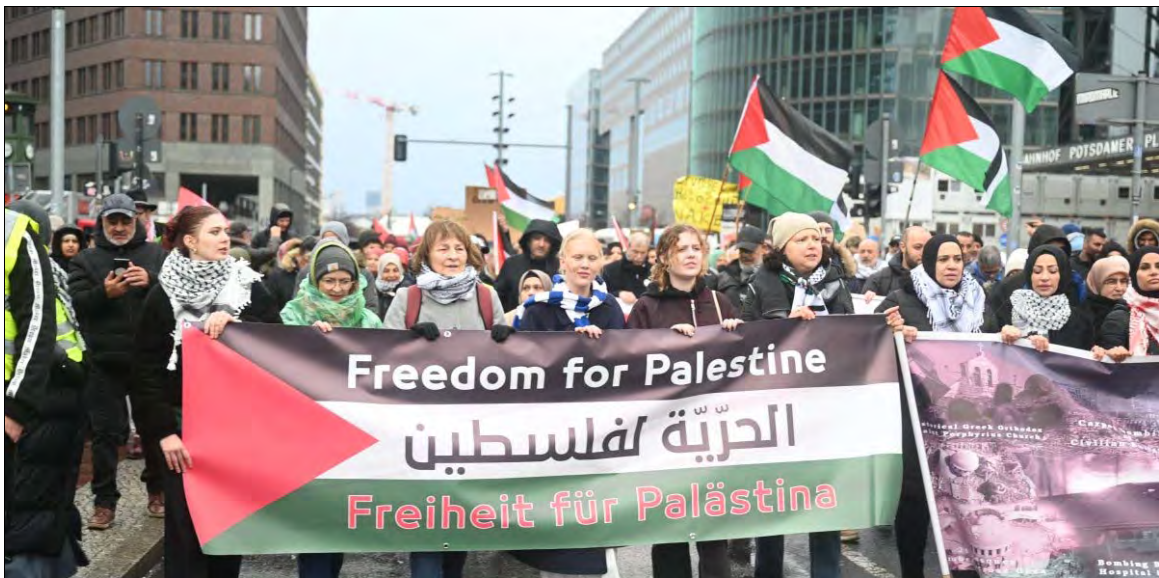
February 3 Munich