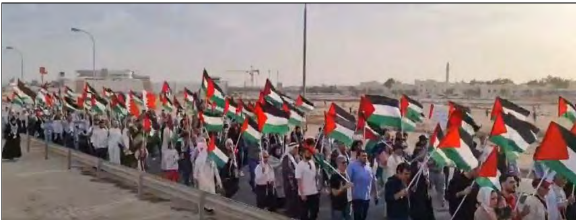
January 27, protest U.S. Navy's 5th fleet stationed in the city