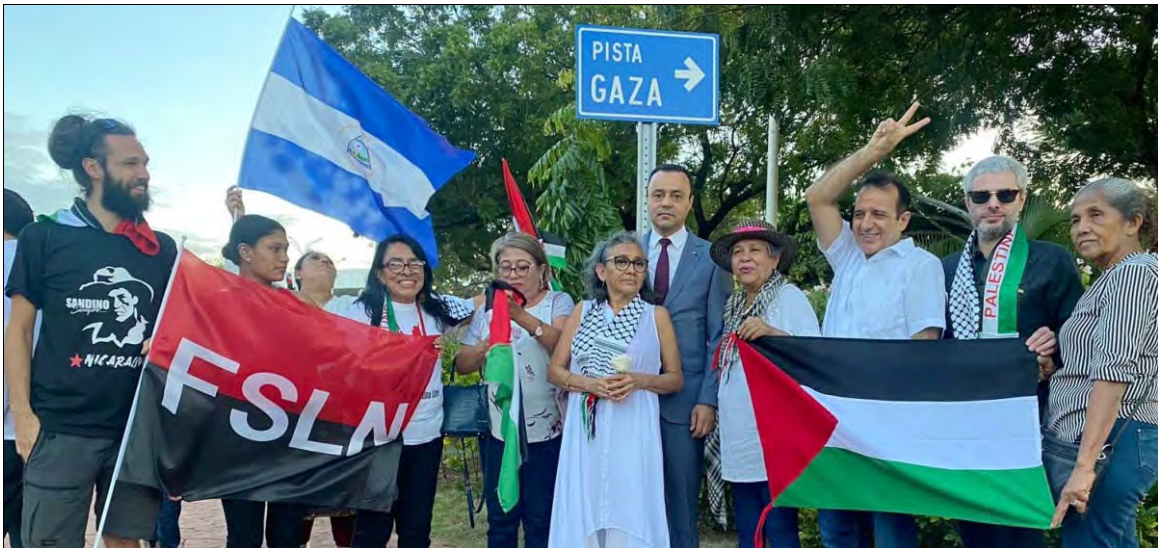
January 30, Inauguration of Gaza Avenue in Managua honouring the resistance and heroism of the Palestinian people