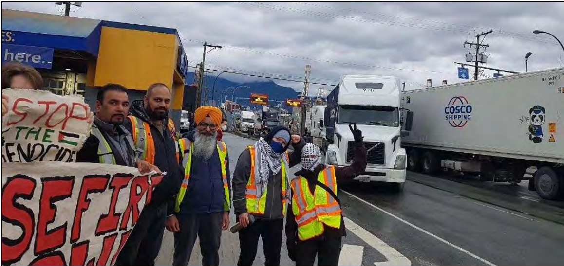
February 1, blockade of Port of Vancouver demanding end to arms shipment to Israel.