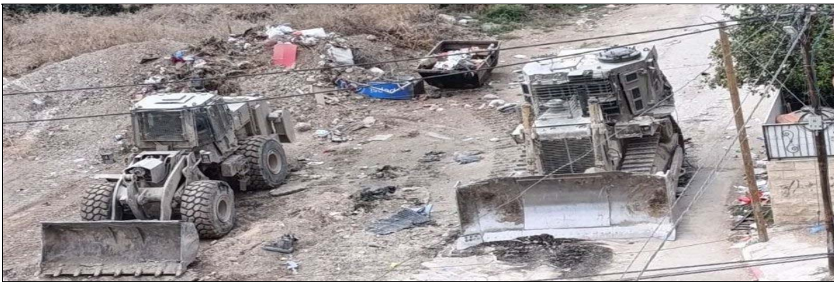
Jenin, September 3, 2024

Since the IOF invasion of the West Bank began 10 days ago, the Zionists have killed at least 39 Palestinians in Jenin, Tulkarm and Tubas, and three in al-Khalil, bringing the total number killed in the West Bank since October 7, 2023 to 691. This number is rising every day while the Resistance seizes the initiative through their actions.