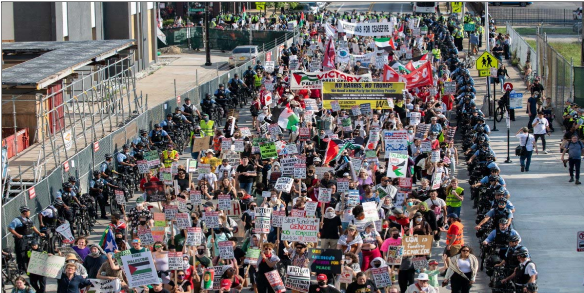
Section of 17,000 plus march in solidarity with Palestine on the opening day of the Democratic National Convention, August 19, 2024

The Democratic National Convention (DNC) was held in Chicago from August 19-22 as a huge pep rally staged to present Kamala Harris as universally loved and chosen by the American people to be the next president of the United States. This attempt by the Democratic Party machine to claim legitimacy was no doubt meant to outdo the similar displays of wealth and power put on by presidential rival Donald Trump. But, in the end, the gawdy parade of glitz and glitter, money, celebrities, influencers and hollow odes to joy all boiled down to crass U.S. chauvinism, jingoism and more of the same.