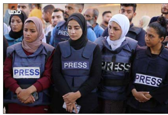
Journalists protest targeting by Israel, August 1, after two Al Jazeera reporters were killed