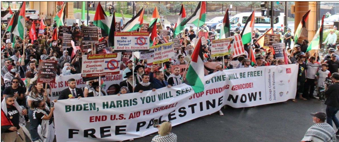
Demonstration on last day of Democratic National Convention, Chicago, August 22, 2024

Long Live the Palestinian Resistance Movement!