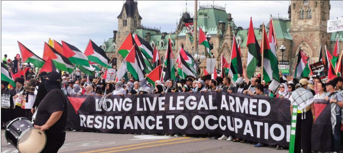
National rally and march, Parliament Hill, August 10, 2024