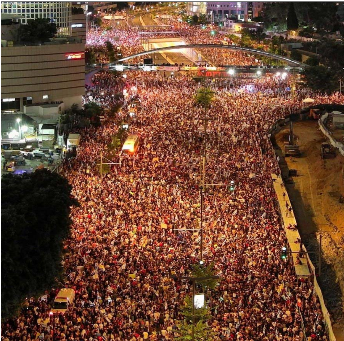
Tel Aviv, September 1, 2024