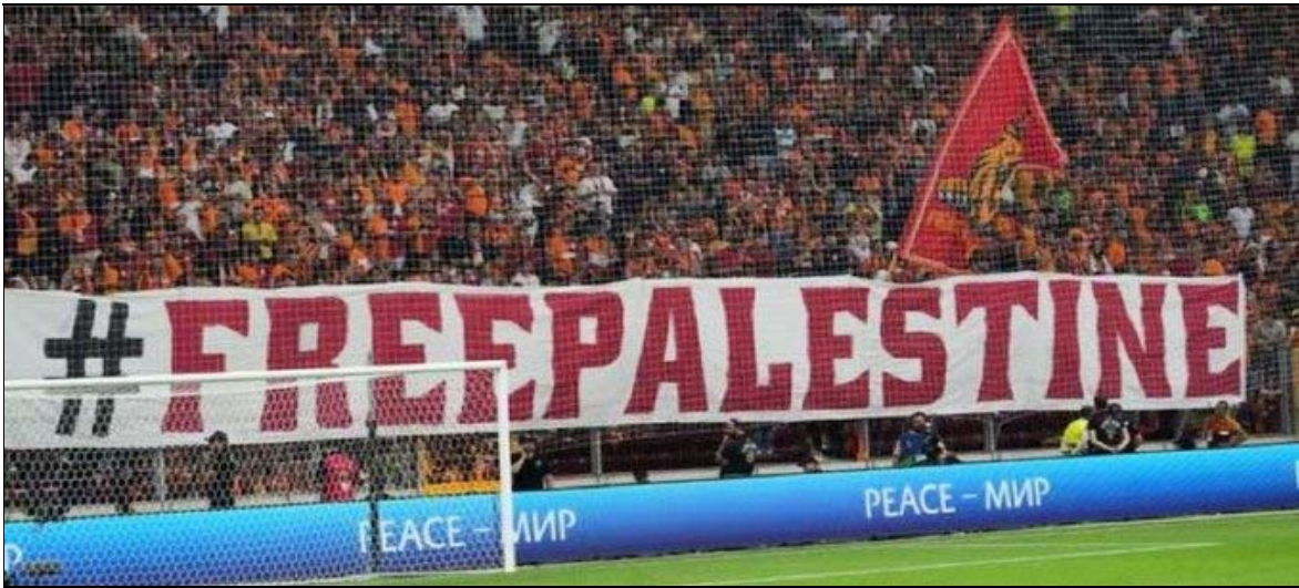
Turkish football fans unfurl banners standing with Palestine, August 27