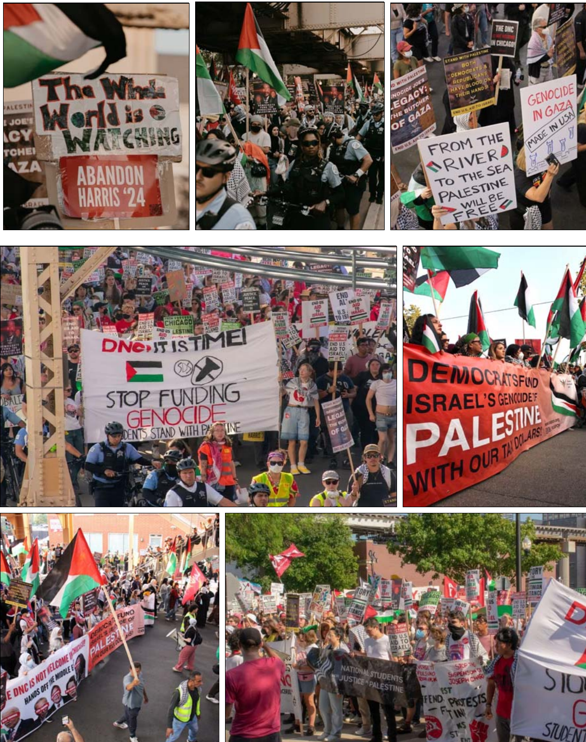
Last day of the convention, August 22