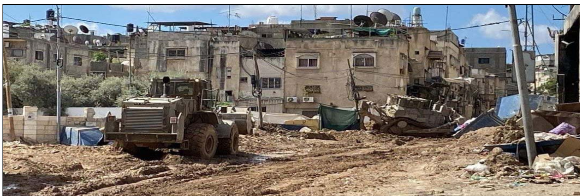
Bulldozers destroy infrastructure in Tulkarm, September 3, 2024

The current depraved Zionist invasion of the West Bank began on August 28 at 1:30 am. The Israeli army launched a large-scale invasion of the northern West Bank with thousands of soldiers. Hospitals were besieged. Bulldozers destroyed infrastructure including not just buildings, houses and roads but also water and sewer systems. At least 11 Palestinians were reported killed with many others wounded that day alone.