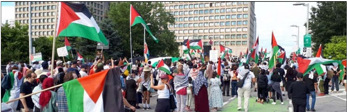
National march for Palestine, August 10

Hundreds of people once again gathered at the Human Rights Monument on August 18, as Israeli violence increases in the West Bank and brutal massacres and torture by the Israeli forces continue in Gaza in the midst of "ceasefire talks" promoted by the U.S., whose renewed military support for Israel exposes the fraud of its claim to be working for a ceasefire.