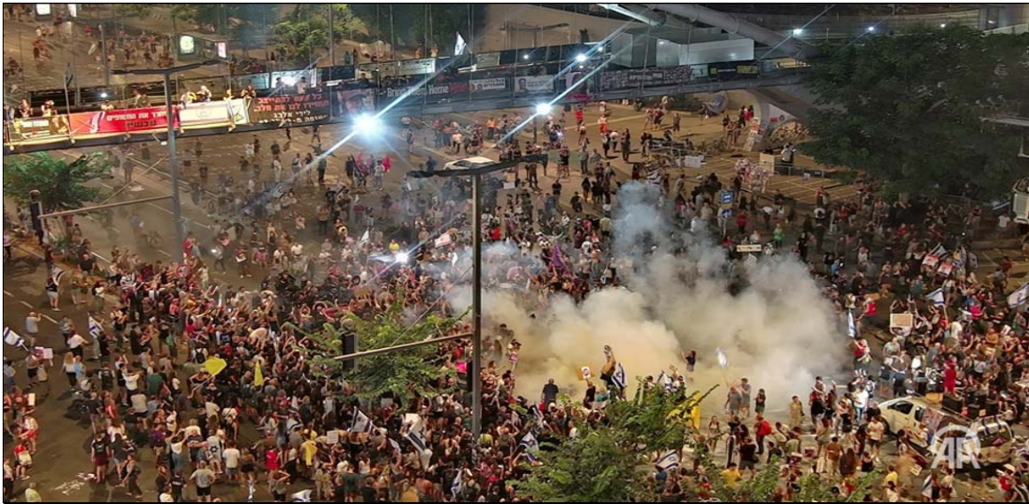
Tel Aviv, September 2, 2024

On the evening of September 1, Israelis protested in major cities across the country to demand that Prime Minister Benjamin Netanyahu negotiate a ceasefire and a prisoner exchange deal, after the bodies of six hostages were recovered the night before. Many protesters hold Netanyahu responsible for the deaths of the six captives, arguing that their lives could have been saved if a deal had been reached earlier. An estimated 300,000 took to the streets of Tel Aviv, organizers stated. Protesters also blocked the entrance to Jerusalem on September 1 to protest outside the security cabinet meeting. Demonstrators are also protesting the government as a whole and calling for early elections.