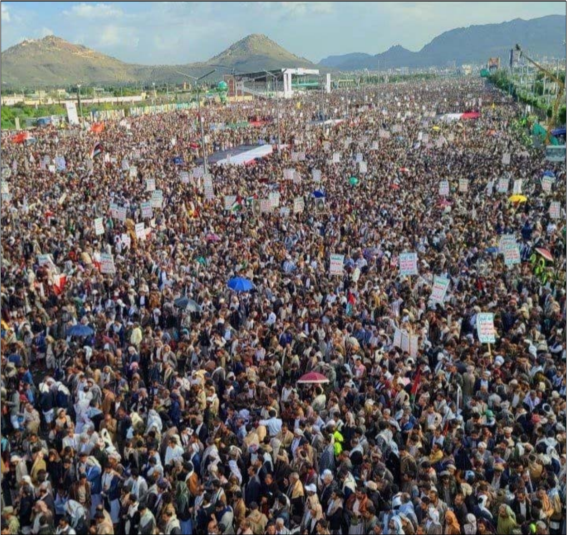
August 16 Al Yemeniyah