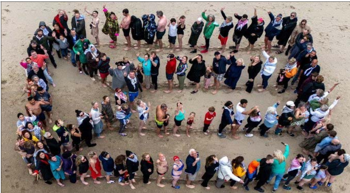
Swimming event in solidarity with Palestine, August 27