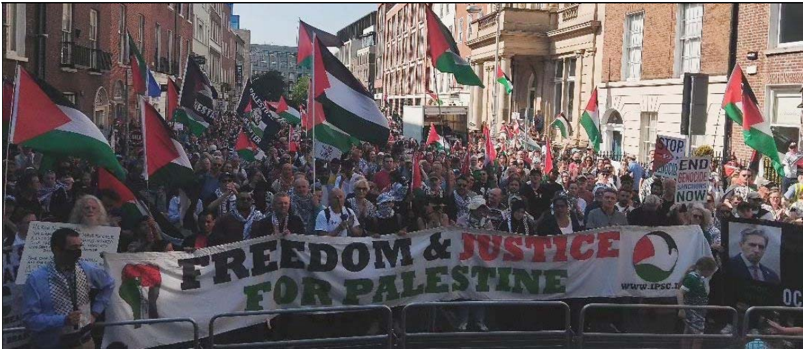
August 31 Burrow Beach