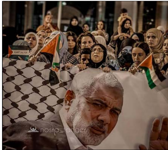
Demonstration against the assassination of Ismail Haniyeh, August 1