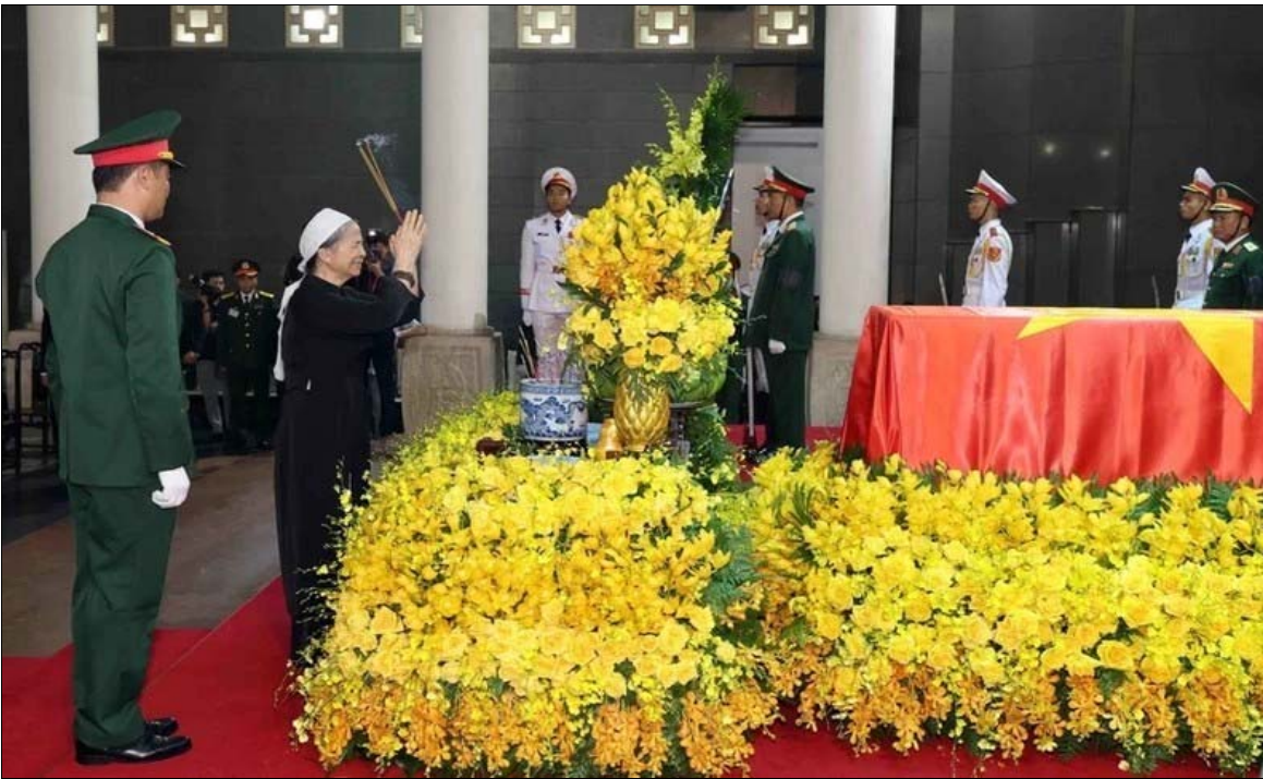
Ngo Thi Man, spouse of General Secretary Nguyen Phu Trong, lights incense to pay her respects.