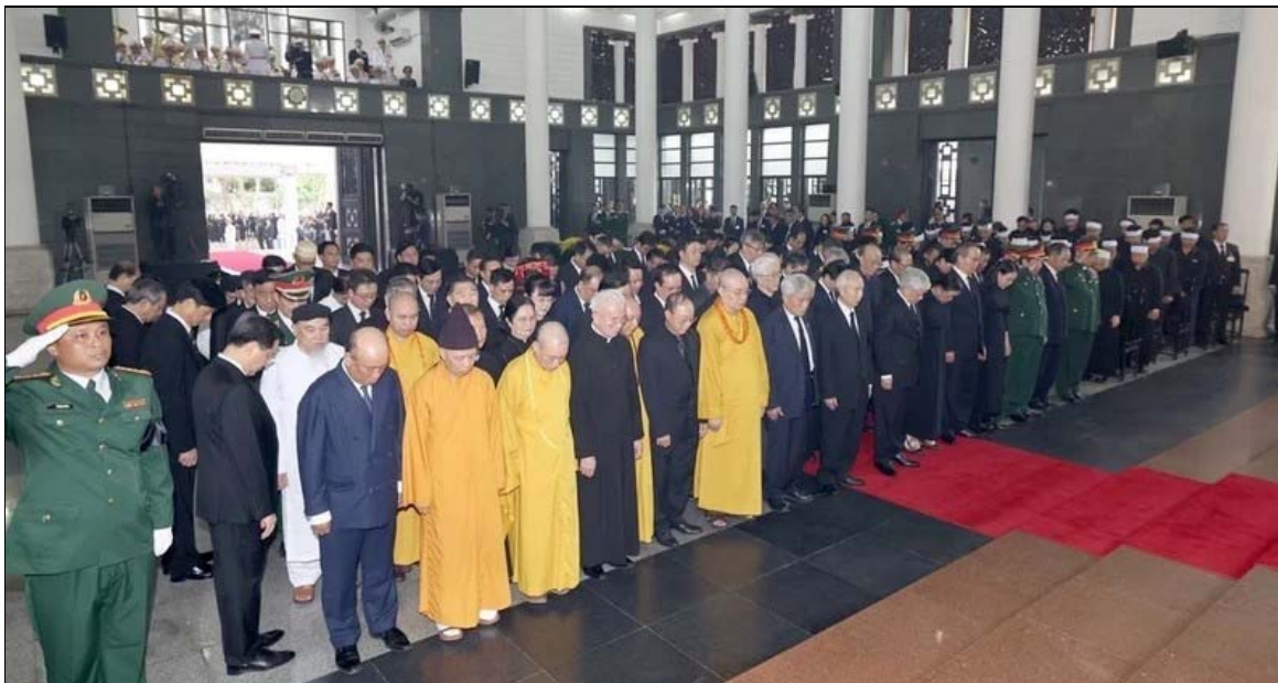
Delegation of the Central Committee of the Vietnam Fatherland Front pays its respects.