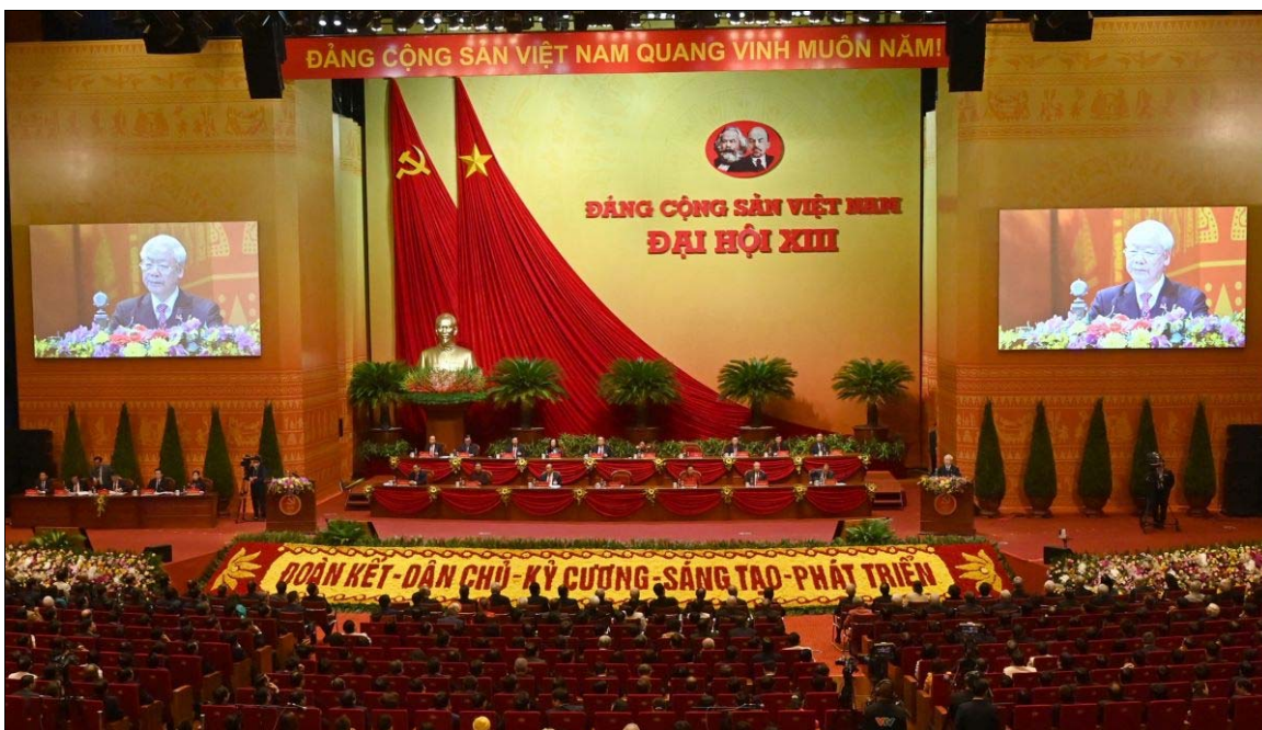
General Secretary Nguyen Phu Trong speaks at the 13th Party Congress, January 25 - February 1, 2021.

The passing of General Secretary Nguyen Phu Trong causes deep grief for the entire Party, armed forces and people. He was one of the Party and State's most outstanding leaders. During more than 13 years as General Secretary of the Communist Party of Vietnam, he has remained steadfast in the Party's reform policy, independence and self-reliance policy. He was at the helm and led the country, along with the Party, to overcome numerous challenges and record impressive achievements in all fields.