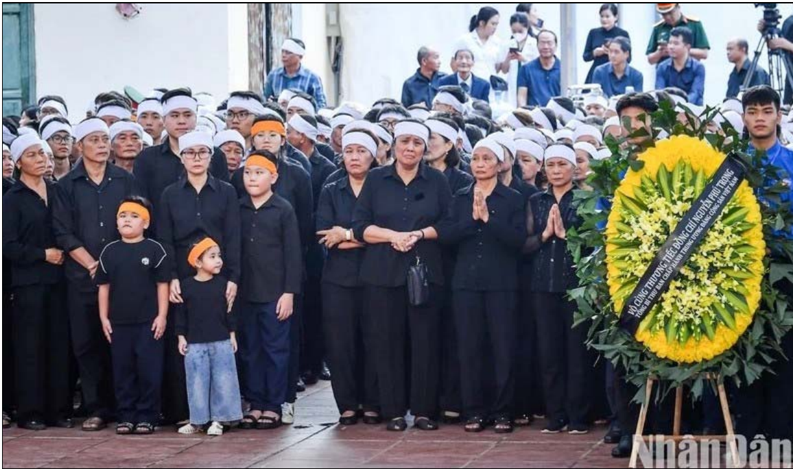
Memorial Service and Funeral Procession, Hanoi