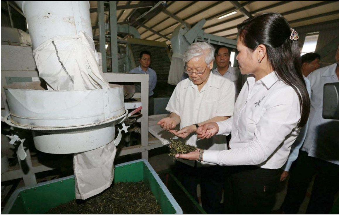
General Secretary Nguyen Phu Trong visited Sen Cha Tea Factory of Tam Duong Tea Development and Investment Joint Stock Company in Ban Bo Commune, Tam Duong District, Lai Chau Province.

The notable achievements that have driven the aforementioned strong development of the country are the collective efforts of the Politburo, the Party Central Committee, the Government, and the entire political system over many tenures. They are the inheritance and continuation of the achievements from the nearly 40 years of Doi Moi (Renewal), with the significant role of comrade Nguyen Phu Trong as the Party leader for over 13 years.