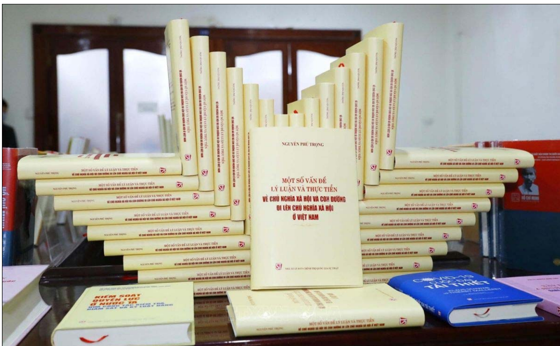
Party General Secretary Nguyen Phu Trong's book titled "Some theoretical and practical issues on socialism and the path towards socialism in Vietnam."

Socialist orientation is mainly implemented using market tools and social security policies, not non-market intervention in the economic operation. Vietnamese Party fully affirmed this viewpoint when Nguyen Phu Trong was General Secretary. Currently, 72 countries recognise that Vietnam has a market economy, including all ASEAN countries and large market economies, such as Japan, the UK, Canada, and Australia.