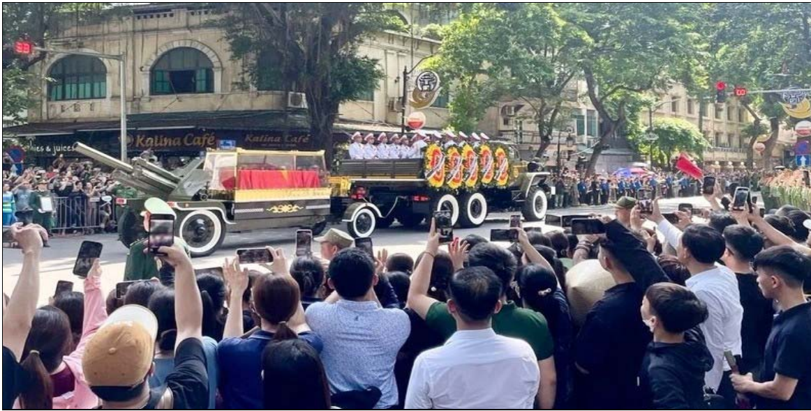
Tens of thousands line the streets for funeral procession in Hanoi, July 26, 2024, to say their farewells.