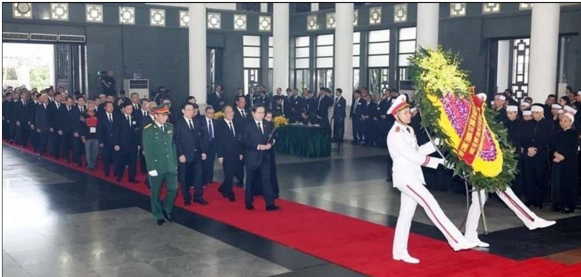
Delegation of the National Assembly, led by Politburo member and Chairman of the National Assembly Tran Thanh Man, pays respects.