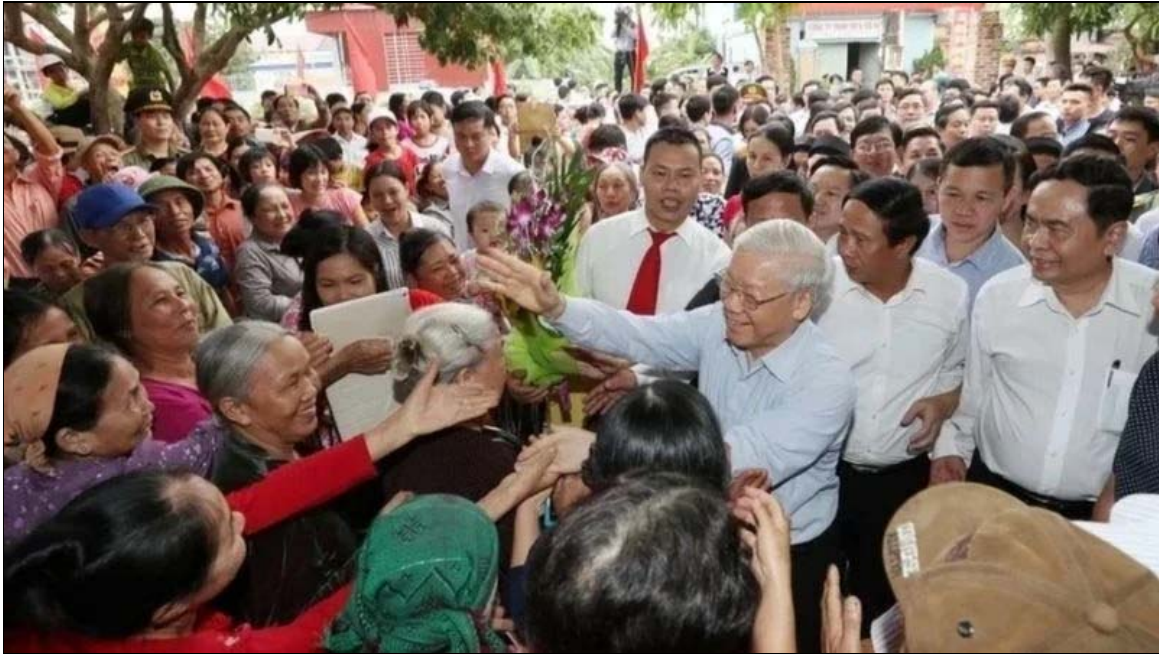
General Secretary Nguyen Phu Trong joins people of Thuong Dien Village, Vinh Quang Commune, Vinh Bao District at the Great National Unity Day of Hai Phong City, on November 15, 2017.

Nguyen Xuan Phuc is a former Politburo member, former Prime Minister, former President. Nhan Dan is the official newspaper of the Communist Party of Vietnam.