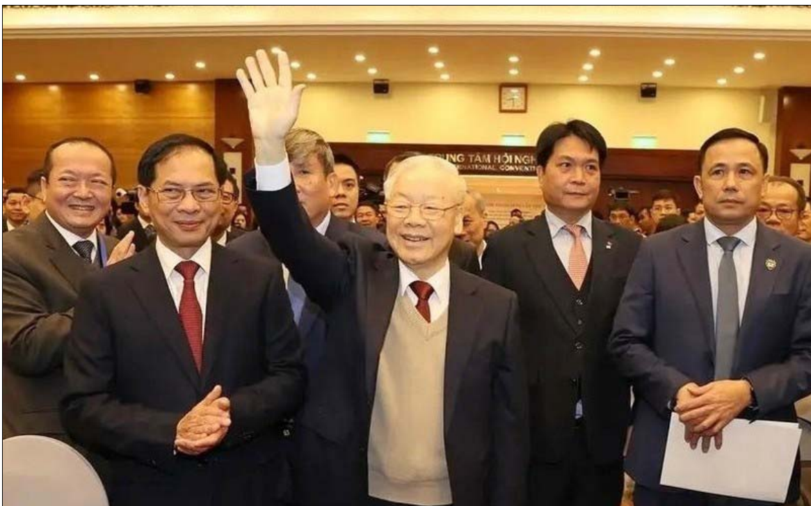
Party General Secretary Nguyen Phu Trong (centre) attends 32nd national conference on foreign affairs.