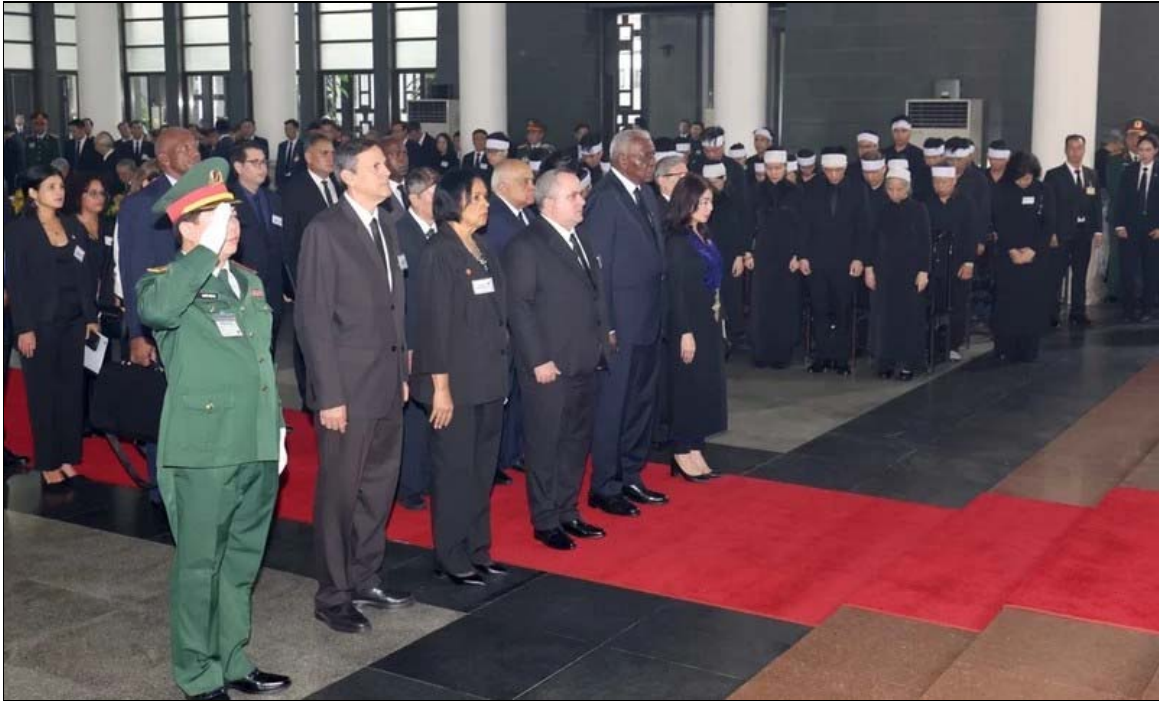
The Cuban delegation, led by President of the National Assembly of People's Power of Cuba Esteban Lazo Hernandez, pays its respects.