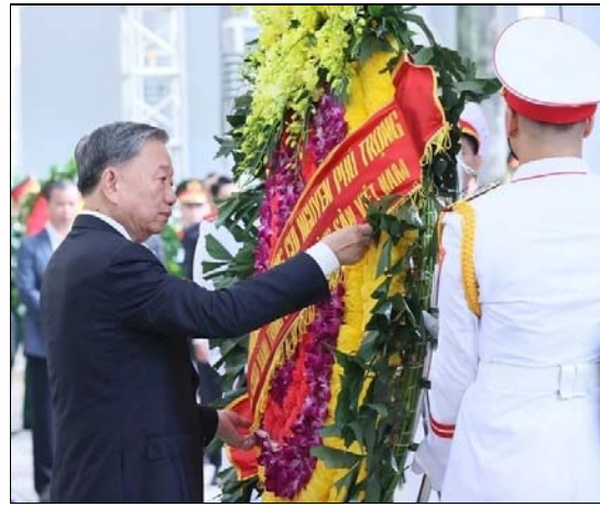
Delegation of the Central Committee of the Communist Party of Vietnam, led by Politburo member and President To Lam, pays respects, July 25, 2024.