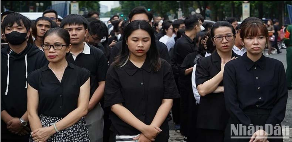
Lai Da Village, General Secretary Nguyen Phu Trong's Hometown