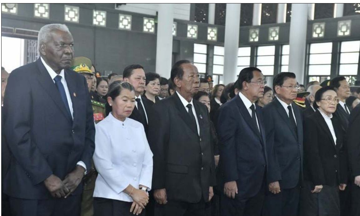
International delegations participate in Memorial Service, July 26, 2024

At the burial service leaders and former leaders of the Party, state and the Vietnamese Fatherland Front, comrades, the public, international friends and family placed flowers and paid silent tribute before Comrade Trong was laid to rest.