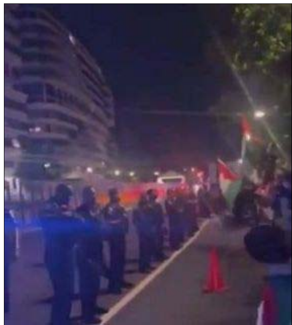
Protest outside hotel where Netanyahu was staying, July 23