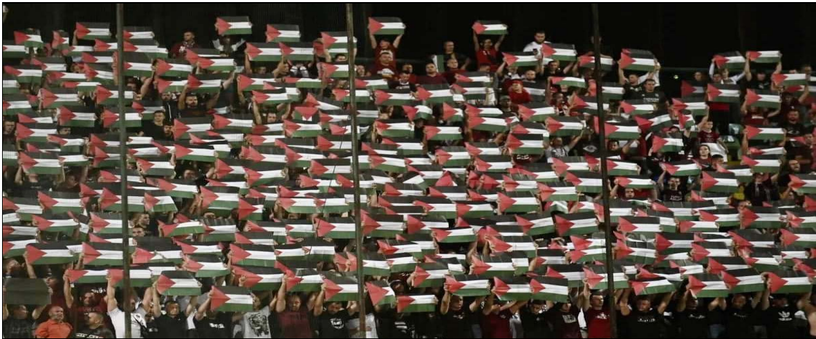
Flower of Srebrenica in the colors of the Palestinian flag is displayed by fans of Sarajevo's Horde Zla team during their European football championship match, July 19