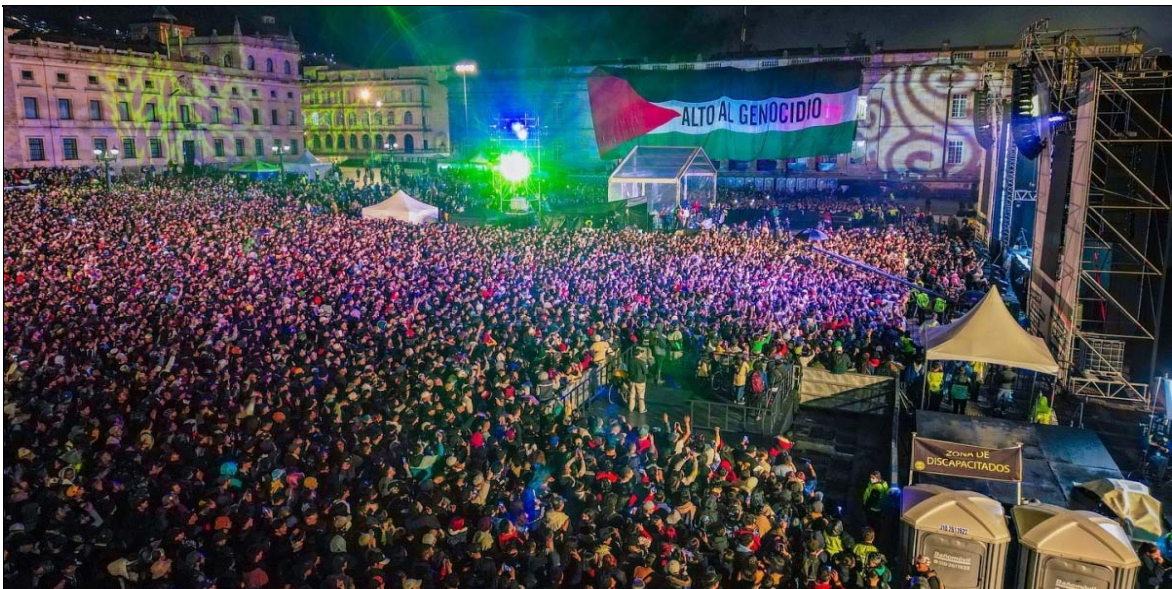
"Hope and Solidarity" concert for Palestine at the Plaza de Bolivar, July 5