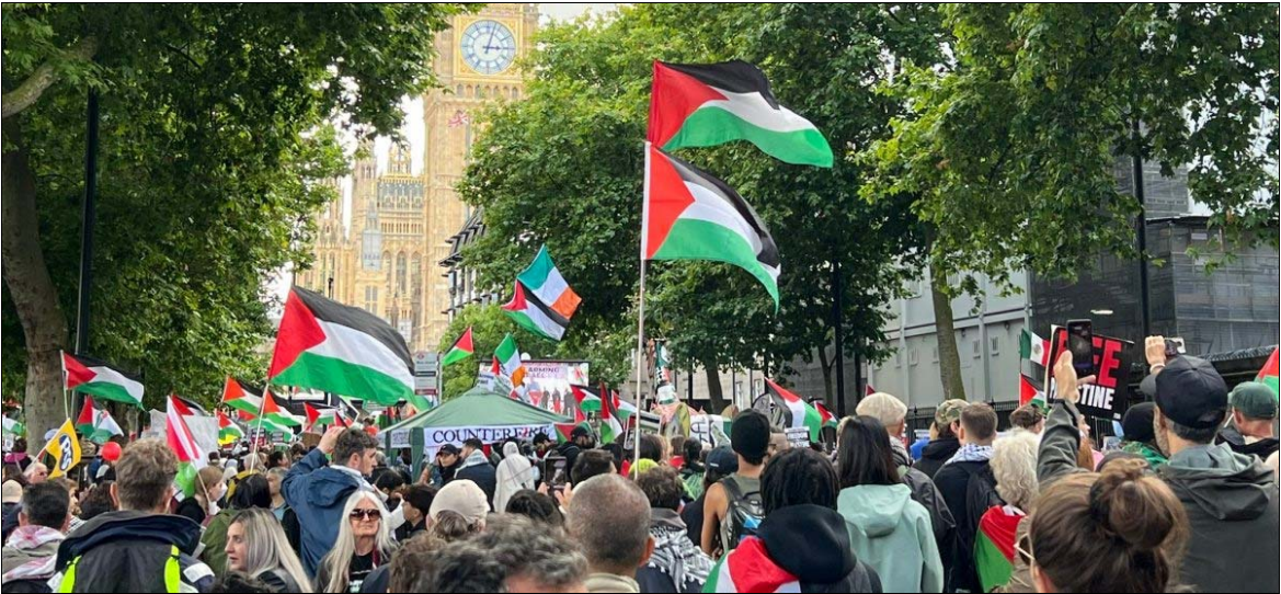
National demonstration July 6, two days after general election