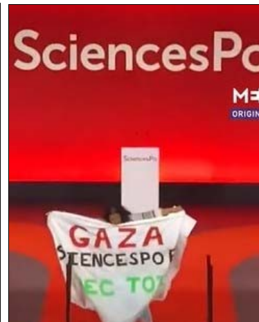
Students graduating Sciences Po university take their stand with Palestine, July 2