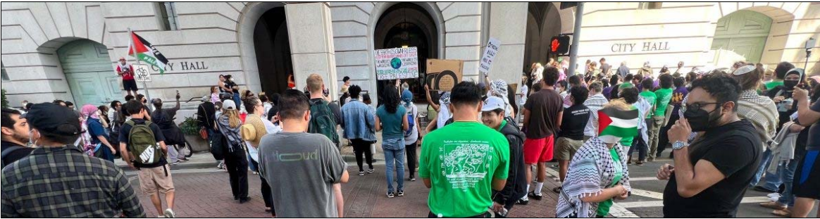
Opposition at Los Angeles City Council to city funding Zionist militias, July 2