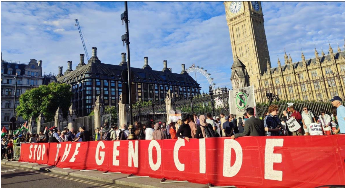
Demonstration surrounds British parliament in London, England on the first sitting day of the new government, July 18.