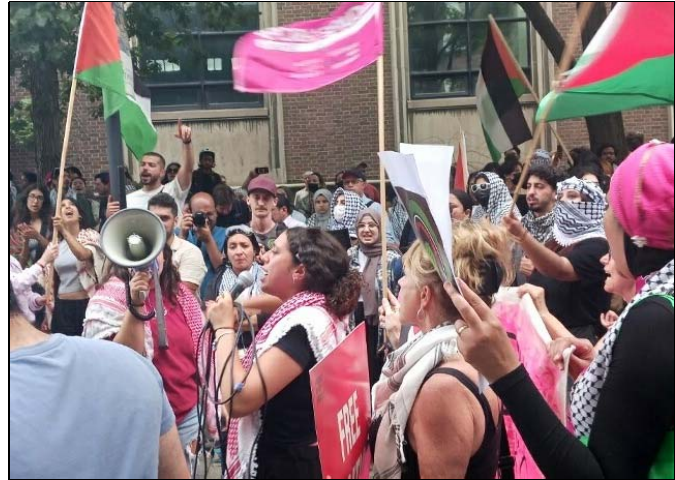
Rally closing the University of Toronto encampment, July 3