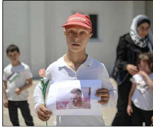
Children with Down Syndrome protest Israel's brutal murder of a young Palestinian with the same condition, July 19