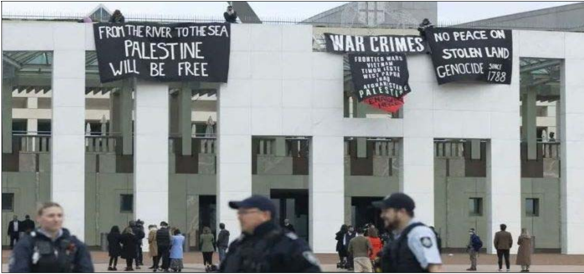
Banners hung on parliament building, July 3