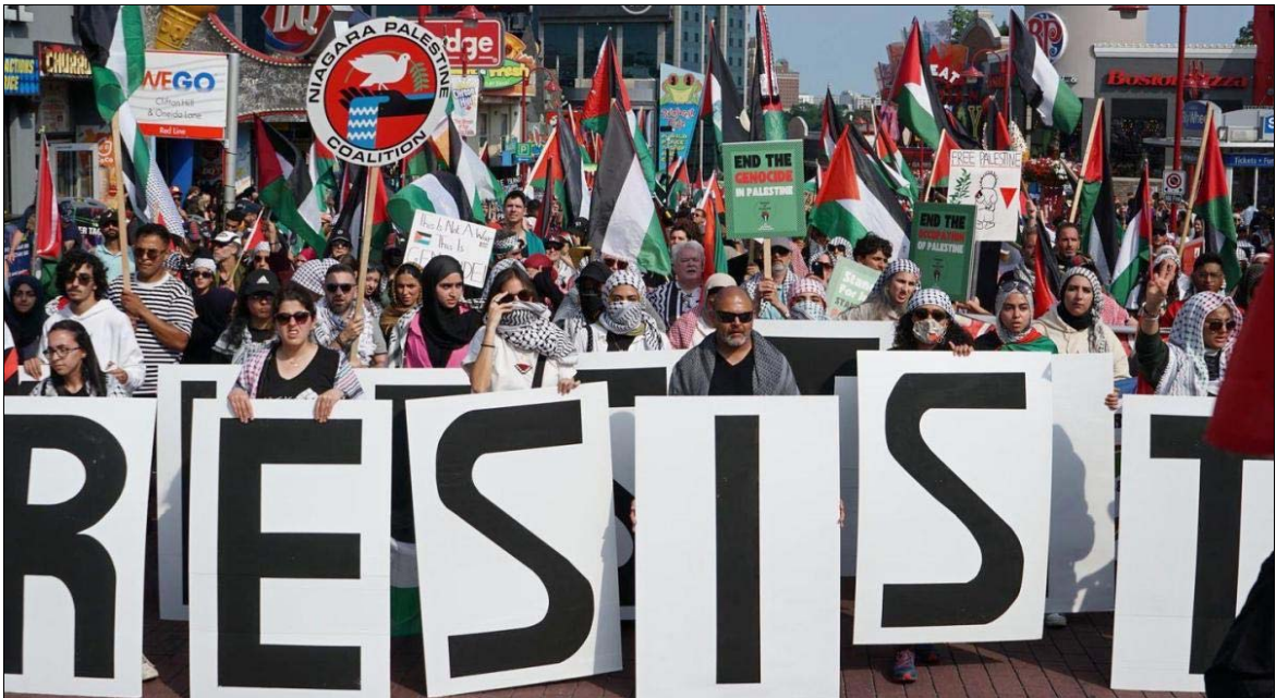
Canadian side of border, July 21