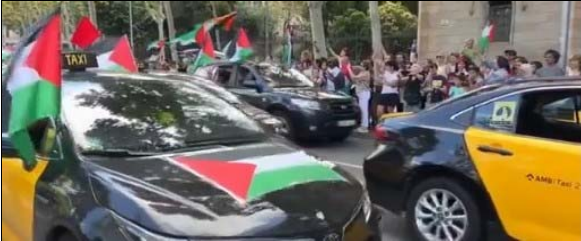
Taxi drivers rally, July 8