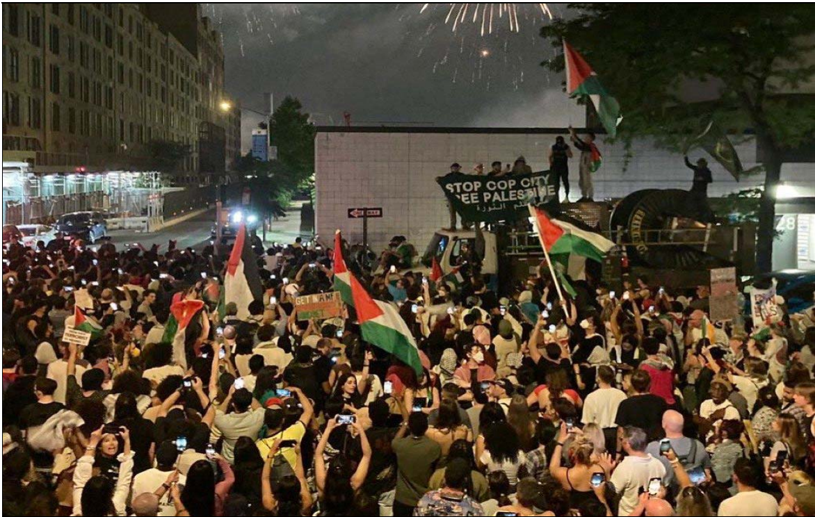
No Celebration of July 4 -- all Out for Palestine rally, July 4