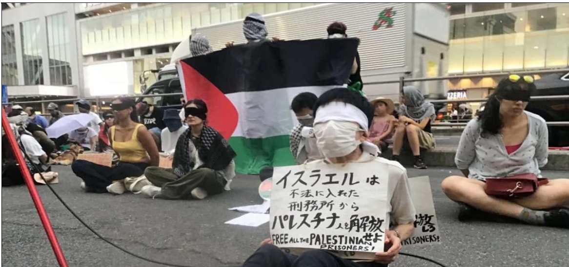
Protest against Israeli treatment of Palestinian prisoners, July 21