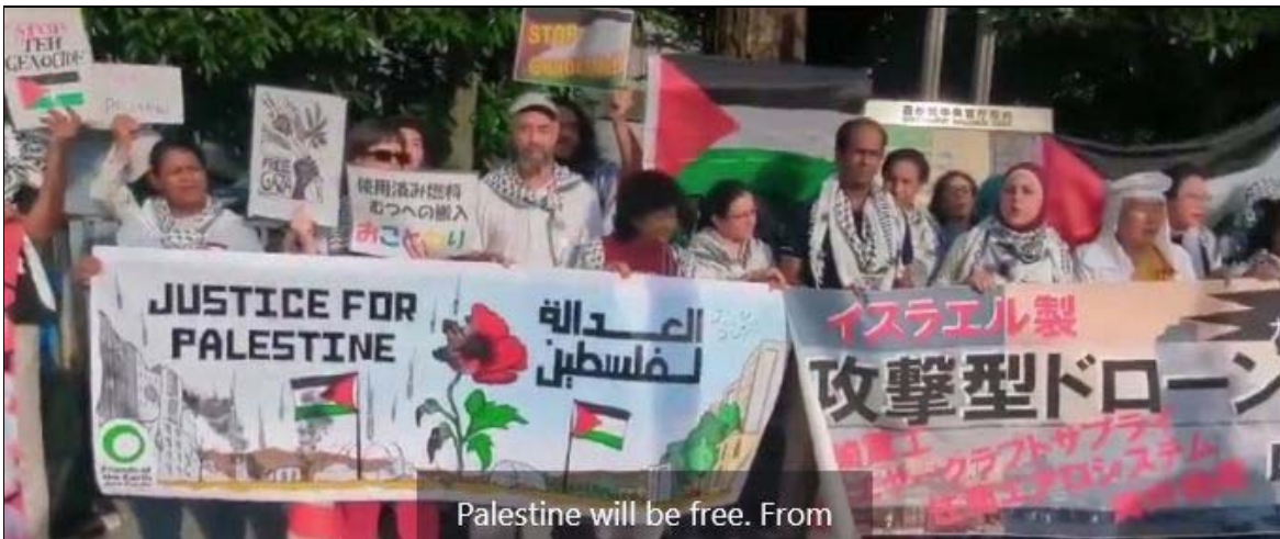
Palestine will be free. From