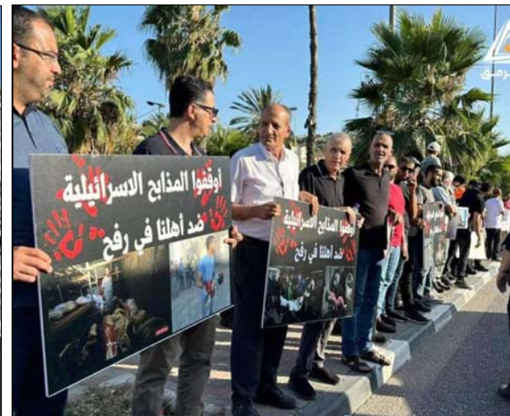
Protest against latest Israeli massacres in Gaza, July 13