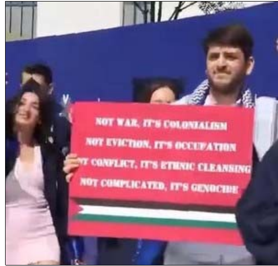
Students at Medipol University stand with Palestine at their graduation ceremony, July 4