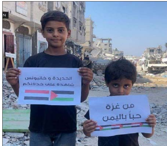
Thank you from Gaza to Yemen for solidarity after Israeli attack on Yemen, July 19 and 21