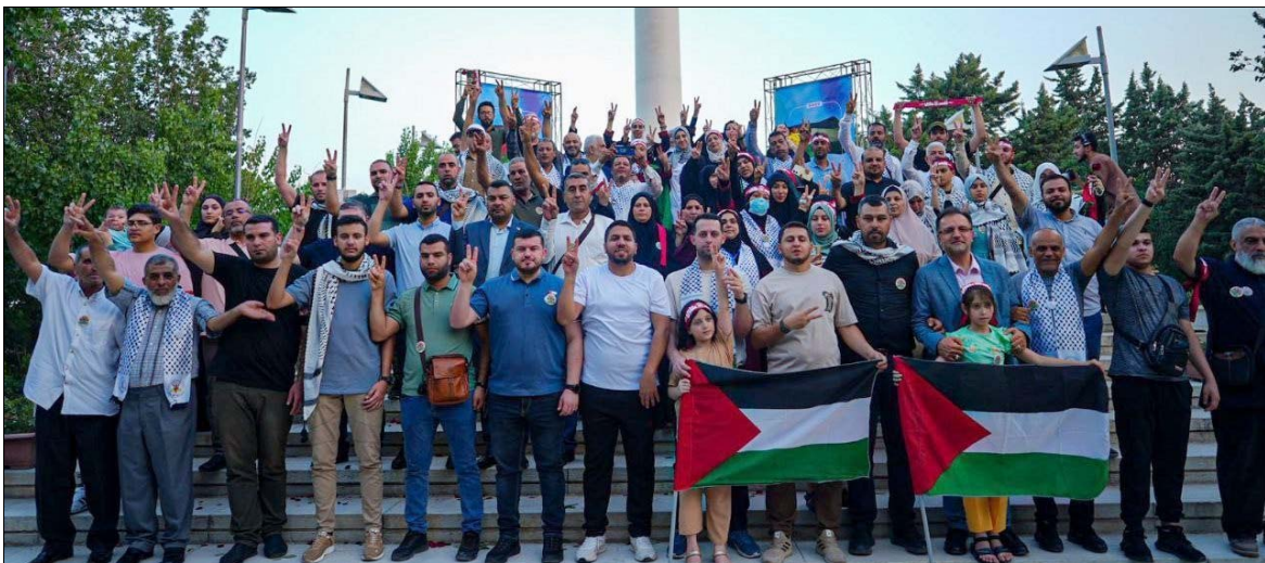
A massive Palestinian flag, 1,020 square metres in size is raised in the centre of the city in the presence of families of the martyrs of the Al-Aqsa Storm Operation, July 4