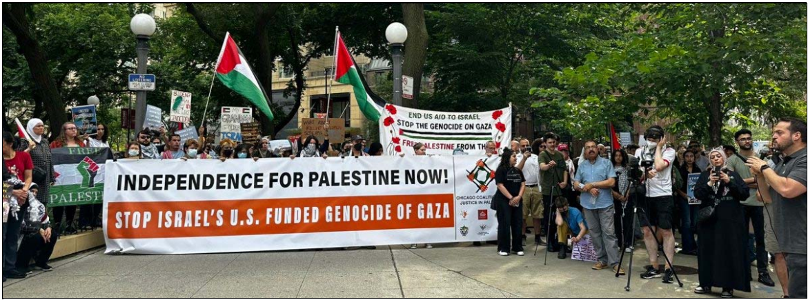
Rally for Palestine on Independence Day, July 4