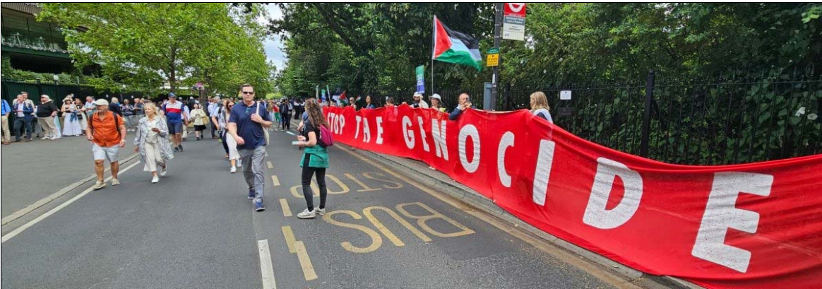
Picket outside Wimbledon Tennis Championships, July 1