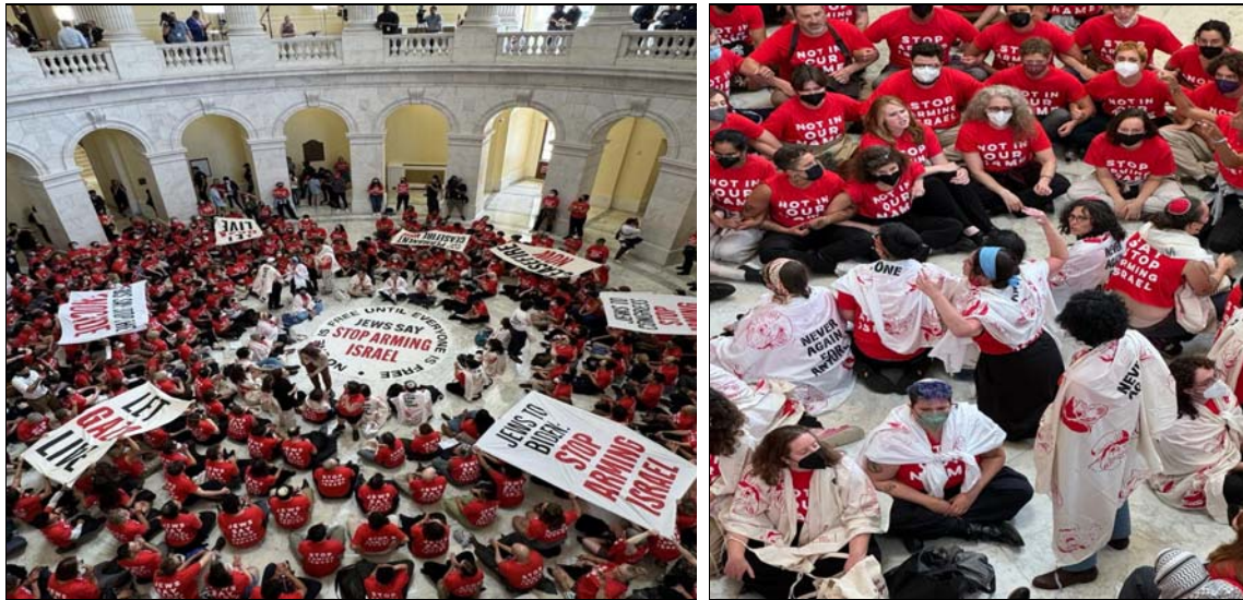
Occupation of Capitol, July 23