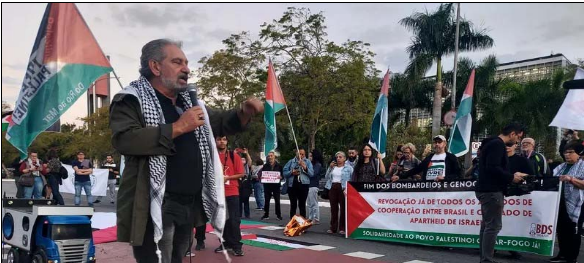
Rally demands arms embargo on Israel, July 3