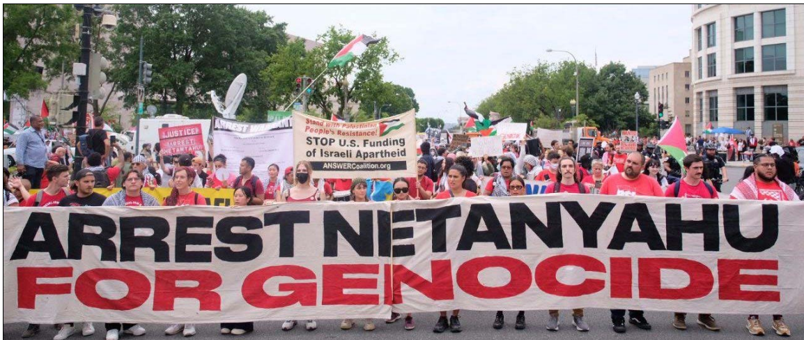
Washington, DC, July 24