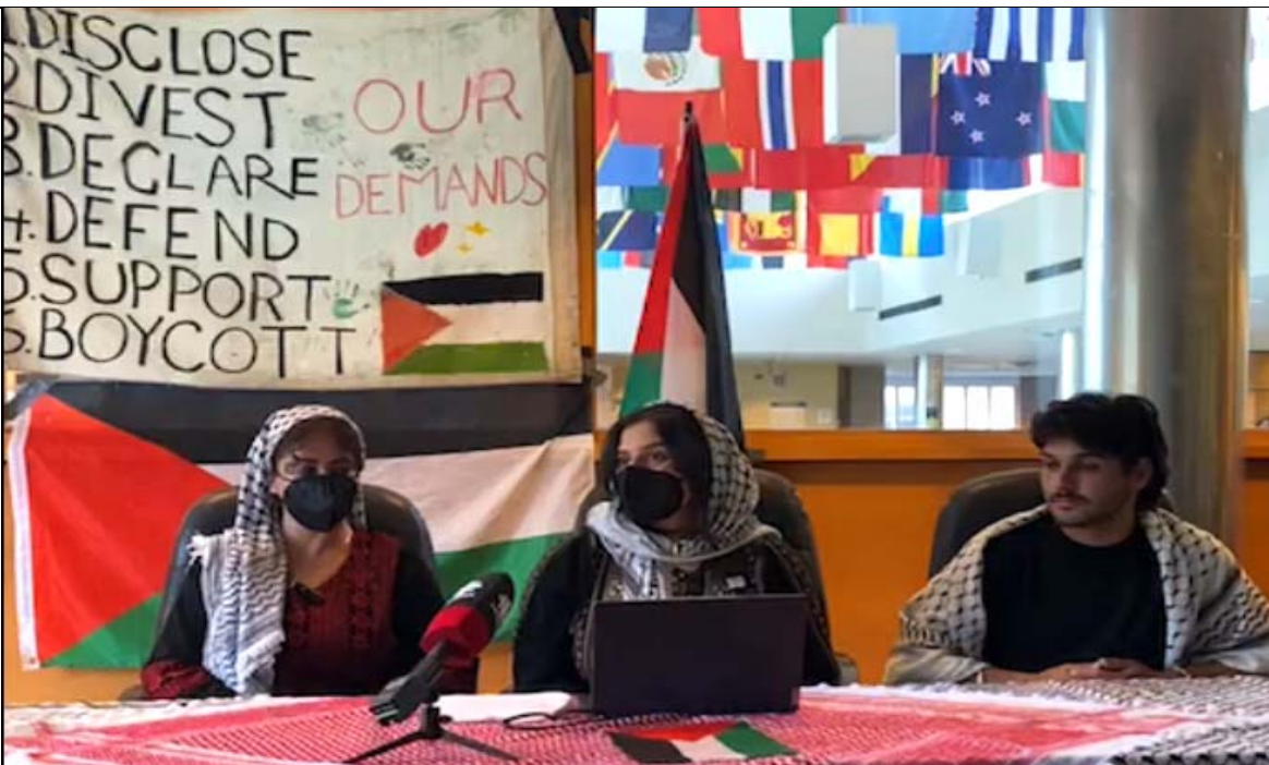
Press conference announcing agreement signed with the University of Windsor and closing of the student encampment, July 10

On July 10 students who camped out for two months on the campus of the University of Windsor to take a stand against Israel's brutal genocide against the Palestinian people and join the worldwide student Intifada announced that an agreement which met their demands had been signed with the University administration and as a result, they were ending their encampment.