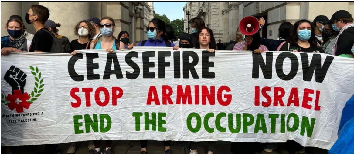
Demonstration blocks road outside the Foreign Office, July 24