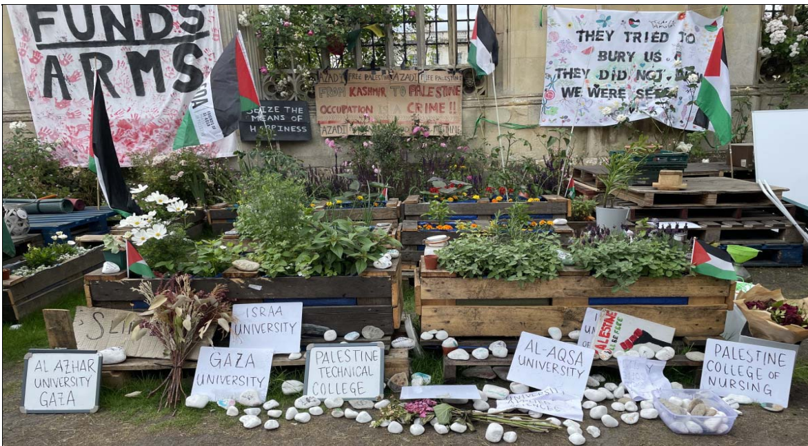
Cambridge University students remembering Gaza's universities, July 3