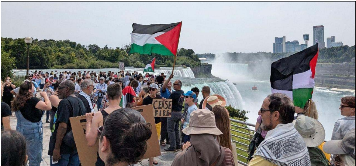
U.S. side of Niagara Falls, July 21