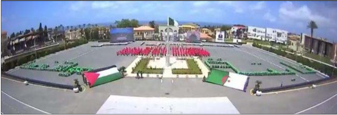
Palestinian and Algerian flags at Military graduation, July 3