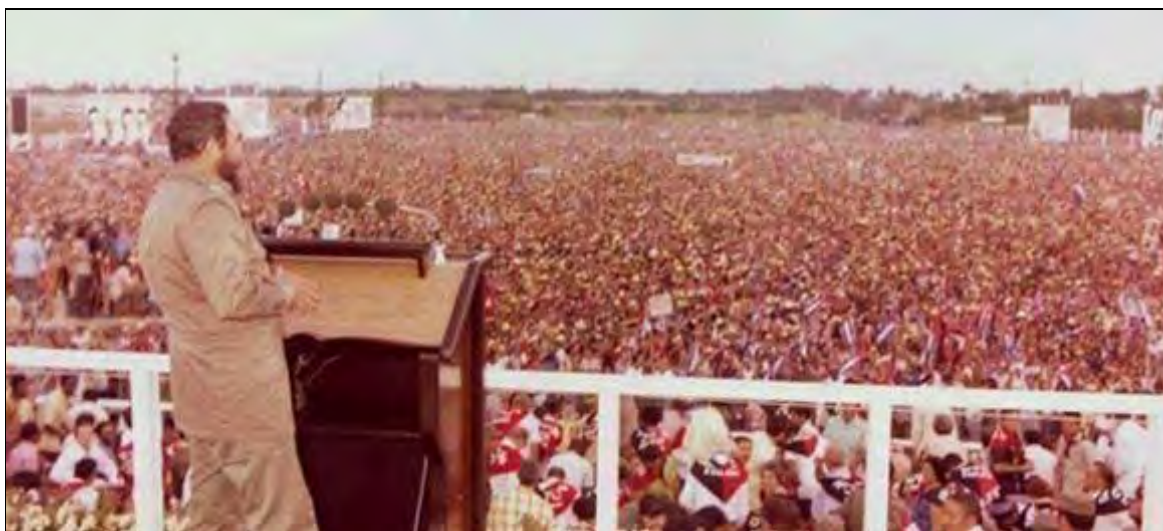
Fidel in Pinar del Río, July 26, 1976.

"[...] what are they this July 26th? An indestructible path that unites the thought, the heroism and the will to fight of the inextinguishable bastion, whose independence Mart wanted so as to prevent and that did prevent the powerful and expansionist neighbour to the north from expanding into the Antilles and falling with that added strength on our lands in America."