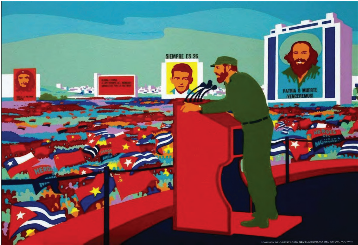
"History Will Absolve Me," poster by Rene Mederos, part of a series of posters commissioned by the Communist Party of Cuba in 1973 on the 20th anniversary of the Moncada attack. The other posters show the untenable situation facing the Cuban people in 1953 under U.S. domination, the preparation for the attack, and finally the launch of the attack under Fidel's leadership, with the patriots disguised as soldiers.