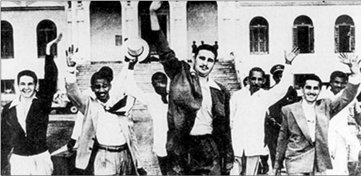
Above, Raúl Castro (far left), Fidel Castro (centre) and other Moncada combatants are released from prison, May 1955.

This audacious action became the rallying cry for the fight of the youth of Cuba for a bright future for themselves and the nation. It played a decisive role in galvanizing the struggle of the Cuban people to affirm their sovereignty, ultimately leading to the victory of the Cuban Revolution in 1959. The action also stirred the revolutionary spirit of the peoples of the world.