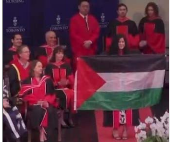
June 4 (left); School of nursing, June 5