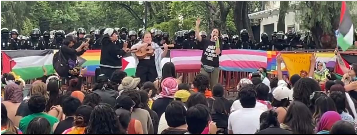
No Pride in Genocide, June 29