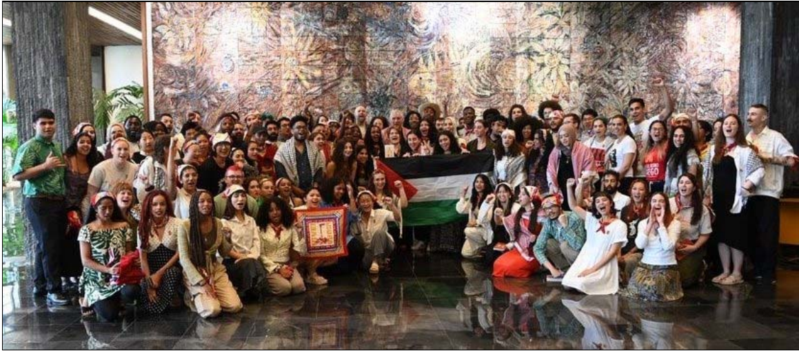
Cuban President Miguel Díaz-Canel Bermúdez holds discussions with youth from the U.S., June 11