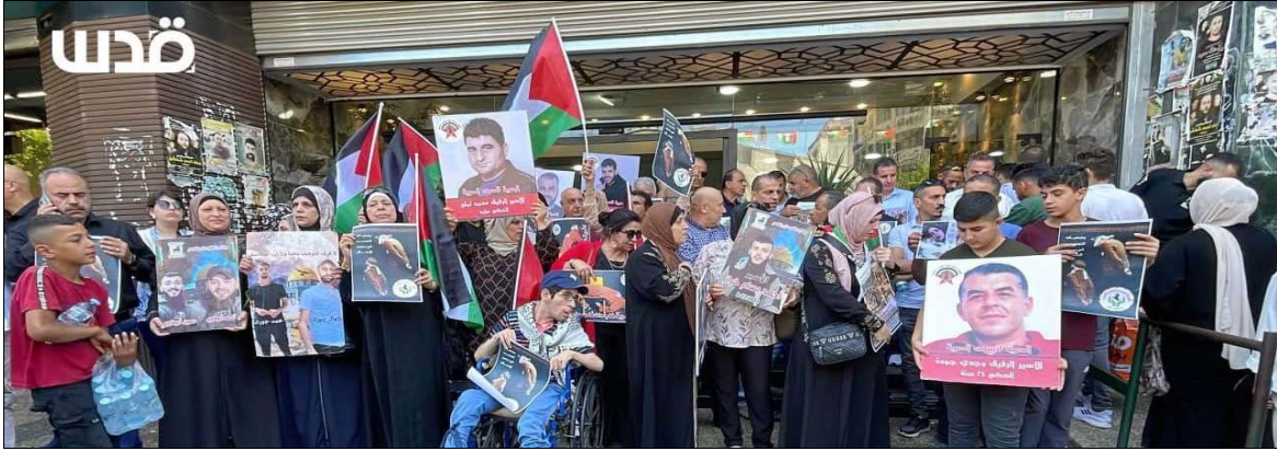
Protest against Israeli treatment of Palestinian prisoners, June 11