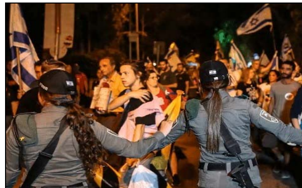
Jerusalem, June 18