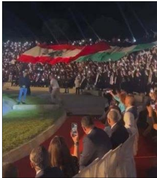
University of Beirut graduation, June 8