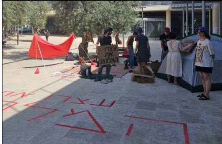
Bezalel Academy of Art and Design student encampment, June 3 Nablus, West Bank