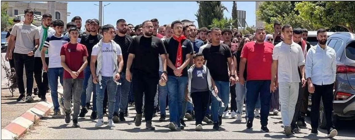
Birzeit University students protest Israeli genocide, June 12