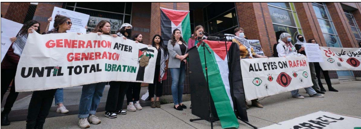
Picket at Vancouver Police Headquarters against criminalization of support for Palestine, June 18