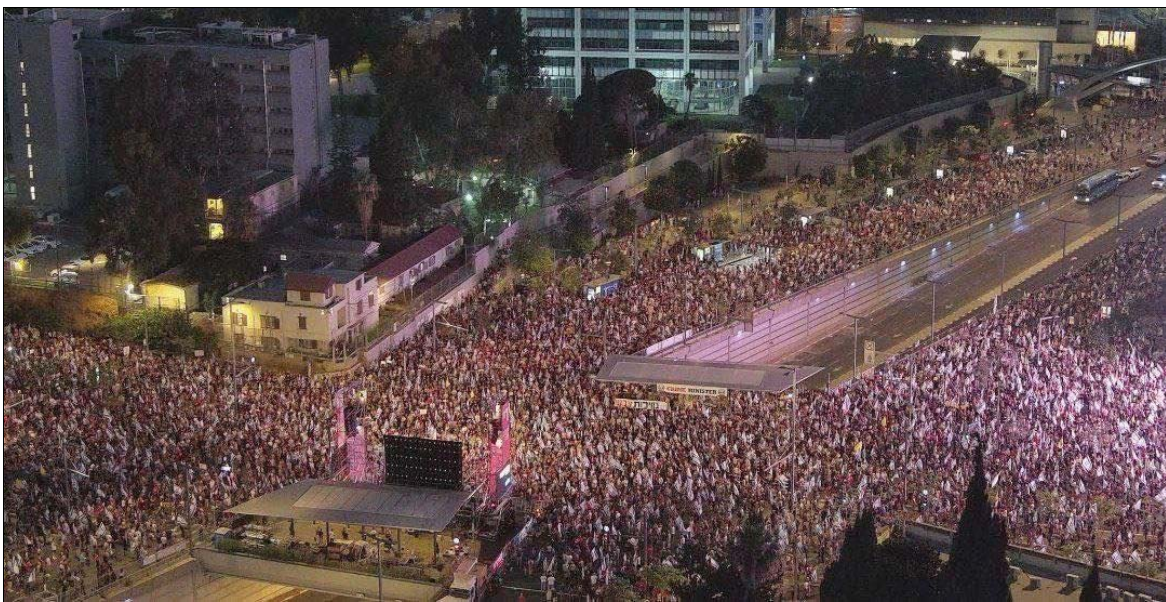
Tel Aviv, June 29