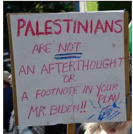
June 15 25