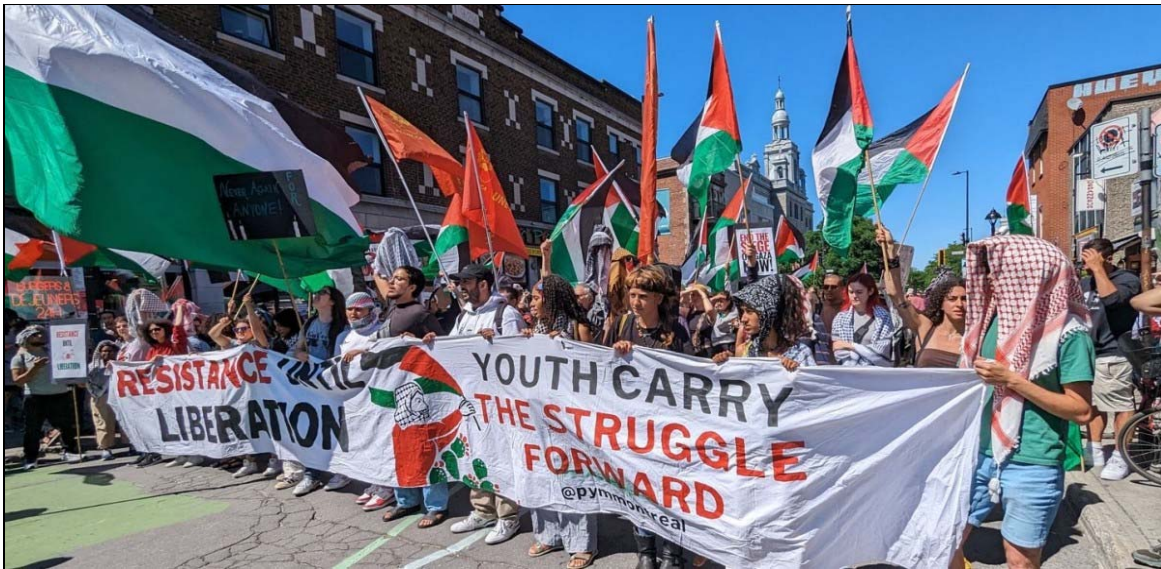
Montreal, June 8