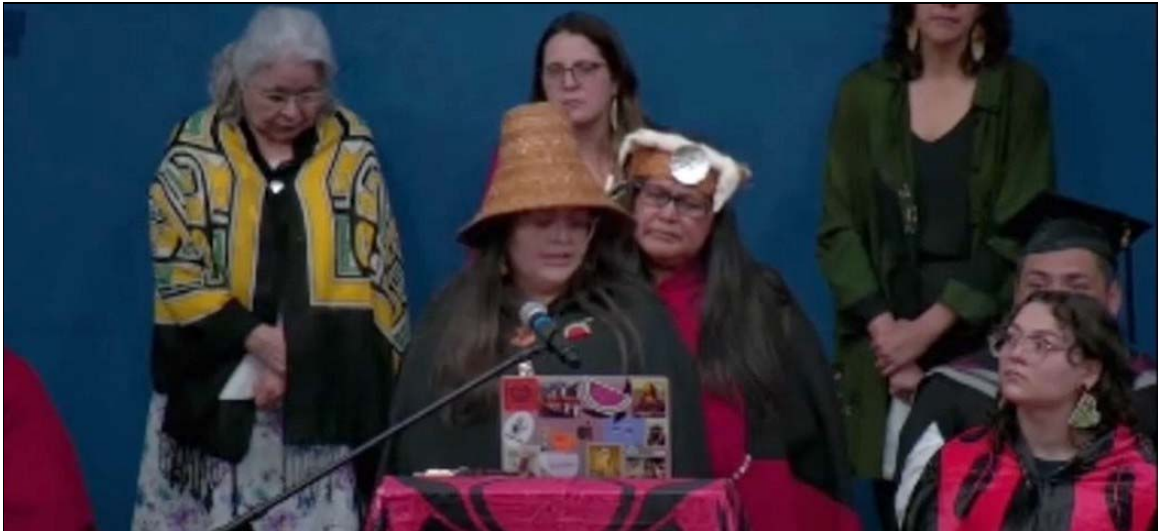
Valedictorian at Indigenous graduation ceremony denounces Israeli genocide and calls for a Free Palestine