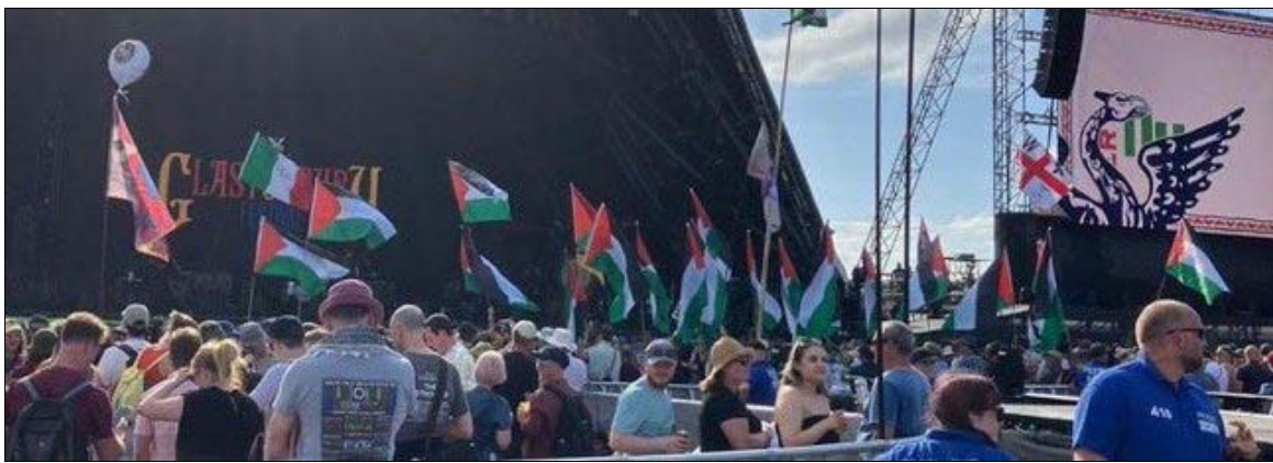
Glastonbury Festival, June 29-30