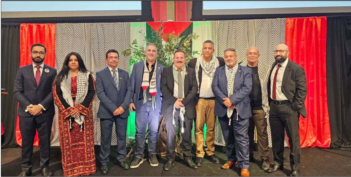
June 13, Palestine Day on Parliament Hill