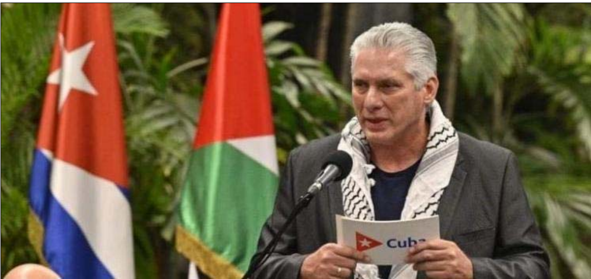
Cuba announces it is joining South Africa in its case against Israel for genocide at the International Court of Justice, June 21