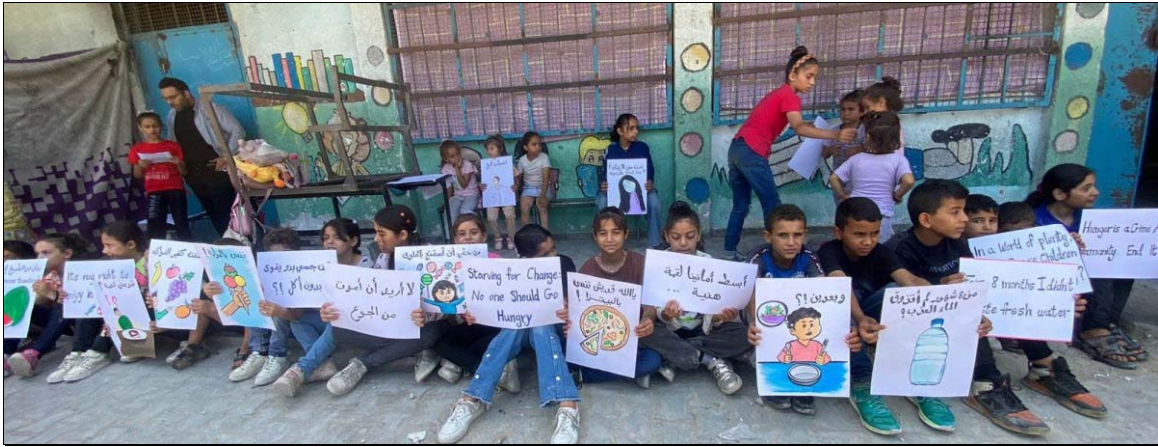
Displaced children demand their basic rights, June 4 Jerusalem