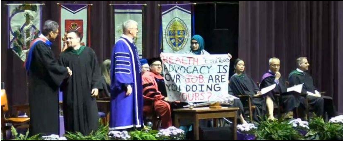
University of Windsor