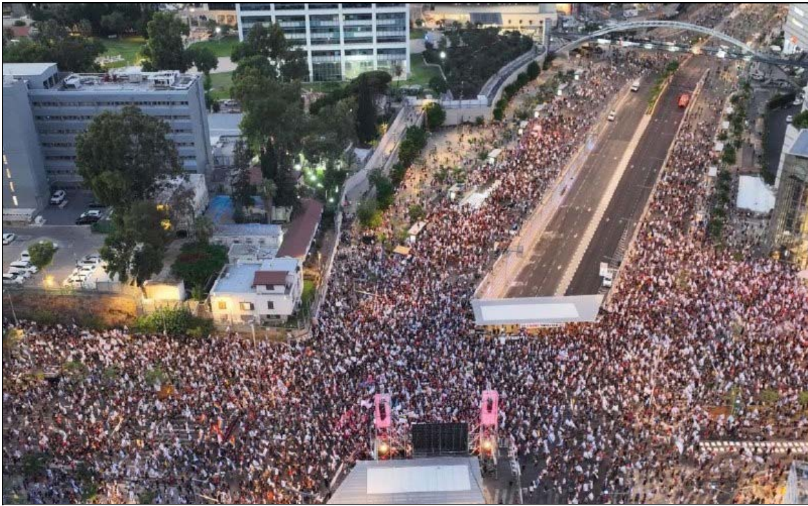
Tel Aviv, June 22