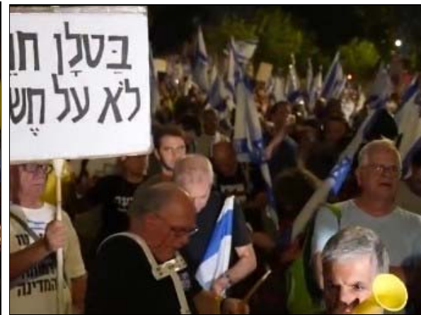
Jerusalem, June 21