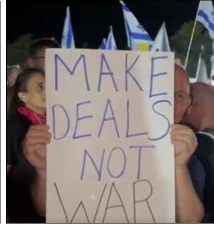
Ceasarea outside Netanyahu's personal residence, June 21