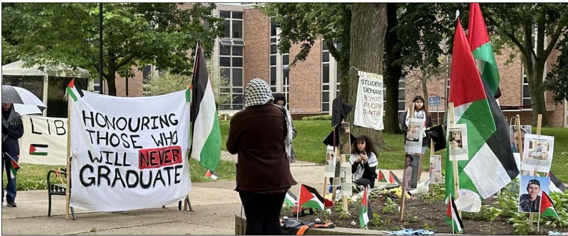
Honouring the students of Gaza who will never graduate, June 8