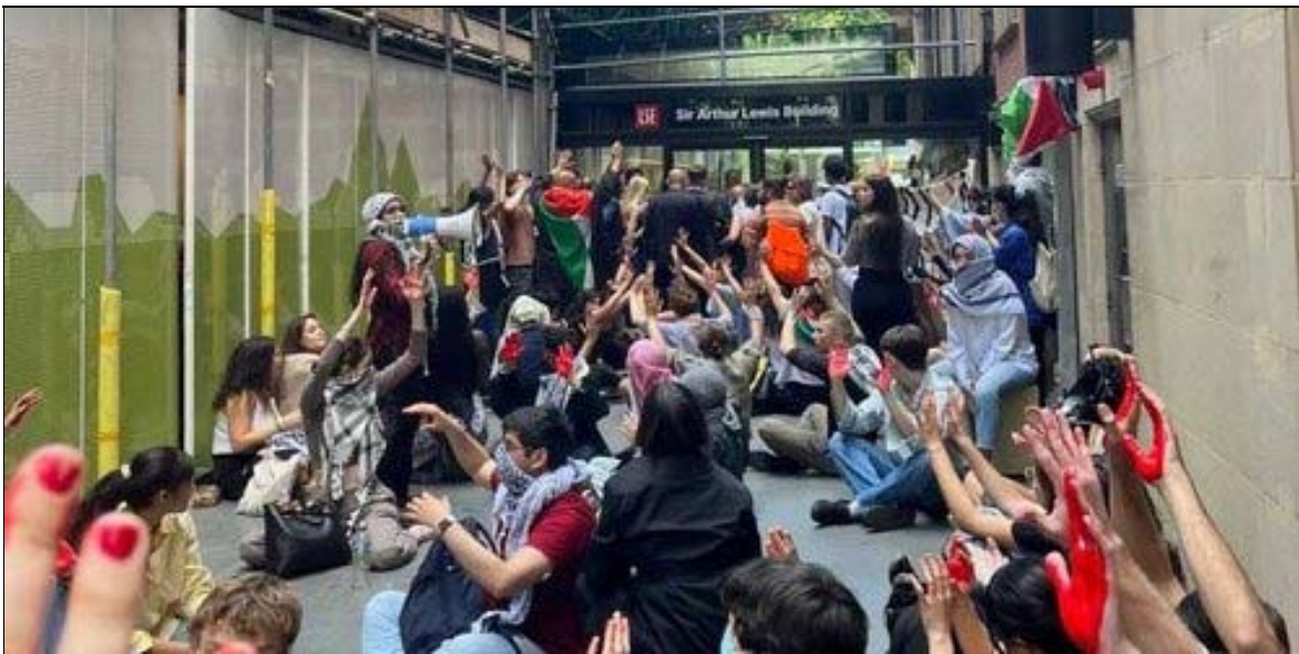
Support action for student encampment at London School of Economics, June 17