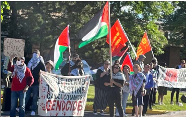
Picket outside Trudeau fund-raising dinner, June 27