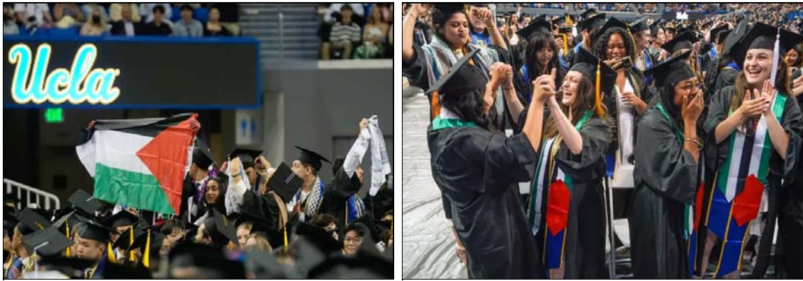
Graduation ceremony at University of California at Los Angeles, June 15