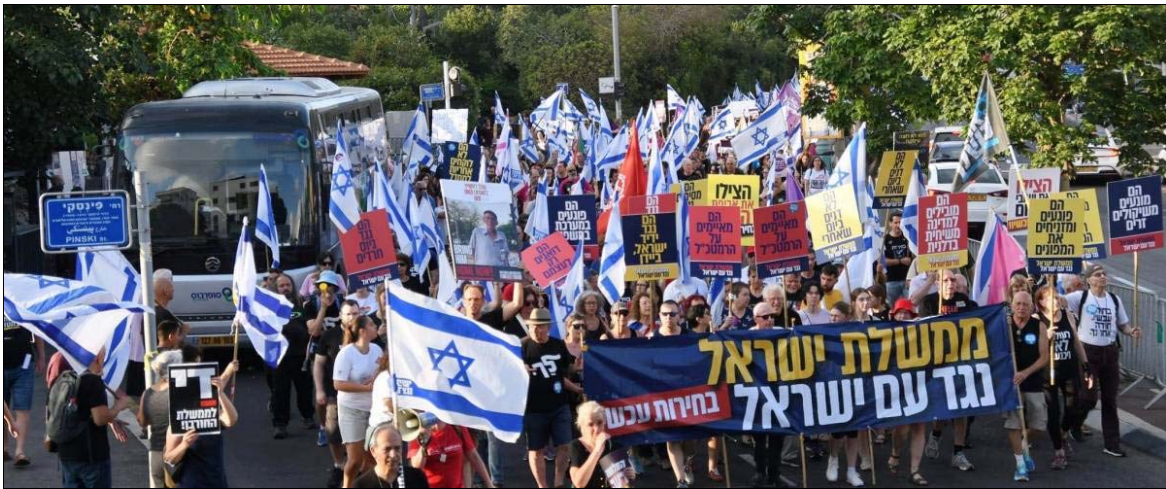
Haifa, June 22