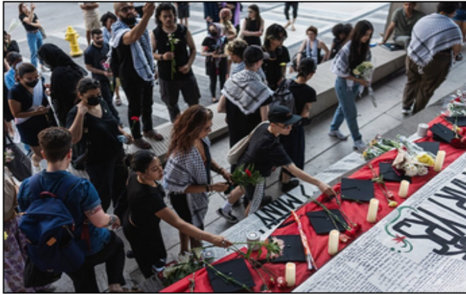
Ceremony to honour the Gazan students who will not graduate at Toronto Metropolitan University, June 19.