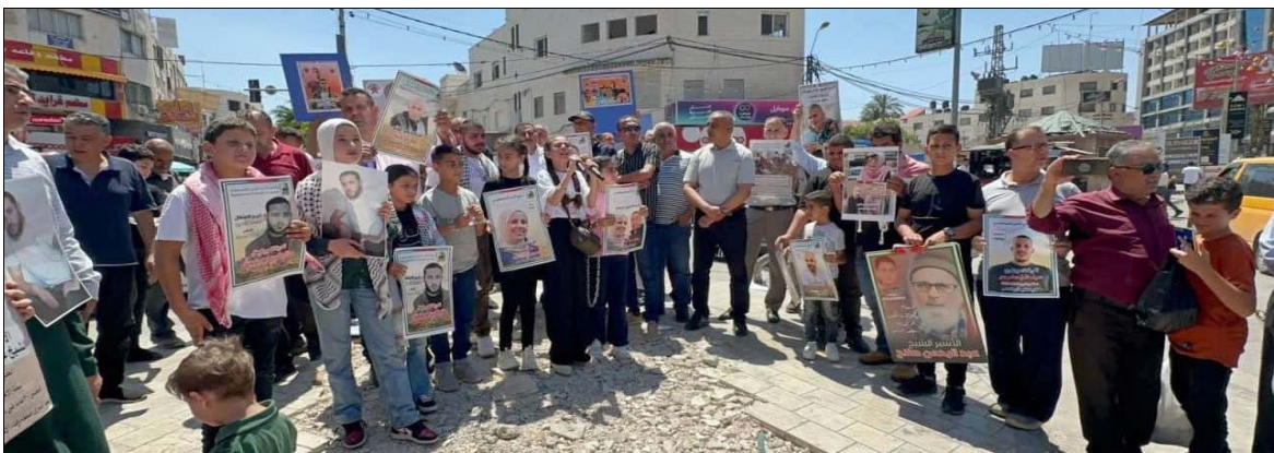
Protest of Israeli treatment of Palestinian prisoners, June 11