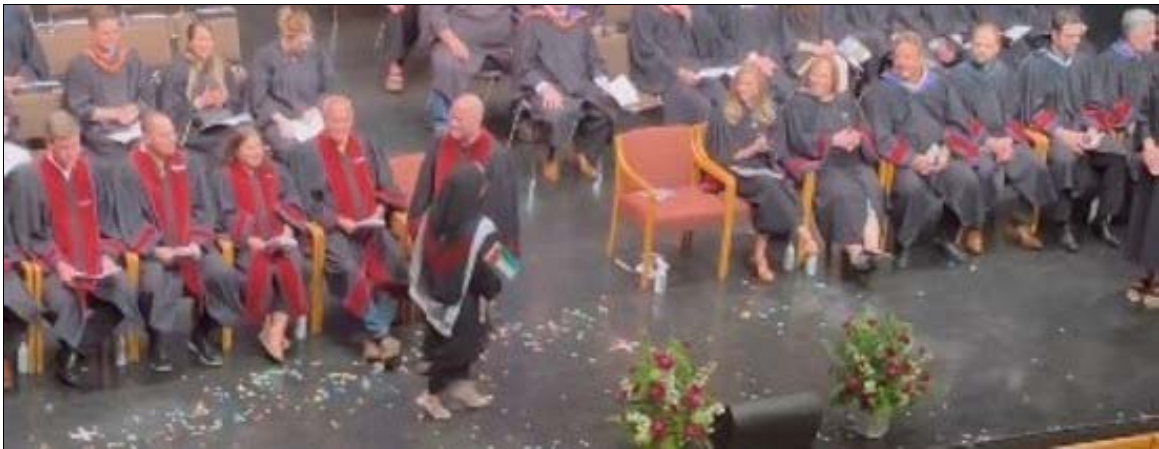
Lakehead University, Thunder Bay