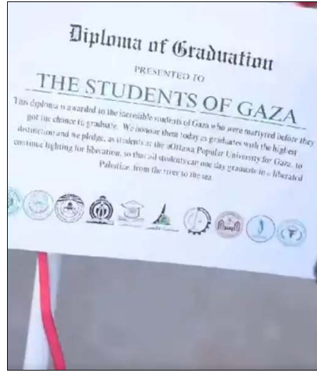
Ceremony at uOttawa, June 15

Students at uOttawa held a moving ceremony on June 15 to honour the students of Gaza's Class of 2024 who will never graduate due to the Israeli genocide and its destruction of all the universities.