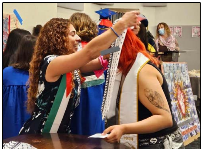
People's Commencement, June 13