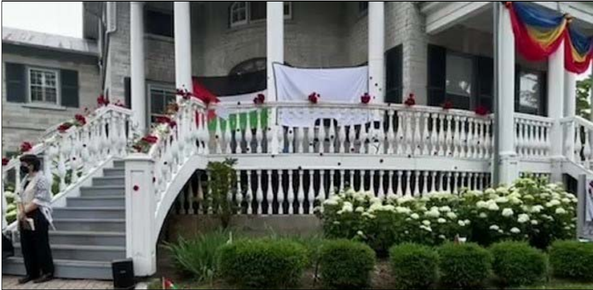
Students at Queen's University honour Palestinian students who will not graduate, June 21