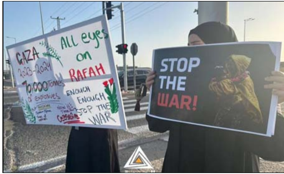
Tayibe, West Bank