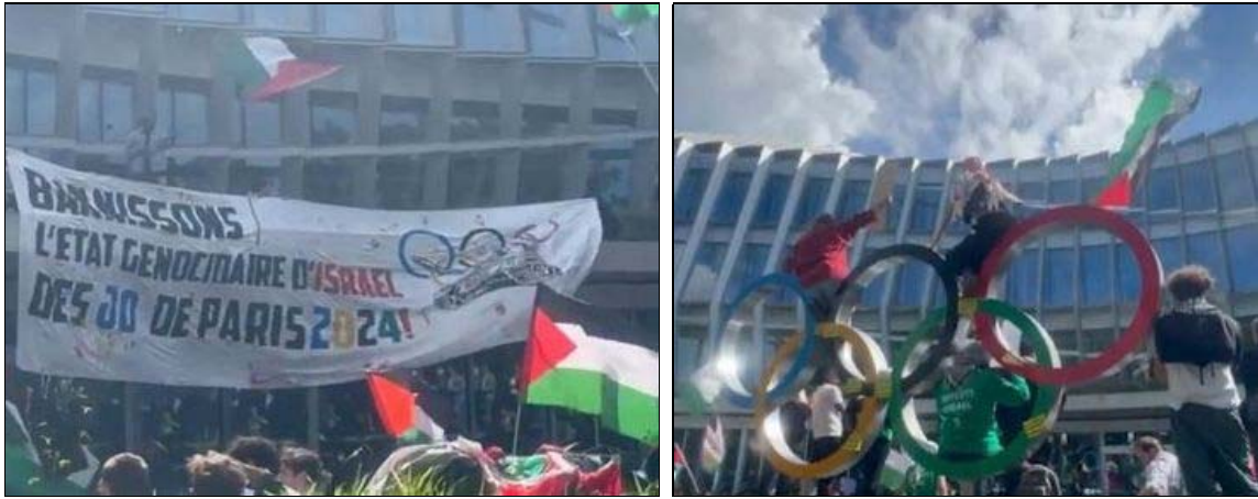
Action outside International Olympics Committee building demands Israel be banned from the 2024 Paris Olympics, June 12