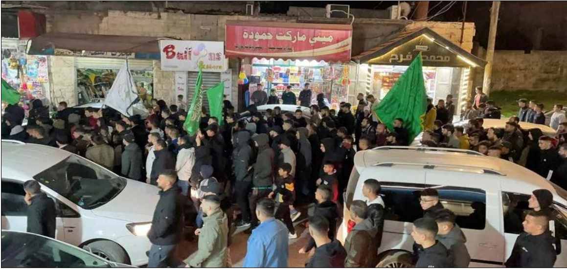
Demonstration in Tubas, West Bank following the assassination of Al-Aroui, January 2, 2024.

Israel's desperation to wipe out the political organization known as Hamas has now led to the cowardly assassination of Hamas leader Saleh al-Aroui on January 2 in Dahieh, the southern suburb of Beirut, Lebanon. The attack also killed six others.