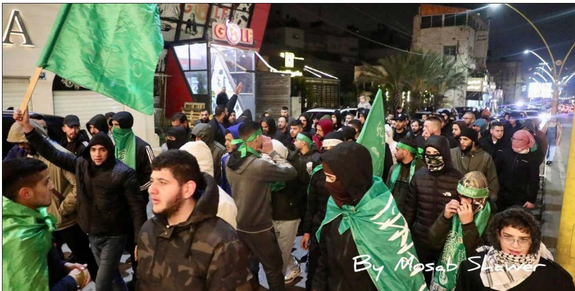
Protest in West Bank, January 2, 2024, following assassination of Al-Arouri

All Out to Support the Palestinian Resistance! Ceasefire Now!