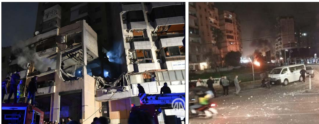
Building in Dahieh, the southern suburb of Beirut, Lebanon where al-Arouri was killed.

Provocations against Lebanon and Iran, or attacks against the Yemeni resistance and support for the people of Palestine being slaughtered by Israel will backfire. The assassins of Saleh al-Arouri and all the Palestinian martyrs and those who have been killed for supporting their cause will be defeated. The Palestinian resistance is a force to be reckoned with. It will win. Ceasefire Now!