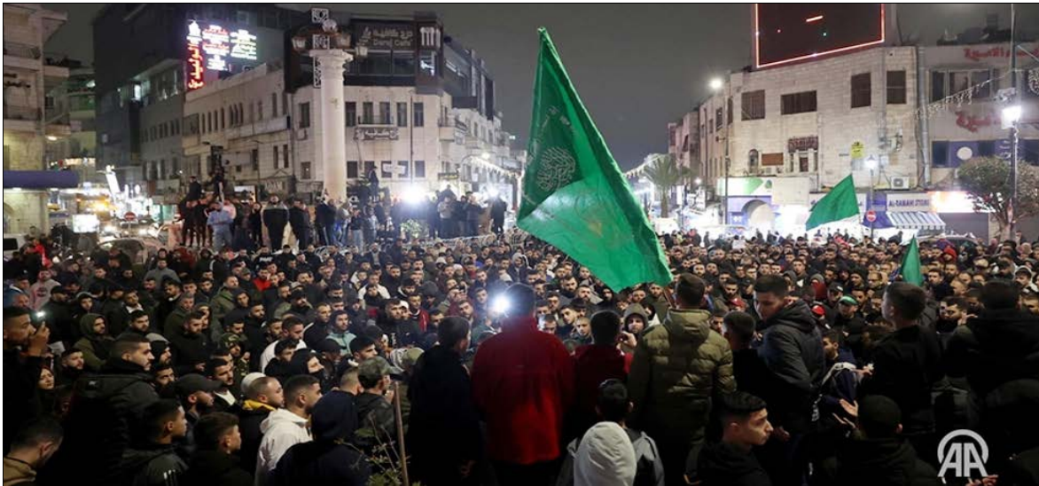
Ramallah, January 2, 2024, protest against assassination of Saleh al-Arouri