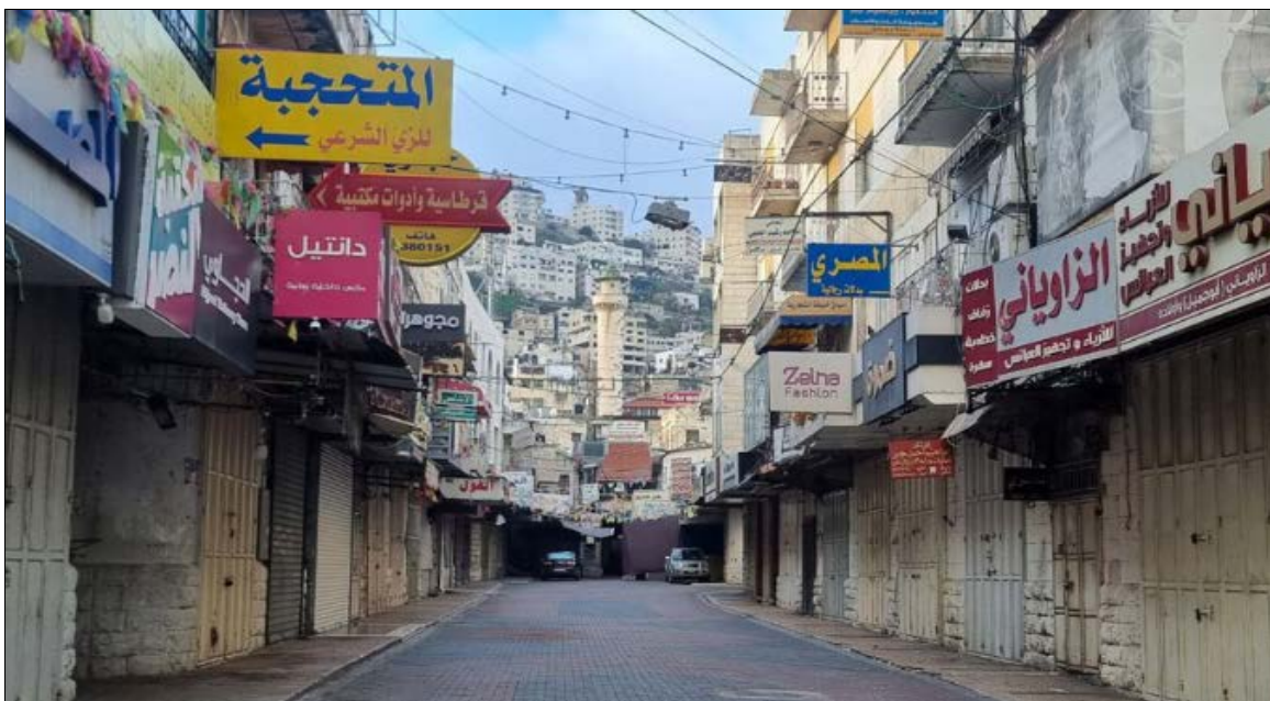
General strike in West Bank, January 3, 2024, following assassination of al-Arouri.

As news of the assassination spread, hundreds of Palestinians protested in the West Bank to condemn al-Arouri's killing. A general strike was announced for January 3, and many shops and businesses remained closed across the territory. All schools and public institutions were closed to mourn al-Arouri's death.