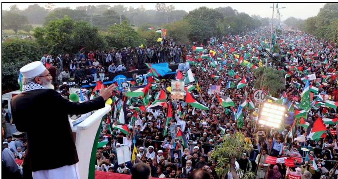
Lahore, Pakistan, November 20, 2023

In one of the largest rallies held in Pakistan since October 7, more than 100,000 rallied in the streets of Lahore Pakistan on November 20 in support of the Palestinian people. Palestine will be free , Down with Israel , and Stop Genocide Against Palestinians were among the slogans inscribed on banners and placards carried by protesters. One of the organizers condemned leaders of "the West" for supporting Israel and criticized Arab leaders for lack of action. At the same time he thanked the people in Washington, DC and London, England for coming out in their hundreds of thousands to support Palestinians.