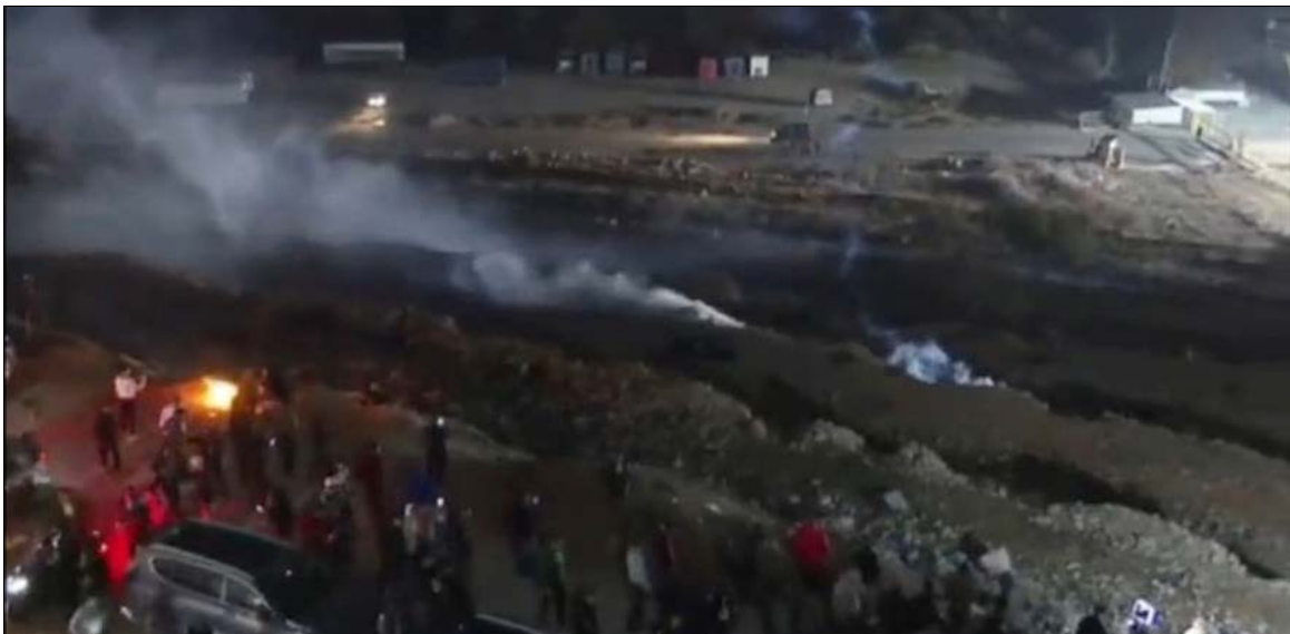
The IDF fire tear gas at relatives of the Palestinian prisoners awaiting their release from Israeli prison, November 24, 2023.

In addition to the first group of women and children that Hamas handed over to Israel on November 24, it released 12 Thai nationals who had been working in Israel as labourers when they were captured during the October 7 raid. Their release was confirmed by the Thai Prime Minister.