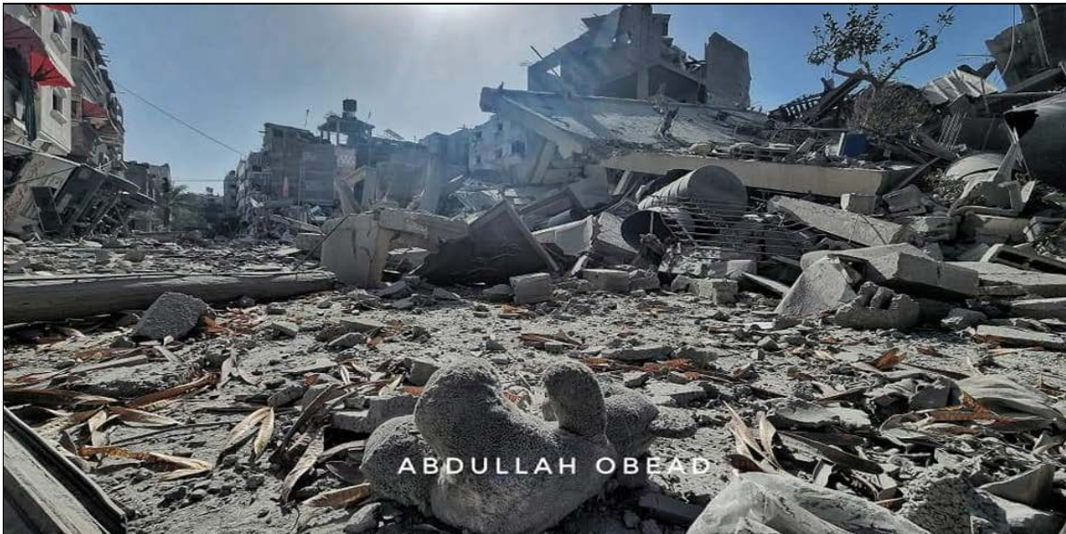
Devastation in northern Gaza, November 23, 2023

The temporary truce has revealed both the extent of the humanitarian catastrophe and destruction wrought upon the Palestinian people of Gaza by Israeli forces as well as the social love and solidarity the people have for one another. Middle East Monitor (MEMO) writes: