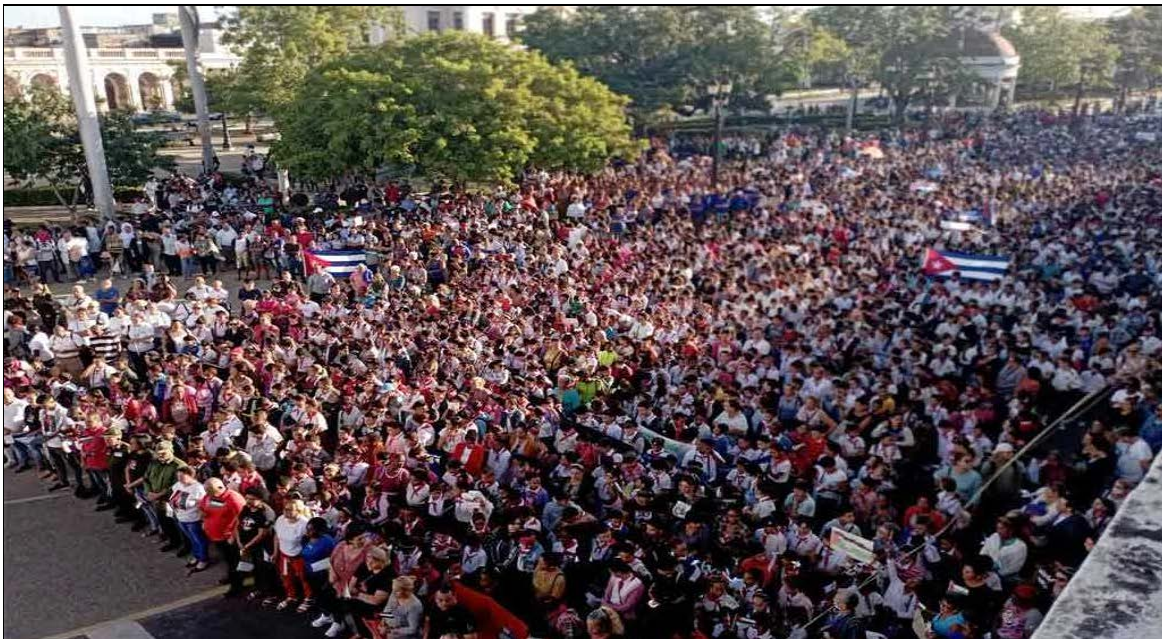
Cienfuegos, Cuba, November 21, 2023

Prensa Latina posted photos of a mass event at José Martí Park, in the Historic Urban Centre of Cienfuegos, Cuba, in which it looks as if the whole city came out to condemn the war crimes committed by Israel against Palestine.