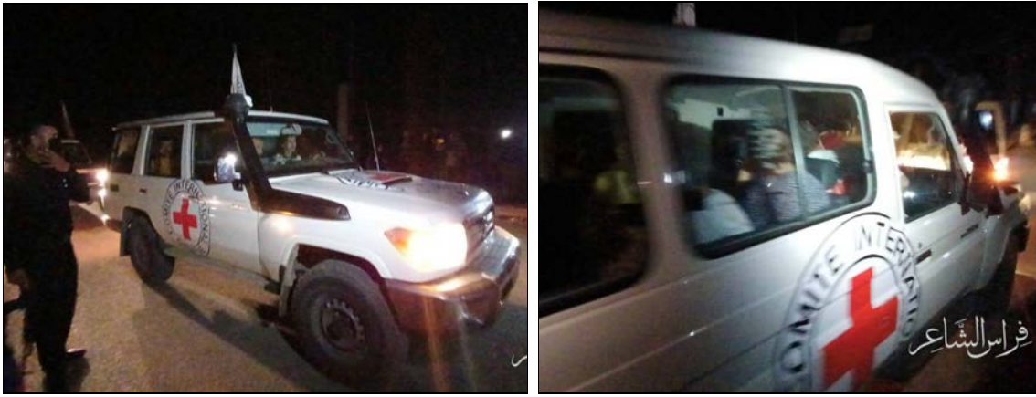
Red cross ambulances carrying first group of Israelis to be released by Hamas, November 24, 2023.

Prisoner Swap: The International Committee of the Red Cross (ICRC) has received 13 Israeli civilians along with 10 other foreign nationals from Palestinian fighters in Gaza, as per the first footage released. This group was exchanged for 39 Palestinian women and children held in Israeli jails.