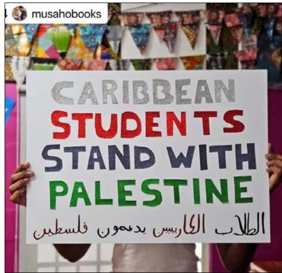
St. Thomas, Virgin Islands (left); University of the West Indies (right)

Prensa Latina posted photos of a mass event at José Martí Park, in the Historic Urban Centre of Cienfuegos, Cuba, in which it looks as if the whole city came out to condemn the war crimes committed by Israel against Palestine.