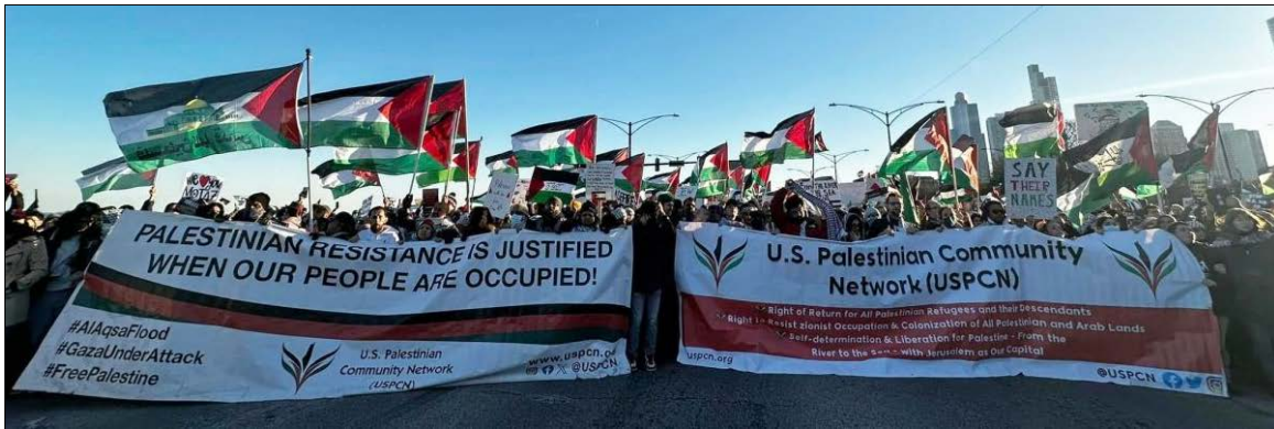
Chicago, Illinois, November 18, 2023

On November 22, the U.S. Palestinian Community Network (USPCN) issued the following important statement on the temporary "Truce Agreement."