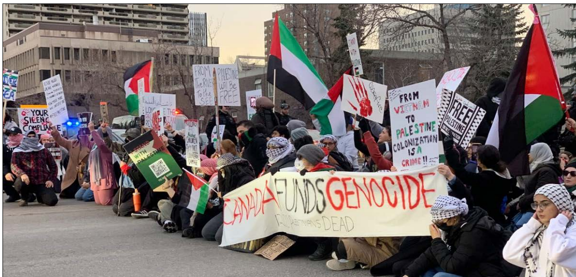
Calgary, November 19, 2023

The Alberta Committee of the Communist Party of Canada (Marxist-Leninist) vehemently condemns the arrests and use of violence carried out by Calgary Police against Calgarians at a demonstration demanding an end to the genocide in Gaza held on November 19.