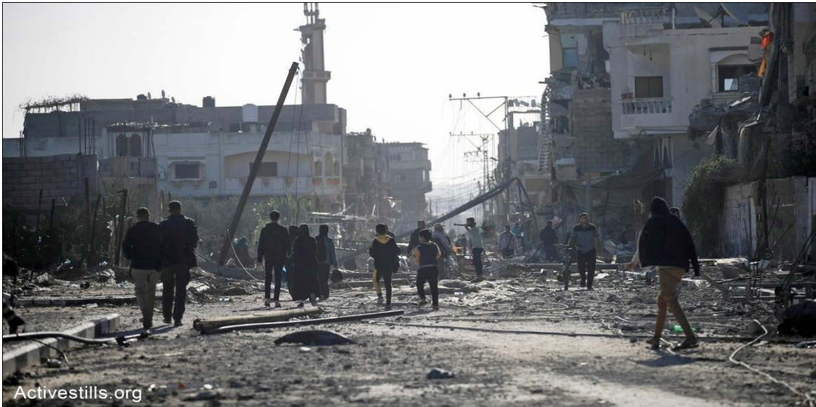
As limited truce begins November 24, 2023, some Gazans in the south return to their homes to see what remains.

The systematic destruction the Israeli Zionists conducted after the truce in the fighting was announced and its declarations that after the truce it will continue its mission of wiping out Hamas and wiping out the Palestinian people are a testament to their depravity and the urgent need to stop them. The disastrous situation into which the crimes Israel has committed thus far have plunged the people continues to be revealed. The number of Palestinians killed since October 7 was 14,532 when the truce was announced, including about 6,000 children and many more buried under the rubble not yet accounted for. With the vicious assaults Israel launched in the next 24 hours the death toll rose to 19,385 of whom 8,005 were children.