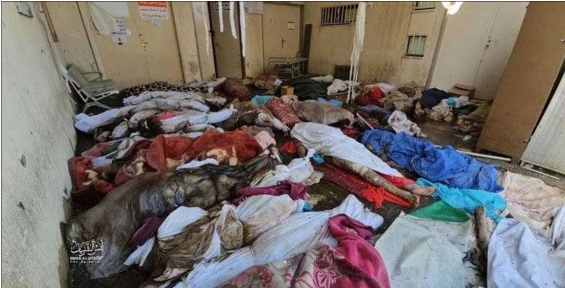
Photos from Indonesian hospital following Israeli bombing.