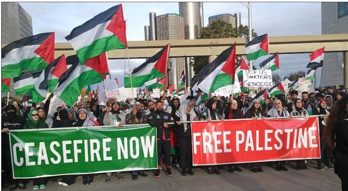
Detroit, Michigan, October 28, 2023

With the backing and funding the Biden administration is giving to the Zionist genocide in Palestine, the U.S. and the Biden administration are having great difficulty salvaging any legitimacy as a voice for human rights and democracy. Their efforts to use the claim of "terrorism" by Palestinians to justify the horrific onslaught and divert from the U.S./Israeli crimes are not succeeding. On November 20, White House spokesperson John Kirby was asked about activists dubbing the president "Genocide Joe" for his unconditional support of Israel. Kirby, of the National Security Council responded, "Israel isn't trying to wipe the Palestinian people off the map. Israel isn't trying to wipe Gaza off the map. Israel is trying to defend itself against a genocidal terrorist threat. So if we're going to start using that word, fine. Let's use it appropriately." Blinded by their own arrogance and chauvinism, the U.S. denies the Palestinian genocide the whole world sees.