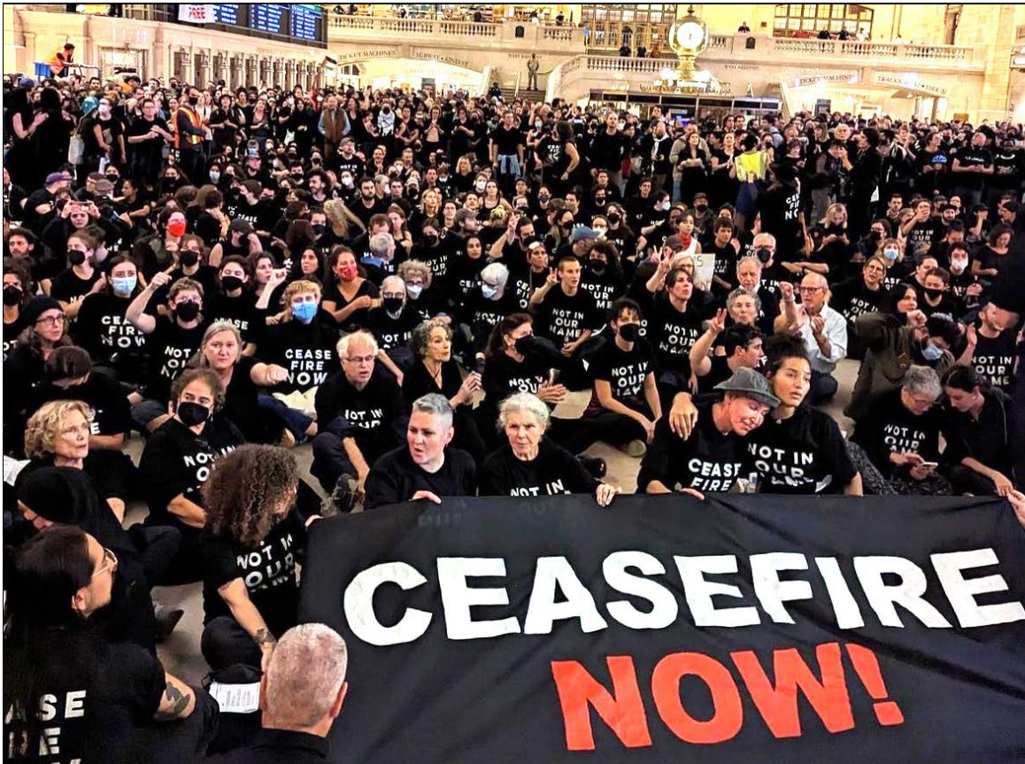
Occupation of Grand Central Station in New York, organized by Jewish groups. Their t-shirts read "Not in Our Name" and "Ceasefire Now!"