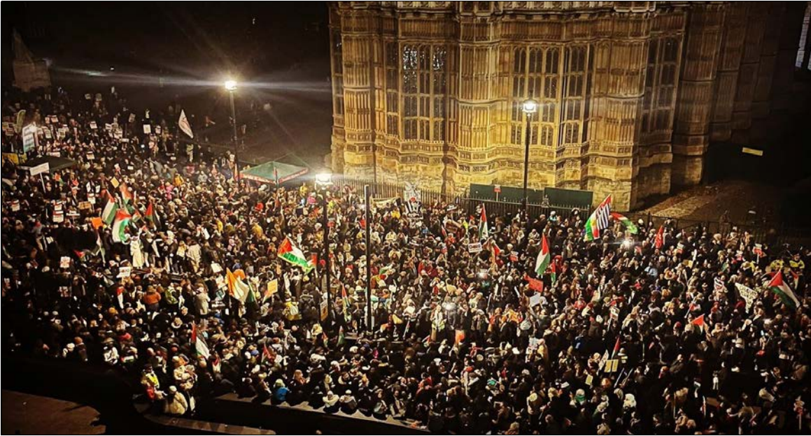
London, November 15, 2023