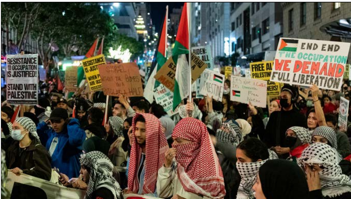
November 14, 2023

Climate activists rallied outside the Moscone Center on the evening of November 15, demanding that Citi and Exxon stop funding fossil fuel extraction. Exxon's CEO, Darren Woods, was one of the speakers at the APEC CEO Summit earlier that day. Climate justice activists marched on Market Street in San Francisco, Sunday, Nov. 12 behind a banner reading Fossil Fuels And Corporate Greed – No to APEC . Organizers with Climate Defenders wrote, "APEC is the perfect setting as it brings heads of states and thousands of CEOs from some of the most evil global corporations that are contributing to the climate crisis all for profit." Climate activists denounced climate change solutions discussed at APEC as "false solutions" and "greenwashing" motivated by corporate greed. Companies like Exxon have no intention to follow any climate pledges they have made, and instead prioritize profit over the climate crisis, according to Climate Defenders. Activists said the world needs real solutions such as divestment from climate change causing fossil fuels, and more sustainable, environmentally responsible practices.