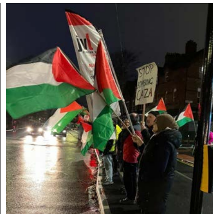
Manchester, November 15, 2023