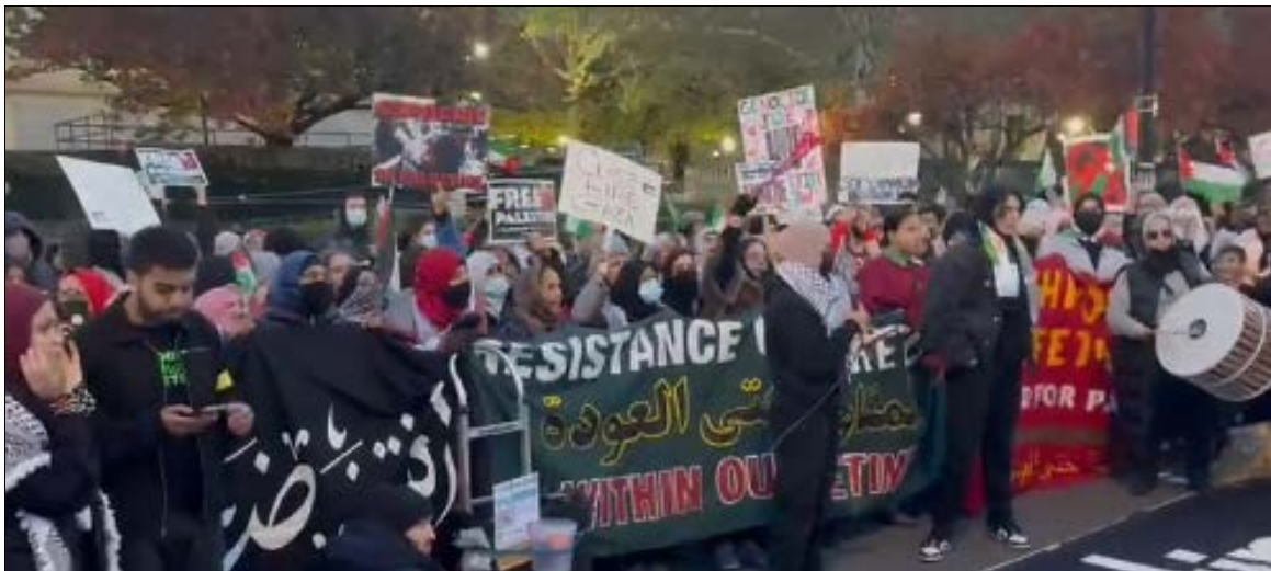
Staten Island, New York, November 14, 2023