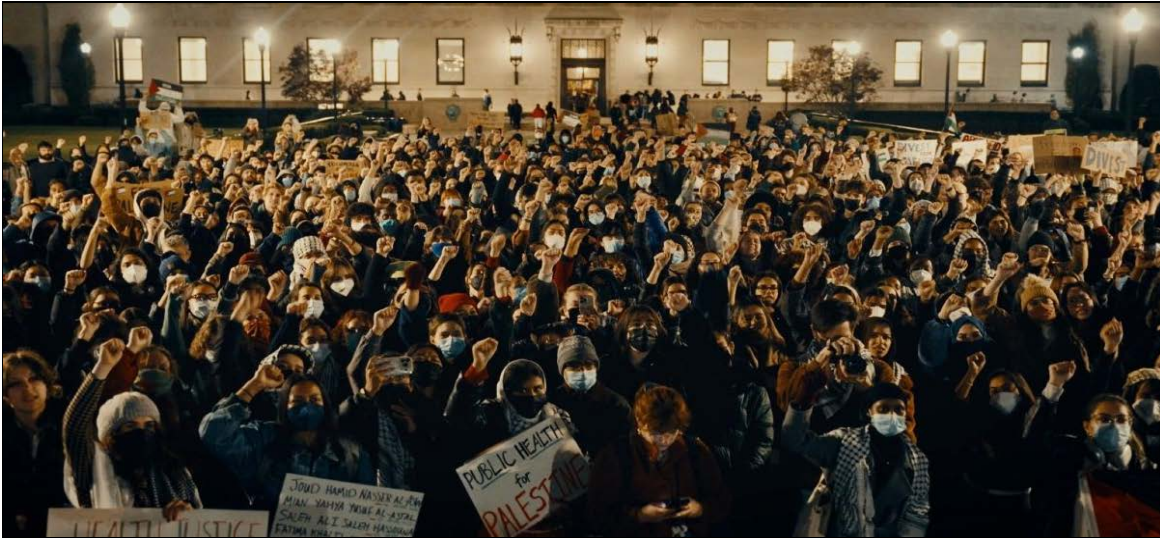
Columbia University, New York City, November 15, 2023