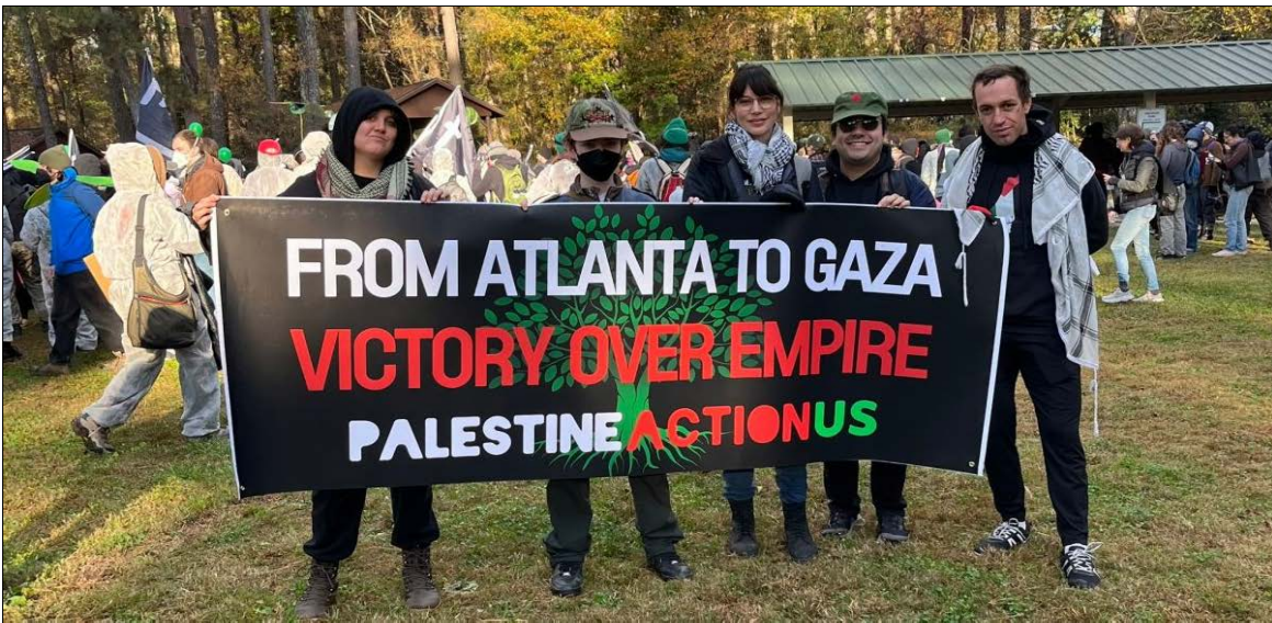
Atlanta, Georgia, November 13, 2023