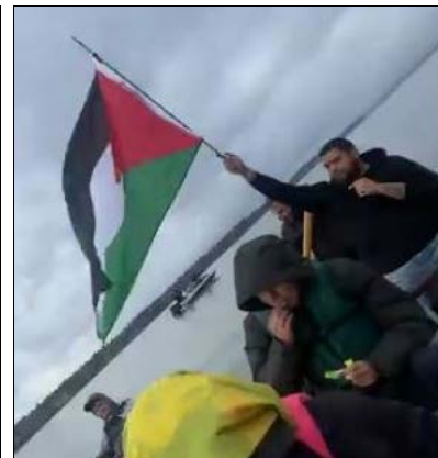
Ship bound for Israel blocked from loading in Tacoma both on shore and by Indigenous water defenders on the water, November 6, 2023.