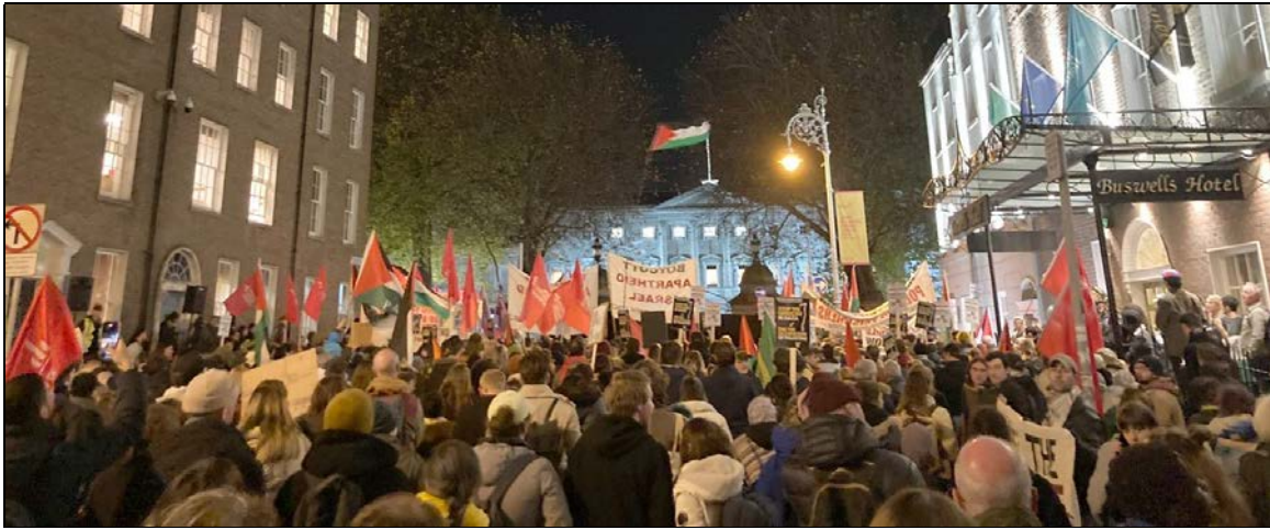
November 15, 2023