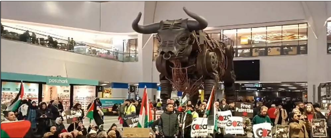
Birmingham, November 15, 2023