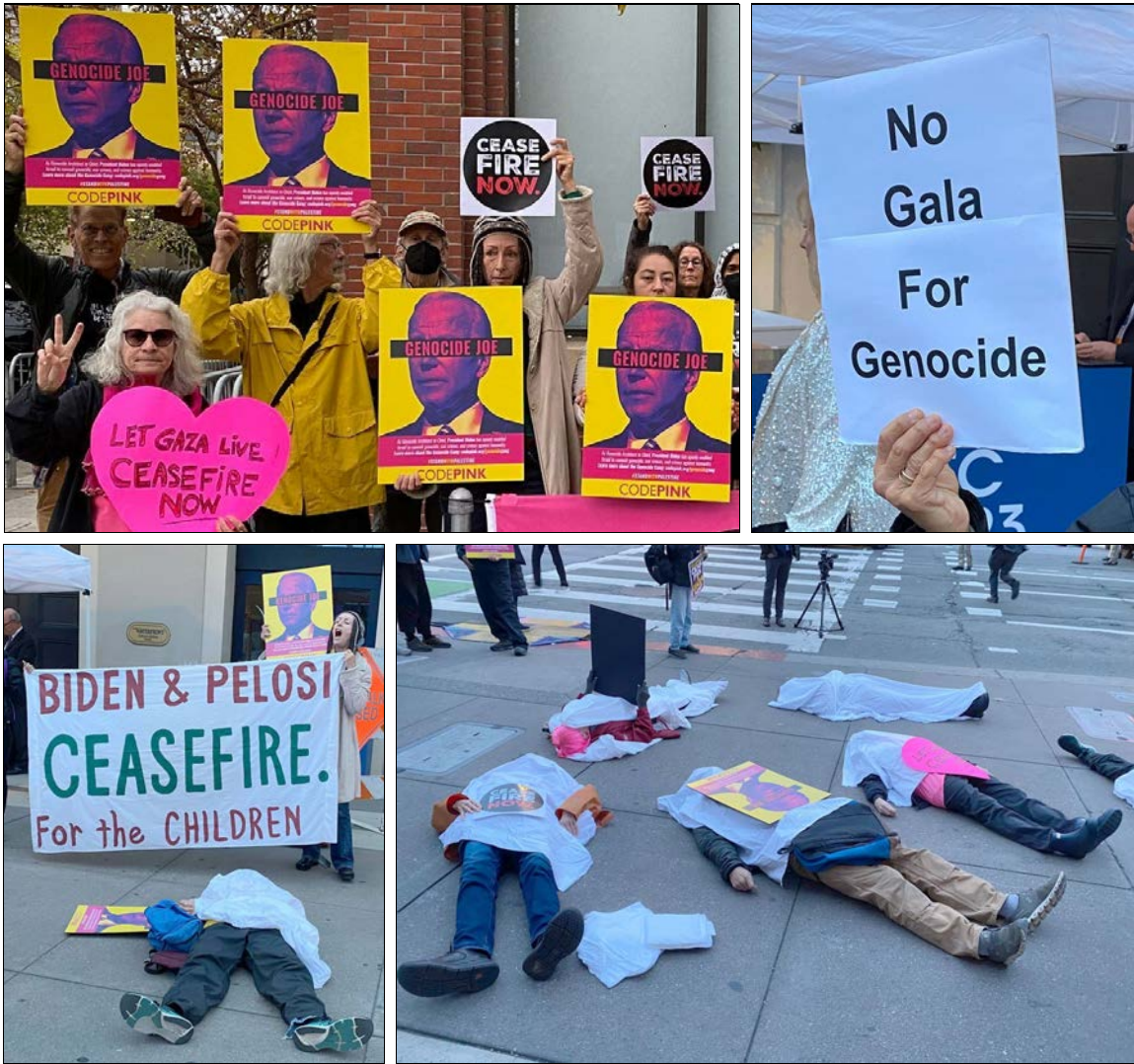
Die-in outside the APEC Gala Dinner, hosted by Biden, November 15, 2023.

On November 16 protesters shut down several lanes of the Bay Bridge during the morning rush hour, in support of the Palestinian people and to demand an immediate ceasefire and an end to U.S. military aid to Israel. The protest was organized by several groups, including the Palestinian Youth Movement and the Arab Resource and Organizing Center–Bay Area. San Francisco police declared the protest an "unlawful demonstration" and arrested 81 people. The protest effectively shut down bridge traffic heading into San Francisco. Numerous protesters chanted and tied themselves together with chains. Many protesters took part in a "die-in," laying down under white sheets that said, "Stop the genocide." Many protesters who drove onto the bridge during the protest apparently tossed their keys into the Pacific Ocean, further causing the massive delay on the bridge. California Highway Patrol Chief Ezery Beauchamp said, "We were not caught off guard. This was something that we were anticipating happening. We were here within a couple of minutes, but they were planned, they worked together, they brought their vehicles to a stop, and they got that accomplished within seconds." It took emergency officials four hours to reopen the Bay Bridge.