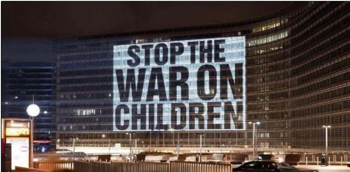
November 14, 2023