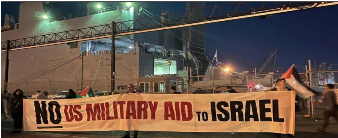
Israeli ship blocked in Oakland, California, November 3, 2023

As part of the current struggle to defend Palestine, people are taking the initiative to block transport of military materiel to Israel. This includes a picket line at the port in Oakland, California under the banner No U.S. Aid to Israel . For nine hours a ship to be used for military supplies for Israel was blocked from leaving port. Longshoremen respected the line and did not cross. Eventually the ship headed to Tacoma, Washington, a main port south of Seattle, where military supplies for Israel were to be loaded. Despite changing both the day and time for when the cargo was to be loaded, 1,000 demonstrators came out to block the ship for hours in Tacoma as well.