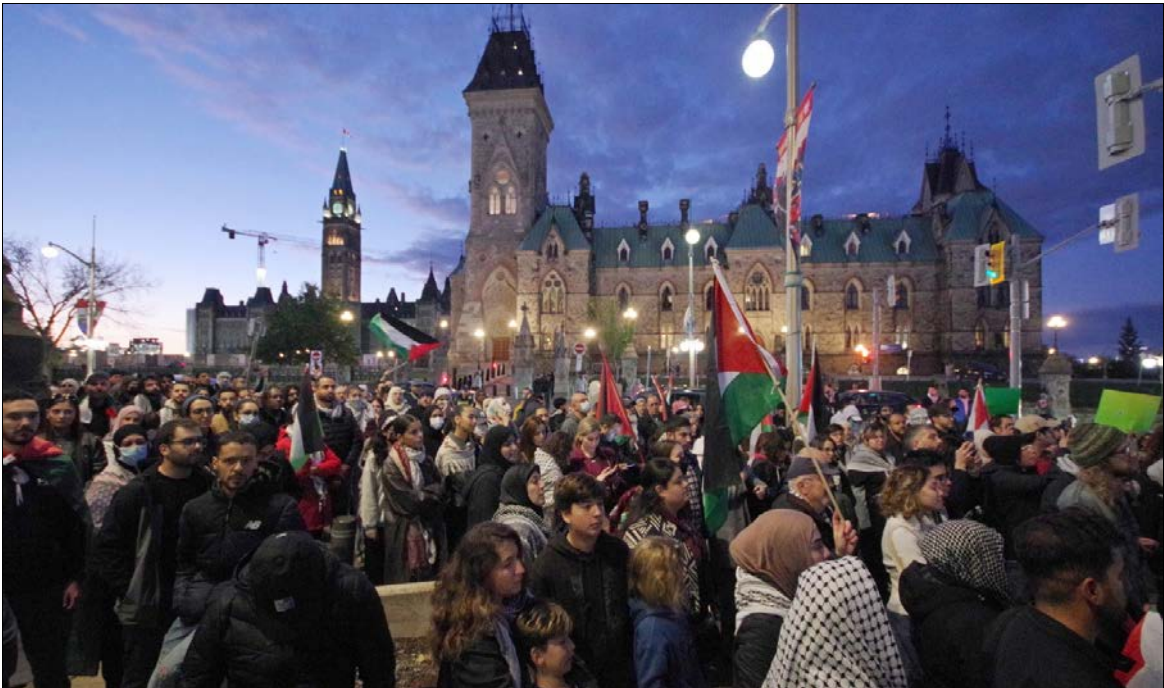
Emergency rally after Israeli bombing of Gaza hospital, October 17, 2023