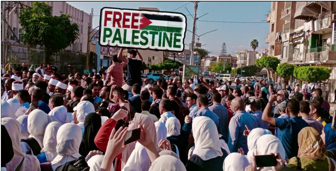
Kafr el Sheikh, Gaza, October 18, 2023