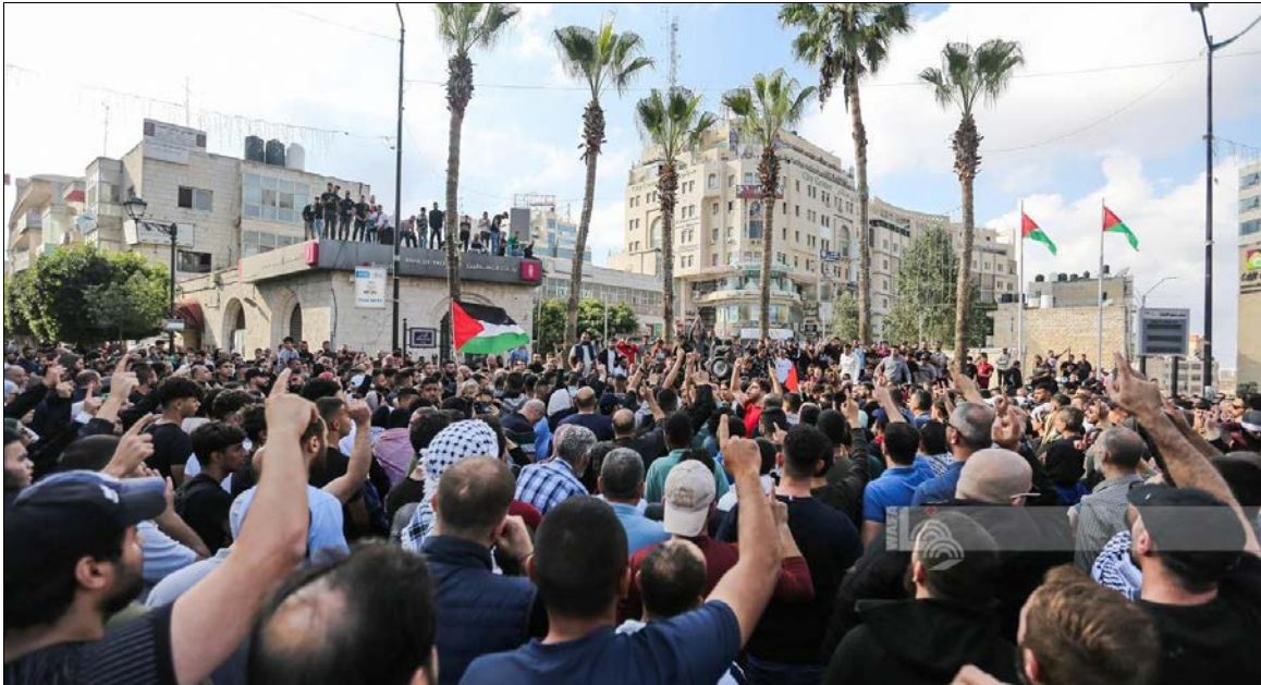
Defiant demonstration in Ramallah, Palestine condemns Israeli aggression, October 18, 2023, the day after the bombing of the Al-Ahli hospital

Millions of people throughout the world have risen in protest of the crimes Israel is committing in Gaza with the numbers swelling day after day following Israel's massacre of nearly 500 people when it bombed the Al Ahli Hospital. They demand an end to the atrocities Israel is committing in Gaza before the hospital bombing and since. They are also denouncing the green light the U.S. is giving for the Israeli war crimes by creating the diversion of Israel's alleged right to self-defence, as if war crimes and genocide can be justified in the name of self-defence.