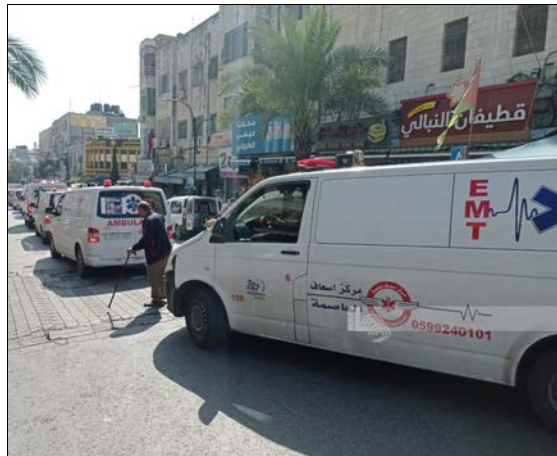
Ramallah, October 18, 2023