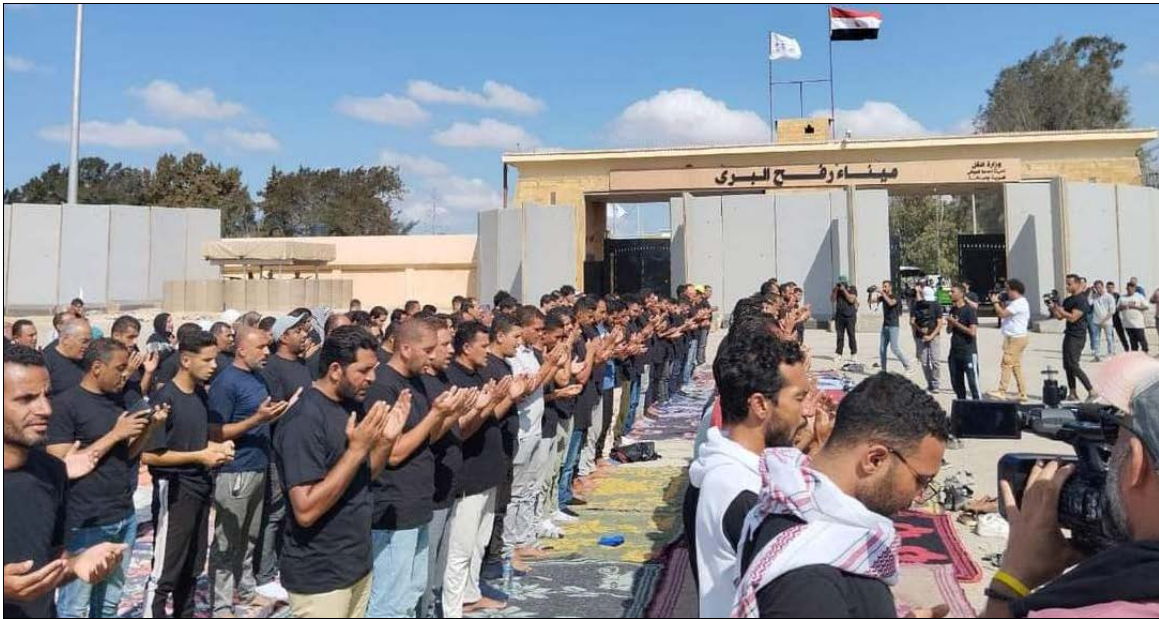
Rafah border crossing, Gaza, prayers for those massacred by Israel, October 18, 2023