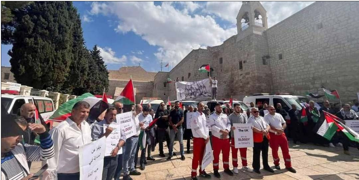
Bethlehem, October 18, 2023