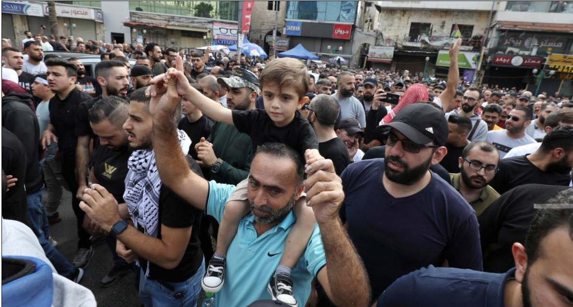
Nablus, October 18, 2023