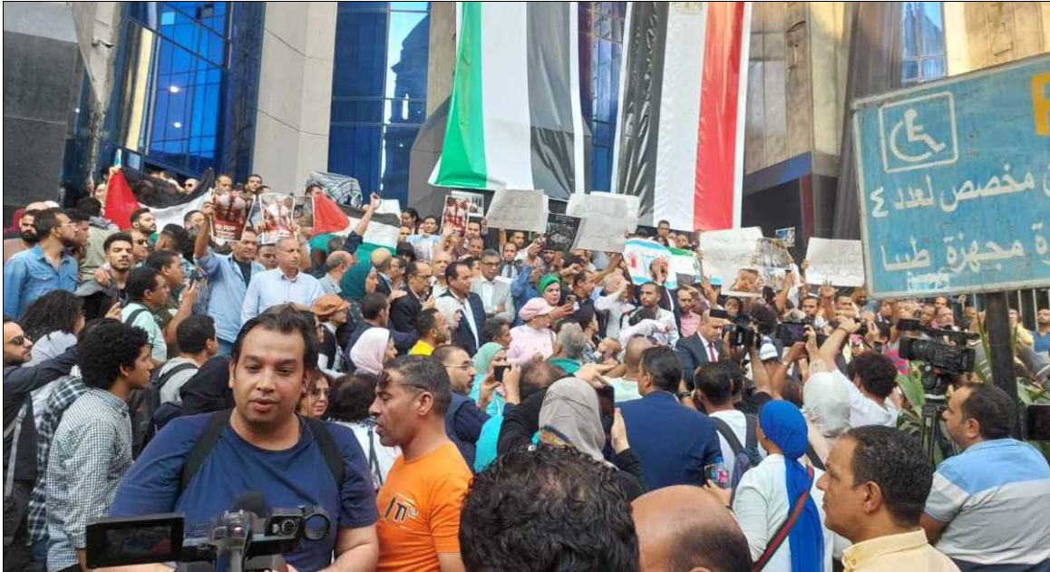
Mamdani hospital in Gaza, October 18, 2023