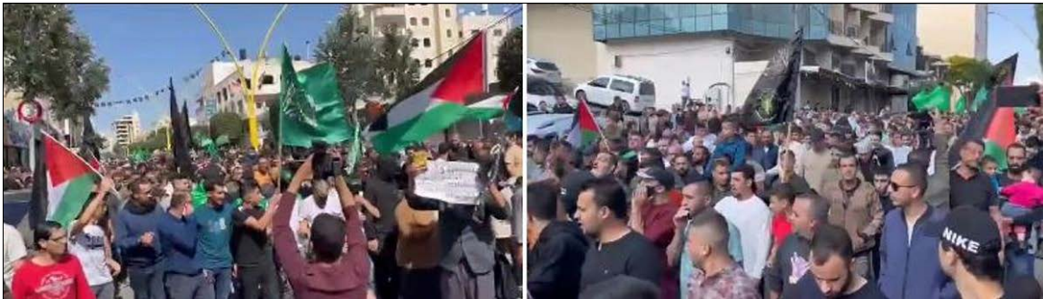
Hebron, October 17, 2023