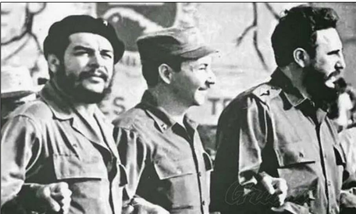
Che, Raúl and Fidel, 1959.