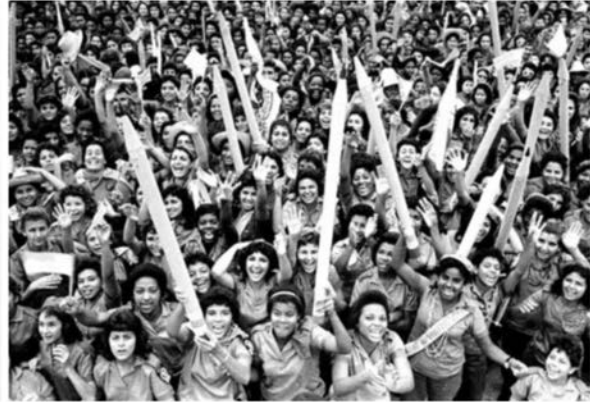
Cuba's historic literacy campaign is the initiative of Che and Fidel and raises the literacy rate to 96 per cent. On December 21, 1961, they join celebrations with Cuban literacy workers to mark the completion of the year-long campaign.