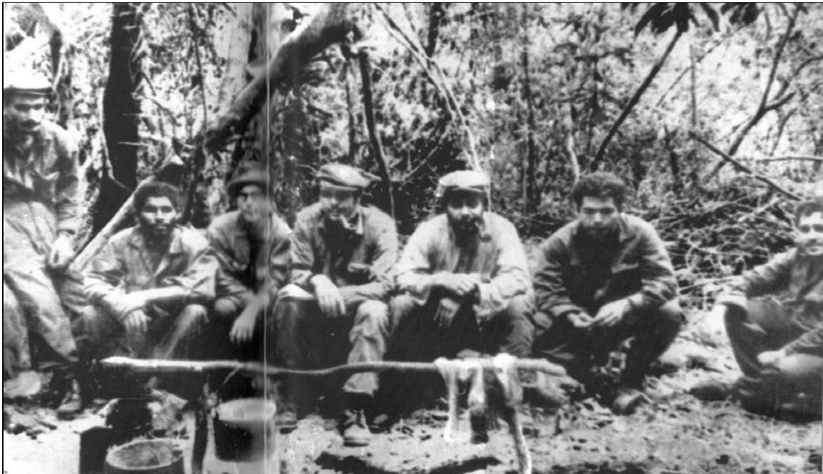
Che and the guerrillas of the Bolivian National Liberation Army share Christmas dinner, 1966.