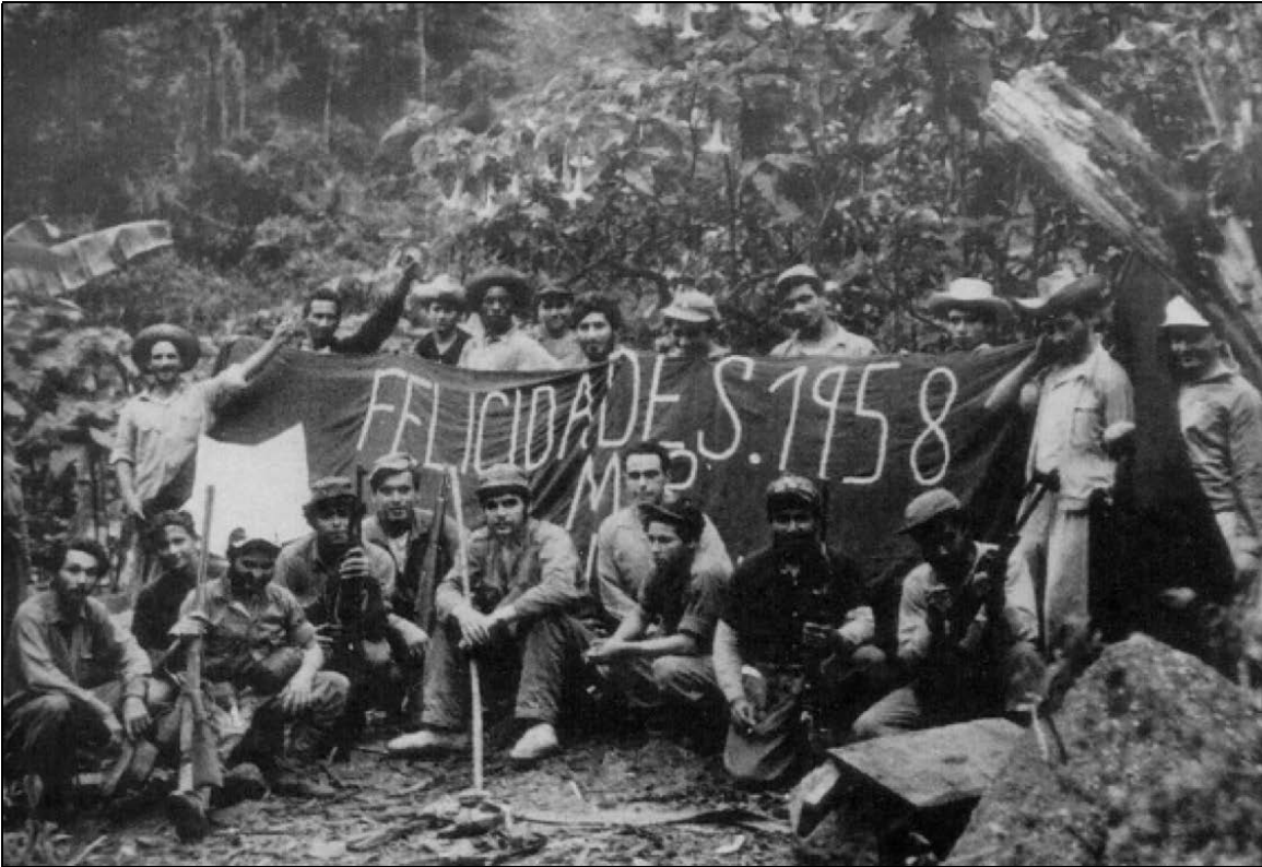
Cuban guerrillas in the Rebel Army's 4th Column led by Che Guevara celebrate New Year's 1958. Che's autonomous column began operations in late July 1957 and was the first troop to emerge from the original guerrilla force.