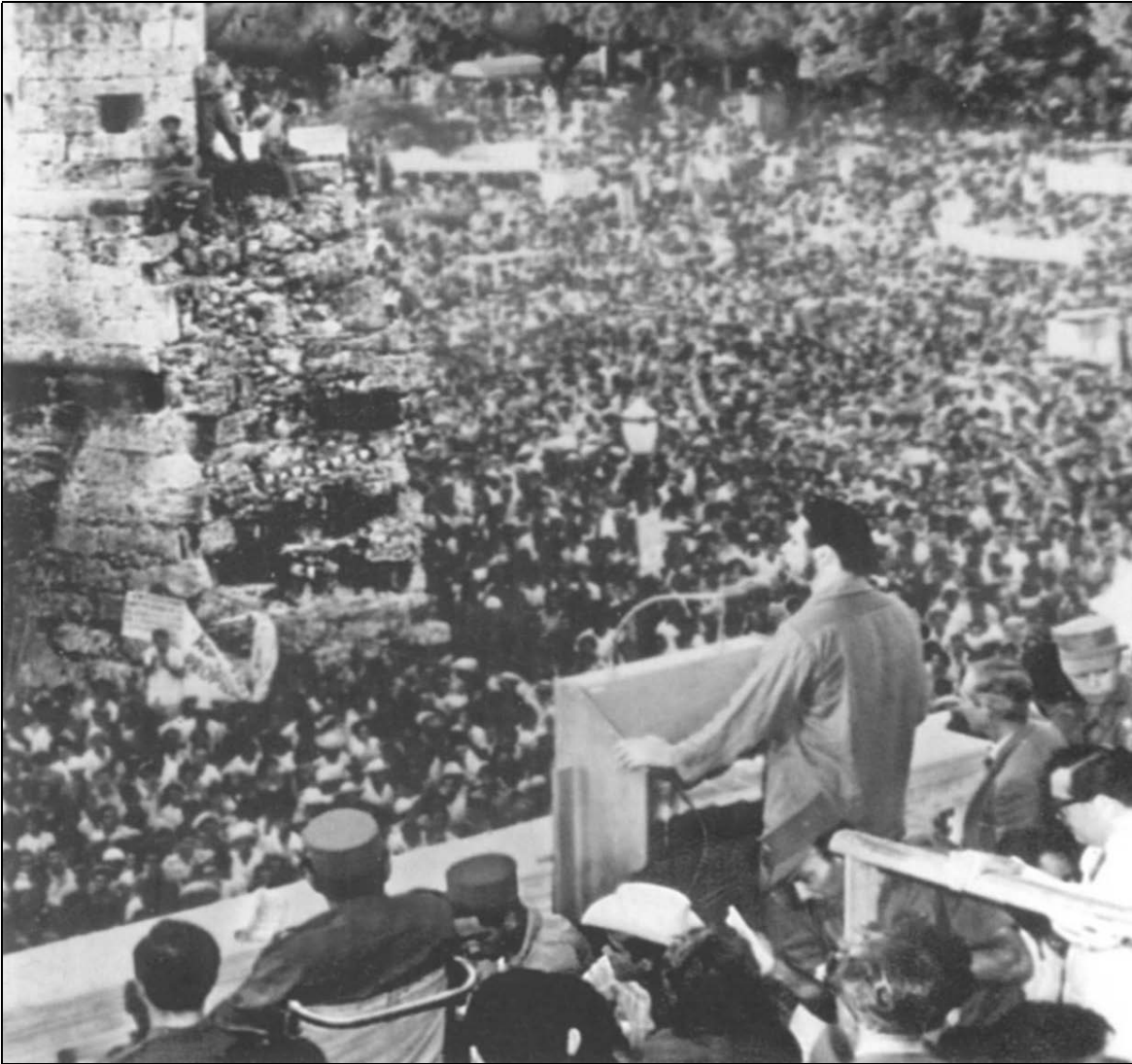
Che addresses massive demonstration outside the former presidential palace in Havana, October 26, 1959 to reject counterrevolutionary provocations from the U.S.