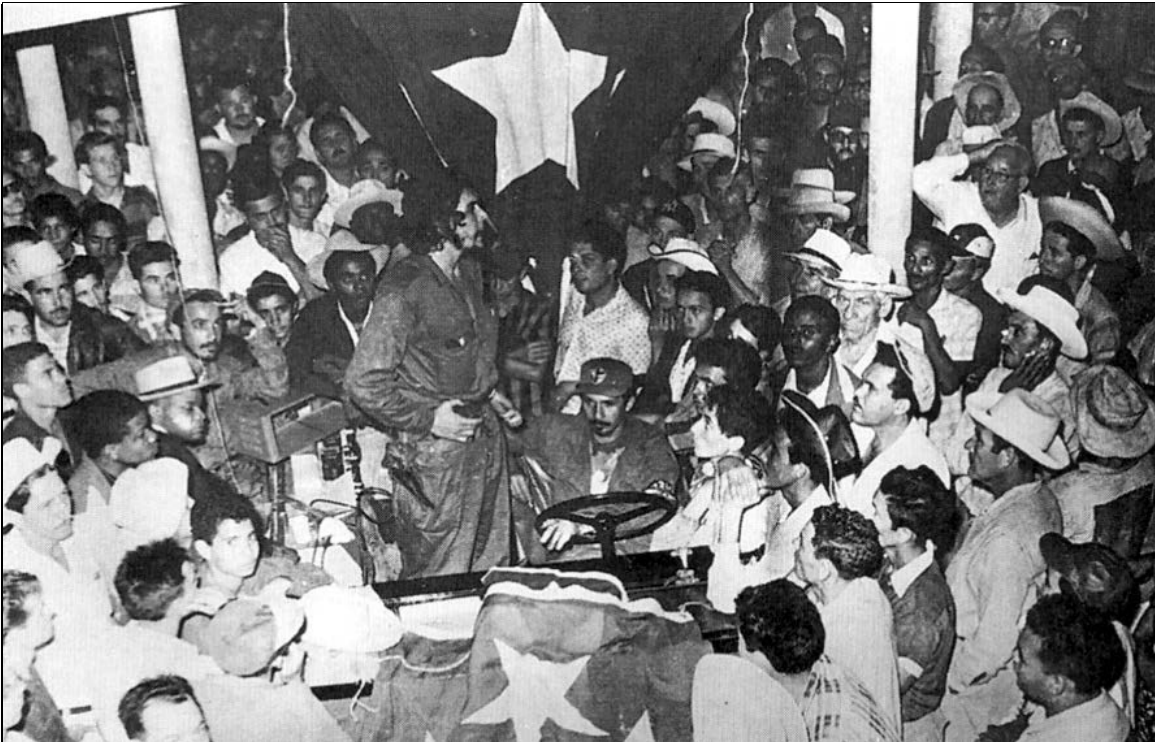
Che addresses the residents of Fomento, Las Villas province, November 1958. This is the first city in the region liberated by the rebel forces led by Che before they ultimately win the entire region. From here they move to central Cuba and the decisive battle of Santa Clara.