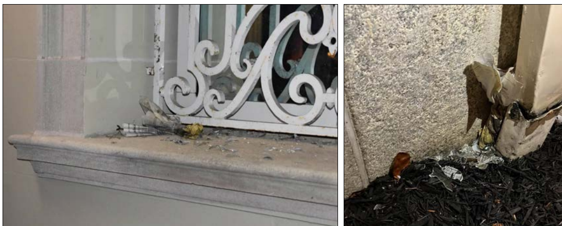
Remnants of the two Molotov cocktails thrown at the Cuban Embassy in Washington, DC, September 24, 2023.