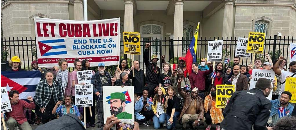
Solidarity action outside Cuban Embassy in Washington, DC, September 25 opposes U.S. hostile policy toward Cuba, including the latest terrorist on the embassy.

Last night, the Cuban Embassy in Washington D.C. was attacked with two Molotov cocktails thrown at the building. This is the second time in the past three years that there have been violent attacks against the Cuban Embassy. CODEPINK calls on the U.S. government to immediately investigate this attack as an act of terrorism. We also call on the U.S. government to take Cuba off its state sponsors of terror list. We must put an end to the aggression towards Cuba and work towards normalizing relations with our island neighbor.