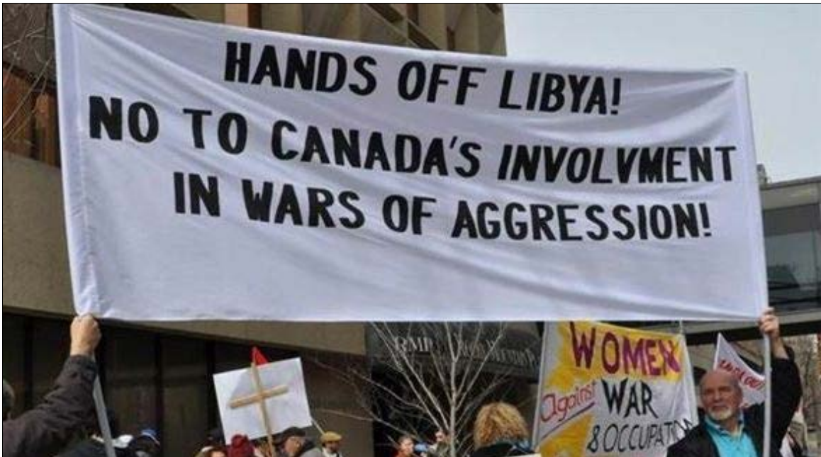
Calgary, April 9, 2011.

NATO's criminal war against Libya was carried out in the name of the imperialist doctrine of "Responsibility to Protect." The aggression occurred in the context of what was called the "Arab Spring," in which protests took place against various governments in North Africa and the Middle