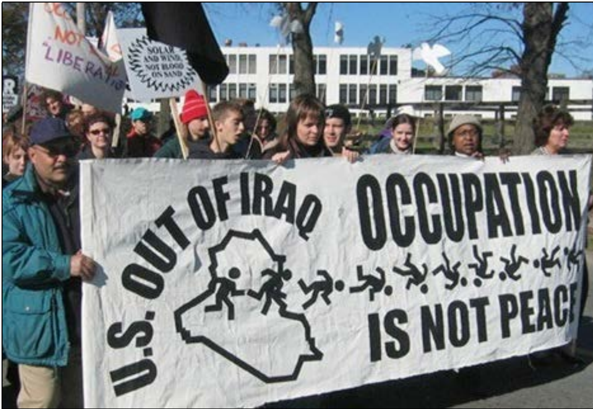
Halifax, October 25, 2003.