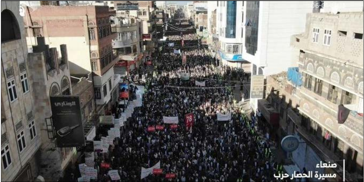
January 7, 2023 rally in Yemen against the blockade.

Website: www.cpcml.ca Email: editor@cpcml.ca