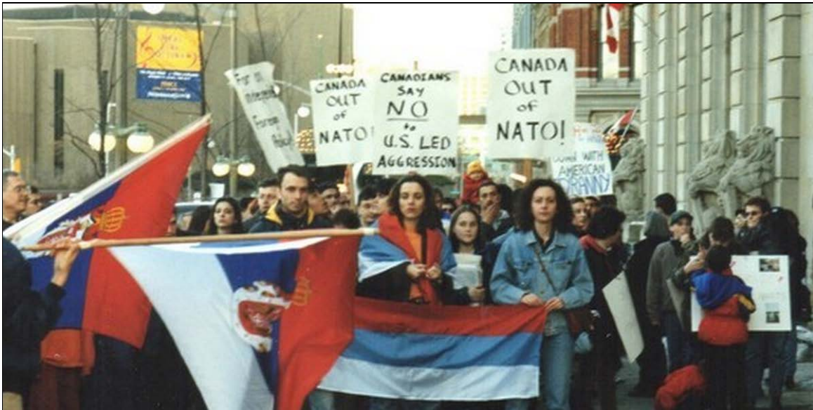
Ottawa, March 28, 1999