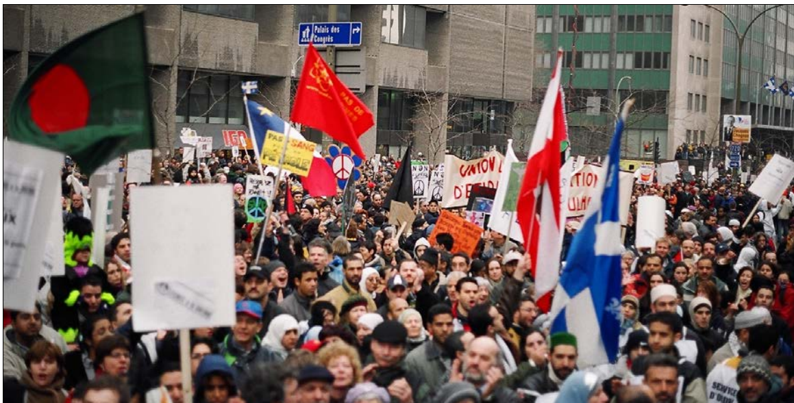
Montreal, March 22, 2003