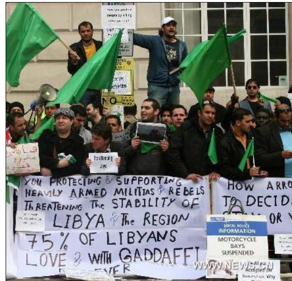
Protest outside the London Conference on Libya, March 29, 2011, where 40 countries and organizations, including the UN, NATO and the Arab League plot war and regime change.

The Communist Party of Canada (Marxist-Leninist) pointed out on the fourth anniversary of the war: "The war propaganda was so deceptive as to turn all the old terms and definitions from the 20th century into their opposite. Those terms became weapons in the hands of the imperialists to launch their aggressions and trample on public right.