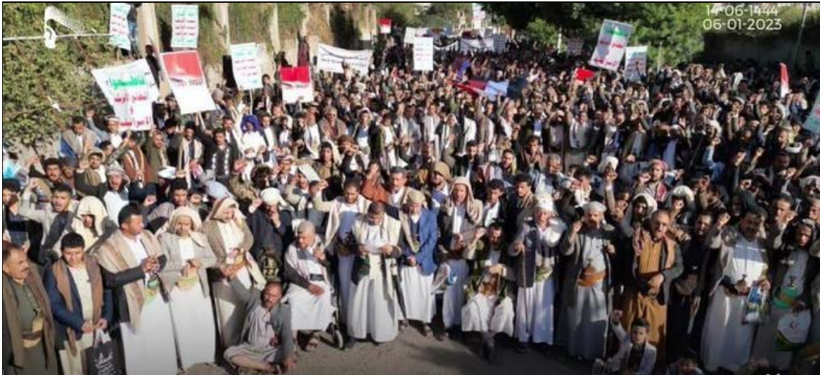
Protests in Yemen, January 7, 2023.

Canada is fully complicit with the crimes committed by Saudi Arabia in Yemen.