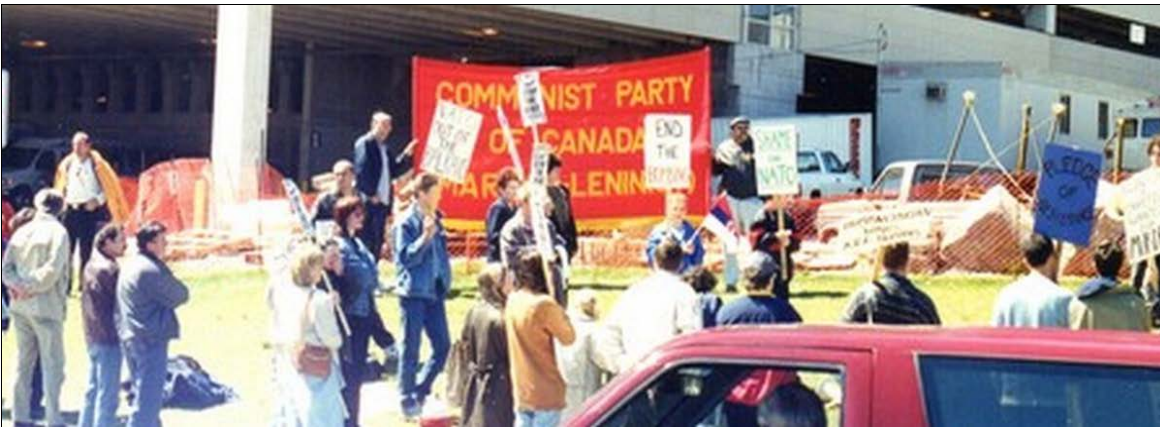
Windsor, April 17, 1999