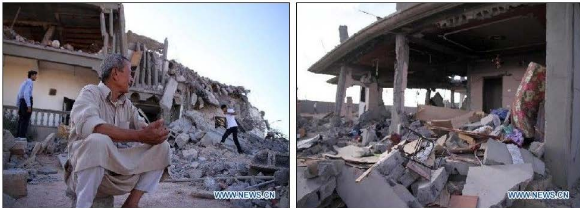
Houses hit by NATO air strikes in the village of Majer, August 9, 2011.

After this crime, the fraud that NATO was killing Libyans to defend protestors or promote freedom and democracy was forgotten. After a 24/7 monopoly media bombardment promoting the wildest tales to justify imperialist aggression, and then lionizing the brutal activities of NATO and its allies on the ground, Libya disappeared from the news save for occasional mentions of the dysfunctional state of the country and the ongoing crimes against the people committed by those NATO put in power. These included genuine instances of slaughter of protestors which were now no cause for alarm for NATO or the U.S. and Canadian ruling circles.