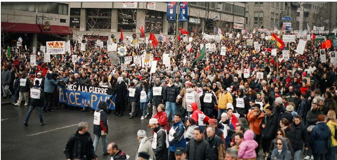
Montreal anti-war demonstration, March 22, 2003.

Referring to the impending all-out U.S. war against Iraq, on March 17, 2003, Prime Minister Jean Chrétien announced that "If military action proceeds without a new resolution of the Security Council, Canada will not participate." There was no UN resolution, only massive U.S. imperialist disinformation about weapons of mass destruction, the "evil Saddam Hussein" and the sacred U.S. dedication to the cause of peace, freedom and democracy.