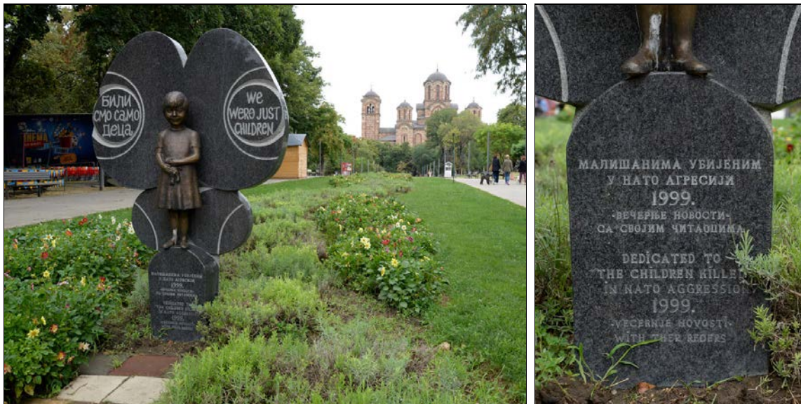
Memorial to the children killed by NATO's aggression against Yugoslavia, Tasmajdan Park, Belgrade, Serbia.