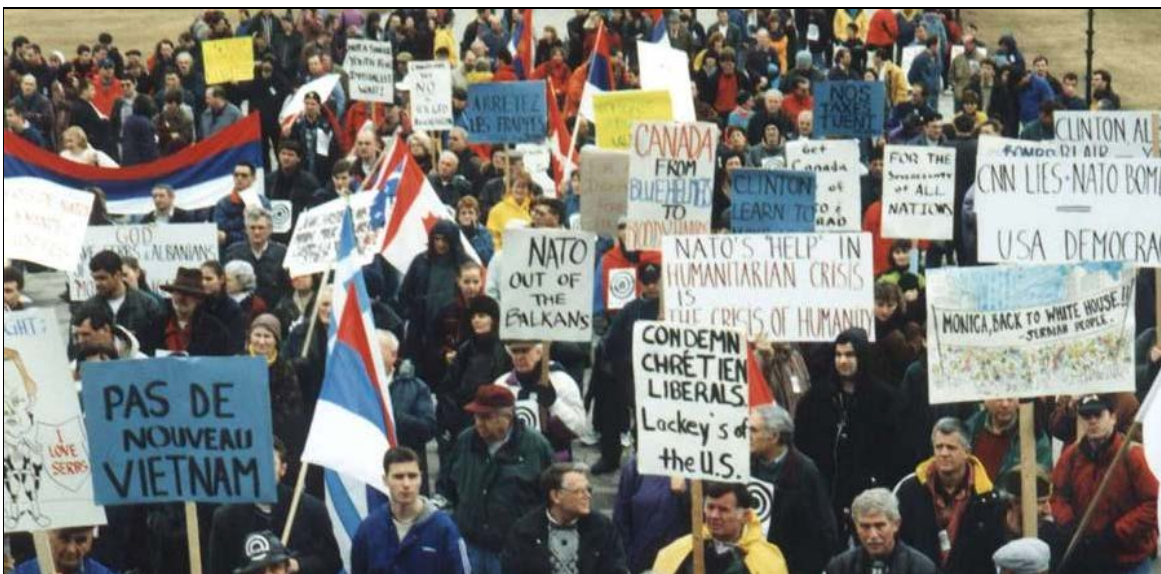
Ottawa, April 4, 1999.