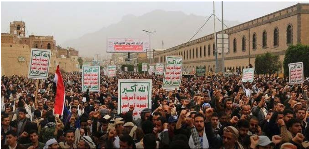
Rallies took place in cities across Yemen on January 7, 2023 against U.S.-Saudi aggression under the banner that "seige is war."

Saudi Arabia, Egypt, Morocco, Jordan, Sudan, Kuwait, the United Arab Emirates, Qatar and Bahrain began bombing Yemen on March 26, 2015, after receiving U.S. authorization. An uprising had been taking place in the country, the poorest in the region, led by the Houthi rebel group. In late January 2015 the U.S.- and Saudi-supported Yemeni President Abdrabbuh Mansour Hadi had been forced to resign due to the uprising and mass protests against his policies. The resistance forces of the Yemeni people, known as the Ansarullah movement, established a Supreme Revolutionary Committee to assume the presidency. Mansour Hadi retreated to Aden a month later and withdrew his resignation.