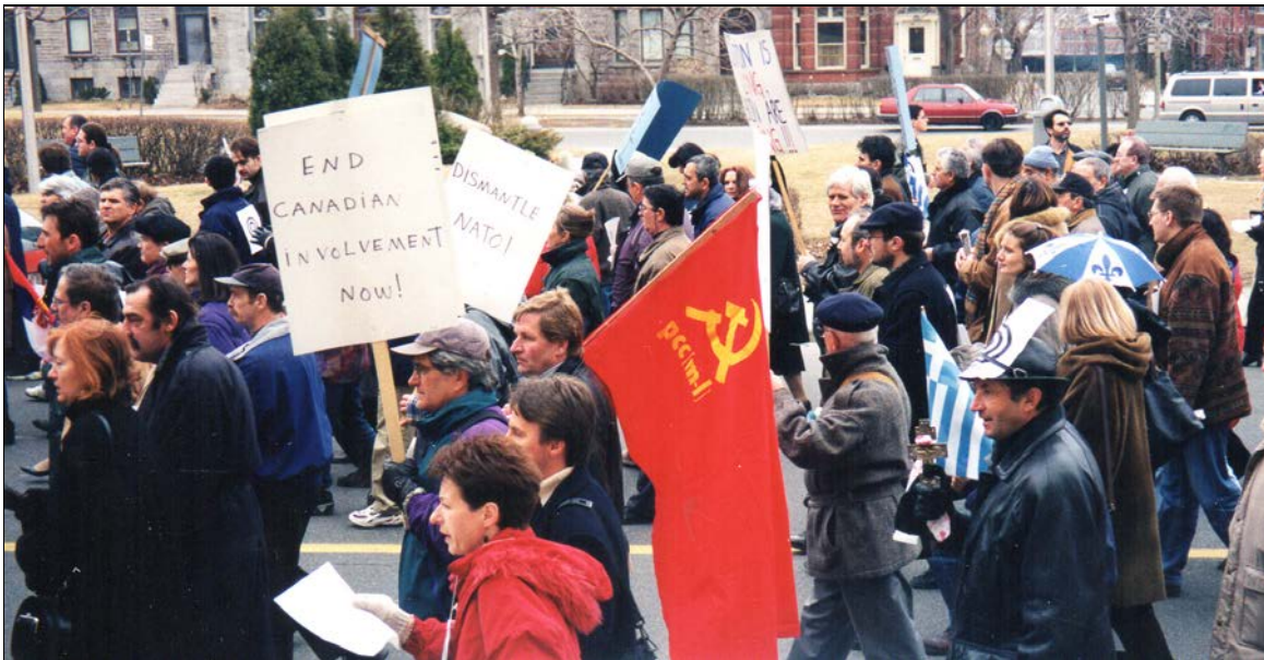
Montreal, April 3, 1999