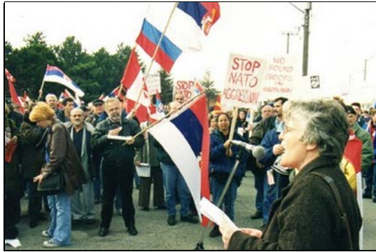
Toronto, April 17, 1999