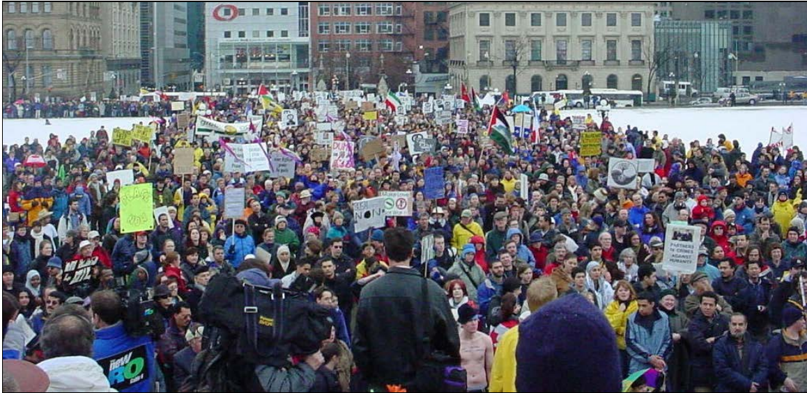
Ottawa demonstration, March 22, 2003.