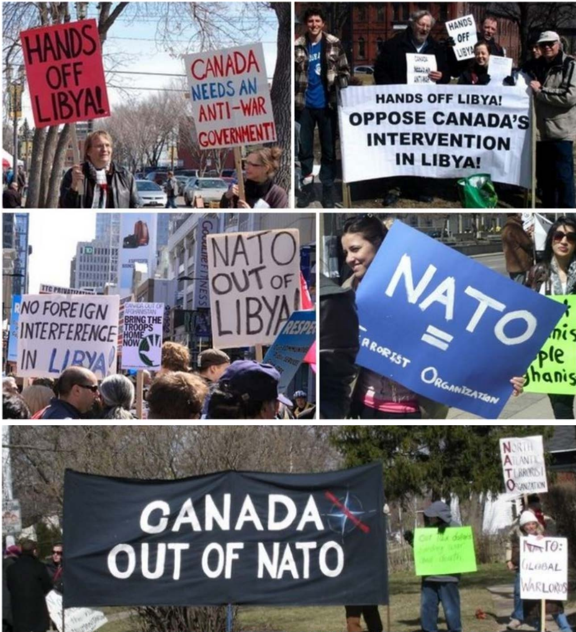
Demonstrations across Canada against NATO's bombing of Libya in 2011.