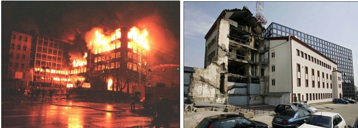
Indiscriminate bombing of civilian targets by NATO included the Serbian Ministry of the Interior (left) and Serbia Radio Television.

The plans for a "Greater Middle East," the interference in Sudan, Tibet and the Caucasus, campaigns against Zimbabwe, Cuba, Somalia and Lebanon, the subsequent destruction of Libya, aggression against Syria as well as constant threats of war directed at Iran and the Democratic People's Republic of Korea, the acts of aggression and sanctions against Venezuela as well as engineering coups d'état against Haiti, Bolivia, Honduras and Peru, amongst others, and the U.S.-proxy war against Russia using Ukraine all show that the "new world order" based on achieving U.S. striving for domination by using force, has left a sea of devastation and human misery in its wake. The path NATO set in Yugoslavia violates the UN Charter and international rule of law which are based on renouncing the use of violence to sort out conflicts between nations.