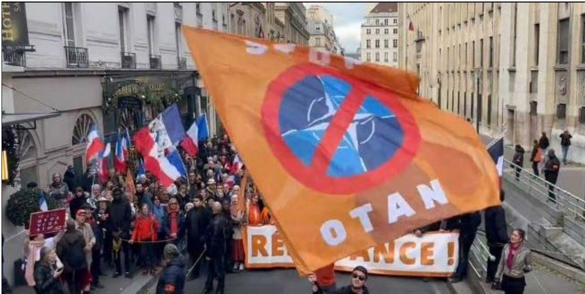
Demonstrations in France, January 14, 2023 and November 19, 2022, that are part of broad scale protests against the anti-social offensive, also oppose NATO.