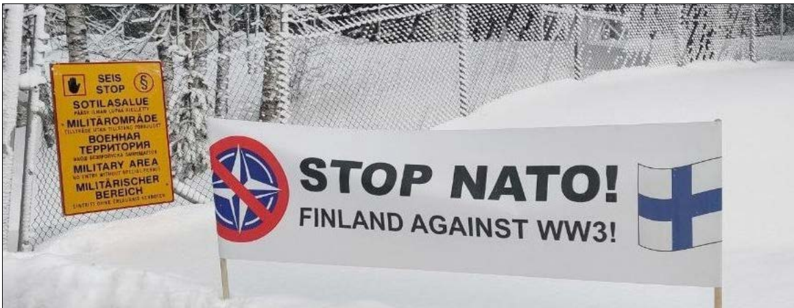
Protest against NATO in Finland, February 21, 2023.