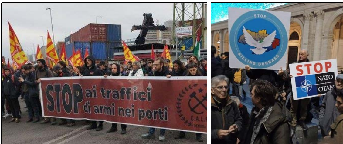
Anti-war demonstration in Genova, Italy, February 25, 2023, opposed arms shipments to Ukraine and called for peace.