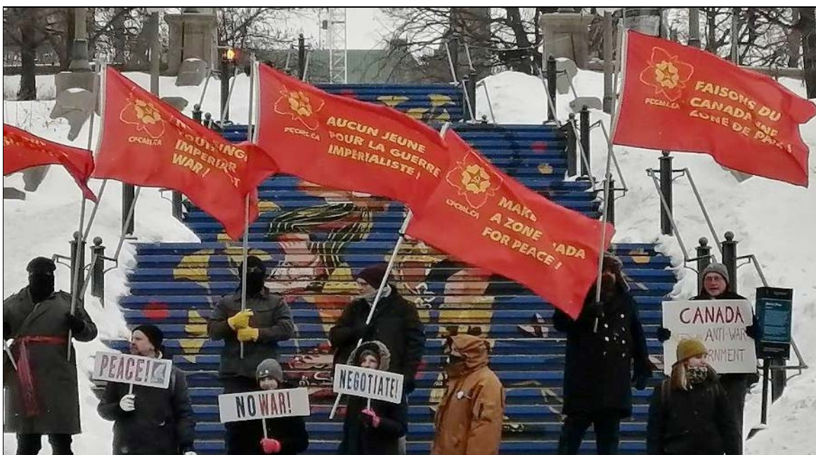
Picket outside U.S. embassy in Ottawa, February 23, 2023.