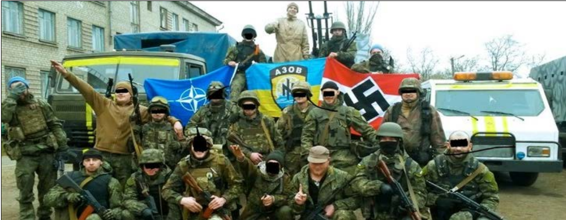
Members of the Azov Battalion pose with NATO flag in photo posted on twitter.

Evidence shows that through Operation UNIFIER Canada provided training for the Banderite Nazi battalions that are part of Ukraine's military -- a fact the Prime Minister and his government deny and which other cartel parties with seats in the Parliament do not address.