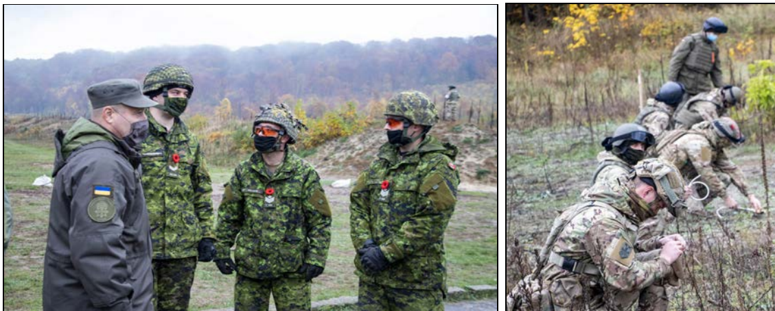
Canadians training the neo-Nazi Azov Battalion, November 3, 2020. Right: soldier in foreground sports neo-Nazi insignia.

Prior to this, on April 11, Radio Canada reported that Canadian military personnel trained both members of the neo-Nazi Azov Battalion as well as at least one Ukrainian soldier who sported the crest of a Nazi SS unit from World War II. The training took place in November 2020, Radio Canada said.