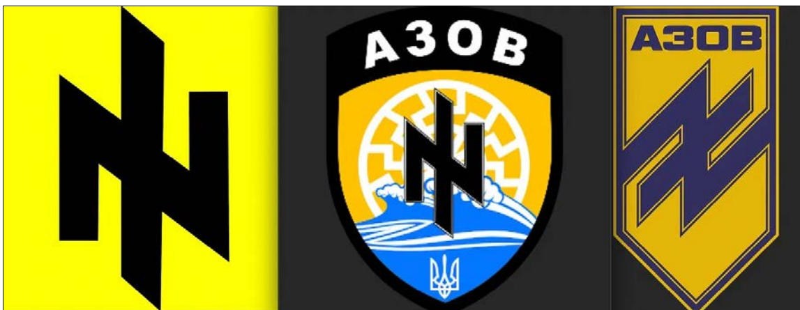
Evolution of the Azov insignia. Besides the wolfsangel, the Black Sun in the middle version is also a Nazi symbol.