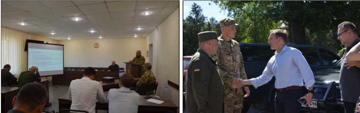
Meeting between Canadian officials and the neo-Nazi Azov Battalion, June 18, 2020.

The Citizen notes that in June 2018, Canadian officials, including military personnel, met with leaders of the Azov unit, despite knowing about its espousal of Nazi ideology. National Defence documents show that their concern was not the interactions with the Azov unit and neo-Nazis, who were clearly part of what Canada officially calls freedom fighters. The concern was that news media would expose details of the meeting when Canadians allowed themselves to be with unit members, which the Azov Battalion then used for propaganda purposes.