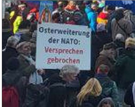
"NATO's eastward expansion: promise broken."

Representatives of various countries from what is called the Global South were invited to persuade them to join the U.S./NATO coalition opposing Russia and China. The MSC claimed to be "paying due respect to the legitimate resentment that many countries of the 'Global South' have toward the existing order."