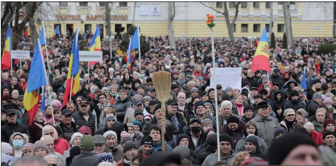
Thousands demonstrate in the streets of Chisinau, Moldova, February 19, 2023 against pro-NATO government.