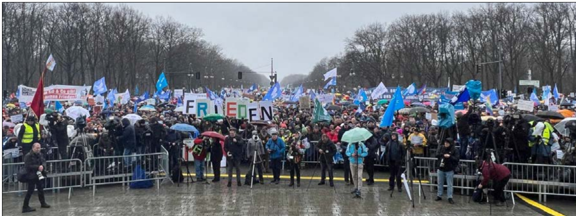
Fifty thousand people participate in anti-war rally in Berlin, February 25, 2023, which opposed sending arms to Ukraine.

In countries across Europe protests have taken place during January and February of this year, as well as in 2022, against NATO and against sending military weapons to Ukraine. In Berlin some 50,000 people took to the streets on February 25 to oppose Germany sending arms and military materiel to Ukraine and demanding diplomatic initiatives and negotiation. Mass demonstrations