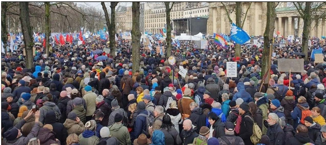
Berlin, Germany, February 25, 2023