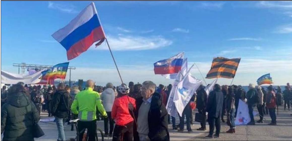
Protest against NATO and military aid to Ukraine in Rimini, Italy, February 19, 2023 (top) and Remo, Italy, February 11, 2023.