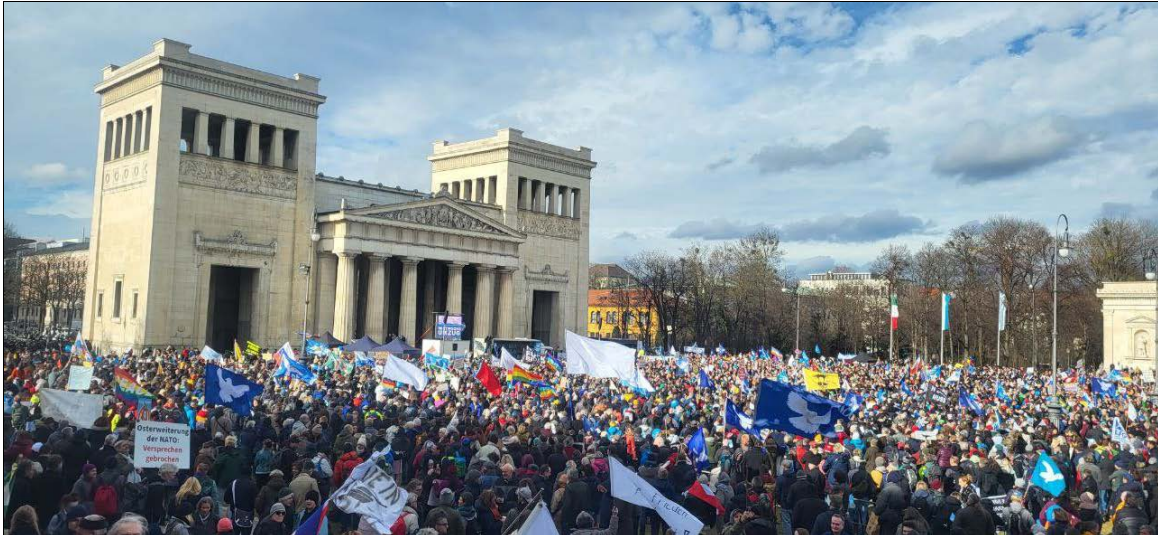
Anti-war protest outside this year's Munich Security Conference.

Some 30,000 people gathered outside the 49th Munich Security Conference (MSC) held in Munich from February 17 to 19 to militantly oppose the U.S./NATO proxy war in Ukraine. They demanded a negotiated peace, that NATO be dismantled, and for sanctions against Russia to end. They opposed more spending on arms while social programs are neglected and cancelled.