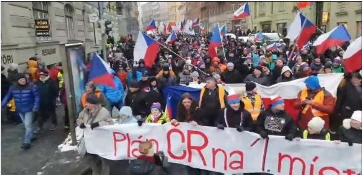
Demonstration in Prague, Czech Republic, January 25, 2023.