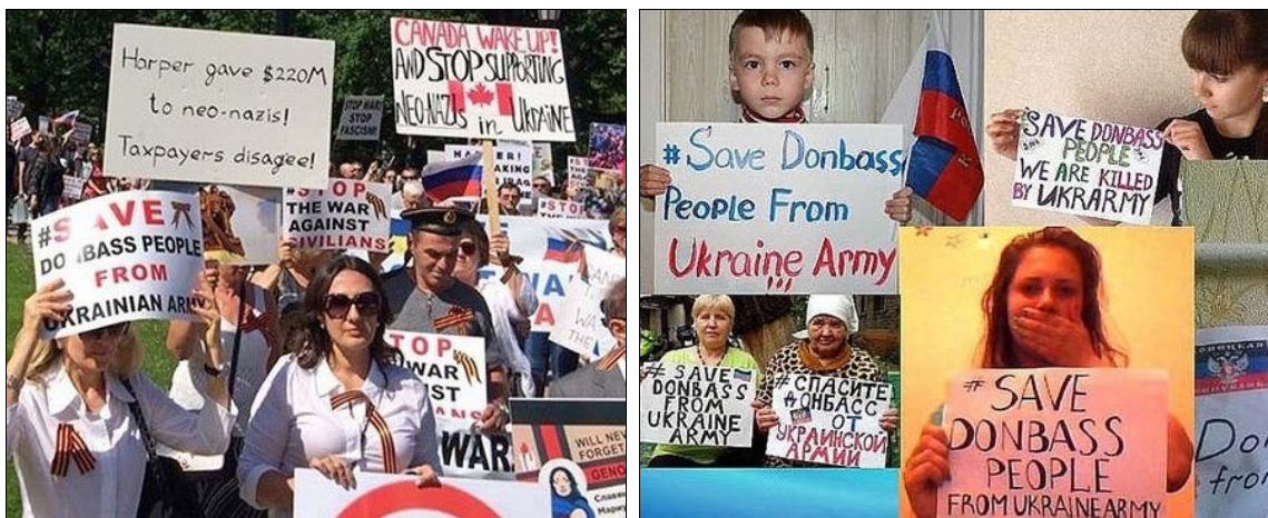
Left: picket in 2014 in Ottawa demanding Canadian government not support and fund neo-Nazis in Ukraine; right: 2020 social media post from Donbass, Ukraine

Beyond that, there is no need to comment on the outlook Russia espouses because it is the one that has been demanding a negotiated settlement since 2014 and continues to do so today and this too should be done. Furthermore, nobody can seriously argue that its cause, which demands international recognition and enforcement of legitimate security guarantees against threatening NATO enlargement is not just, or that the population of the Donbass does not deserve to be protected against the crimes committed against it by neo-Nazi formations.