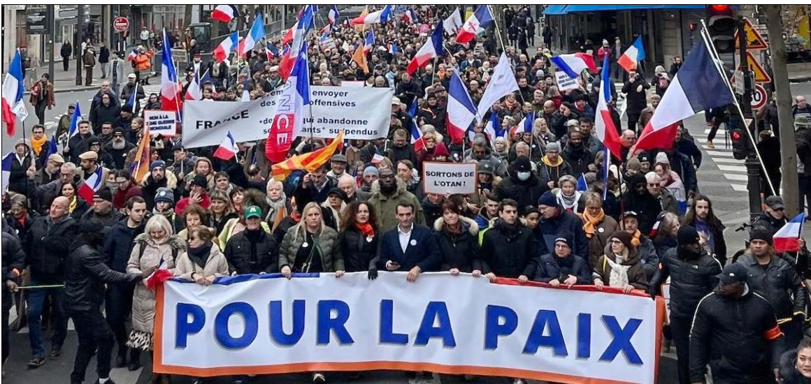
February 12, 2023 tens of thousands take to the streets of Paris chanting Let's Get Out of NATO!" and "No Missiles for Ukraine!"