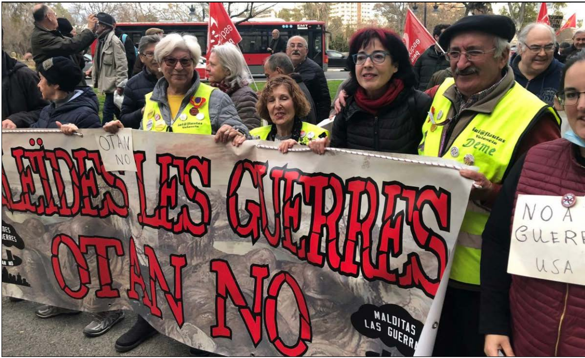
Banner against NATO in demonstration in Spain, February 25, 2023