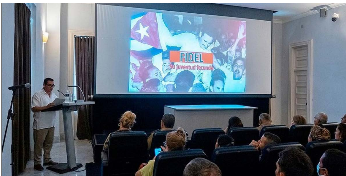
A new documentary on Fidel is screened in Havana on November 23, 2022.

The film is accompanied by a multimedia presentation of photos and videos. This audiovisual production will serve as a basis to deepen the knowledge of young Cubans about Fidel as a child, adolescent and youth, providing the new generations with a more comprehensive vision of Fidel as a patriot, thinker, revolutionary and human being. The film and multimedia presentation will be disseminated through educational centres across the country.