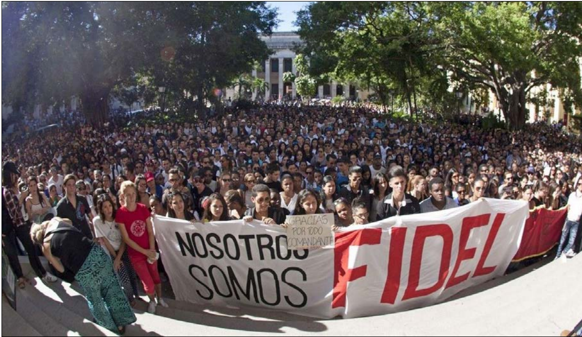
Cuban youth commemorate Fidel, November 28, 2016.