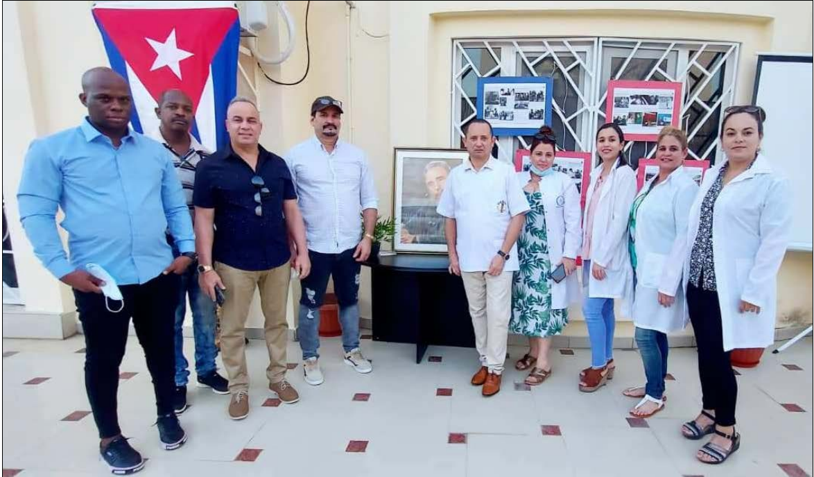
Health care workers at the José Martí Pediatric Hospital in Sancti Spiritus pose with a tribute to Fidel, November 24, 2022.