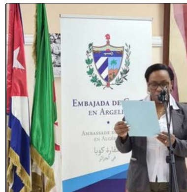
The Cuban Embassy in Algeria hosts a commemoration of Fidel, November 24, 2022.