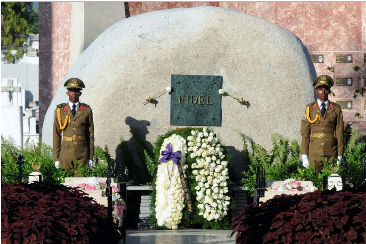
Fidel's tomb in Santa Ifigenia Cemetery in Santiago de Cuba, where he takes his place among Cuba's pantheon of heroes.

Let everyone honour the memory of Fidel Castro in practical ways, by standing in solidarity with the Cuban Revolution through the activities of the Cuba friendship and solidarity movement, by strengthening the anti-war movement, upholding the friendly relations between Cuba and Canada and opposing all foreign interference in Cuba's internal affairs.