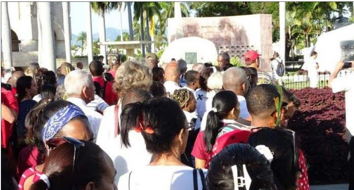
Ceremony November 25, 2022 at Fidel's tomb at Santa Ifigenia Cemetery in Santiago de Cuba.

In Cuba on November 25, an early morning event was held at Fidel's tomb at Santa Ifigenia Cemetery in Santiago de Cuba attended by Army General Raúl Castro, members of the Council of Ministers and other dignitaries.