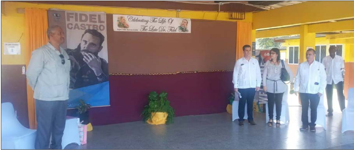
At the Fidel Castro Campus of Anchovy High School in Anchovy, Jamaica, members of Cuba's diplomatic corps in Jamaica join with teachers, students and members of the solidarity movement to commemorate Fidel, November 24, 2022.