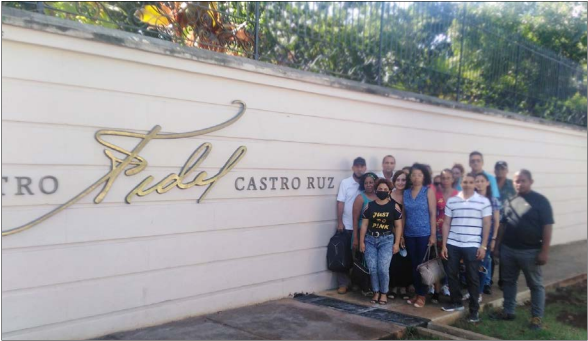
Cubans pay tribute to Fidel at the Fidel Castro Ruz Center in Havana, November 24, 2022.