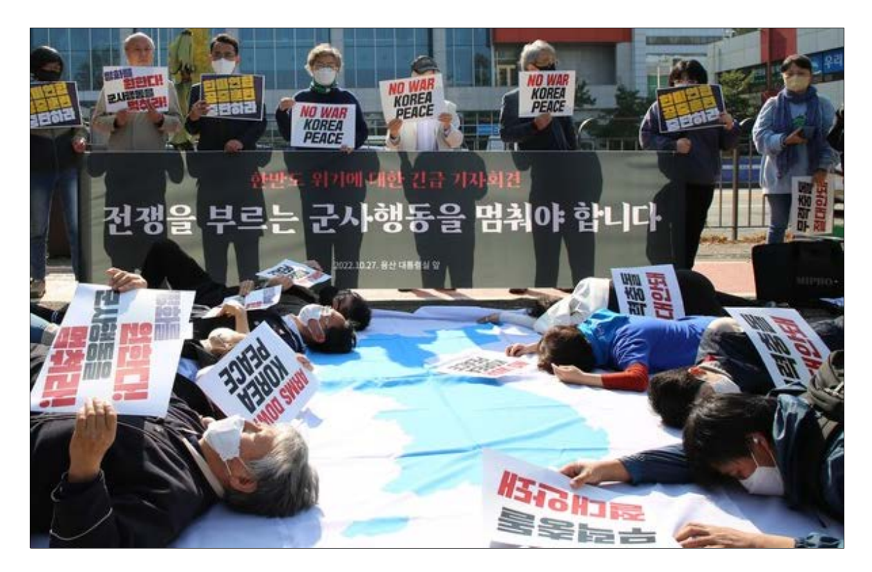
(Tongil News. Translated from the original Korean by TML.)

Website: www.cpcml.ca Email: editor@cpcml.ca