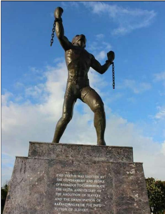
The Emancipation Statue standing in Bridgetown, Barbados.

as one of respect for the dead. But let Vladimir Putin die suddenly tomorrow and you will see how much they believe in not speaking ill of the dead. How exactly was this respect for the dead demonstrated on the death of Muammar Gadhafi, Robert Mugabe or any other political leader that came into conflict with British colonialism? No, this has nothing to do with respecting the dead and everything to do with defending Britain's colonial crimes.