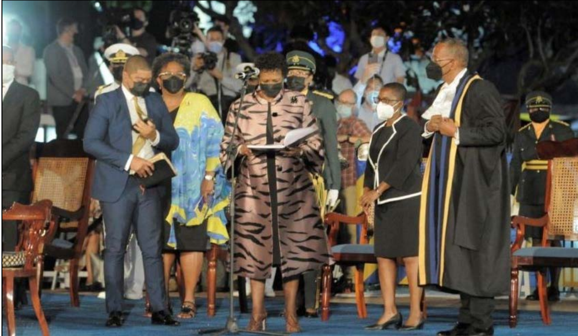
Barbados renounces the monarchy and swears in its first President, Dame Sandra Mason, November 30, 2021.