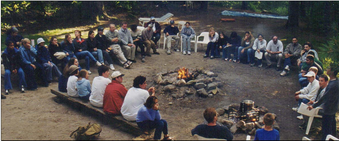
Youth camps were organized in the Gatineau hills by the Youth Organizing Project.