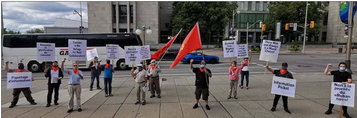
Youth organize picket against the glorification of Nazism, Ottawa, August 21, 2021.

The youth face conditions that are most destructive to their economic and spiritual well-being. Managers regularly demand that the youth speed up at work, yet all the while they must remain eternally grateful to have jobs! In other words, they are forced to submit not only to economic exploitation but also to the capitalist dictate: Do not think of anything else except "life" within this system. For all intents and purposes, these youth feel as if they are on the margins of society and life, which is materially and spiritually devastating.