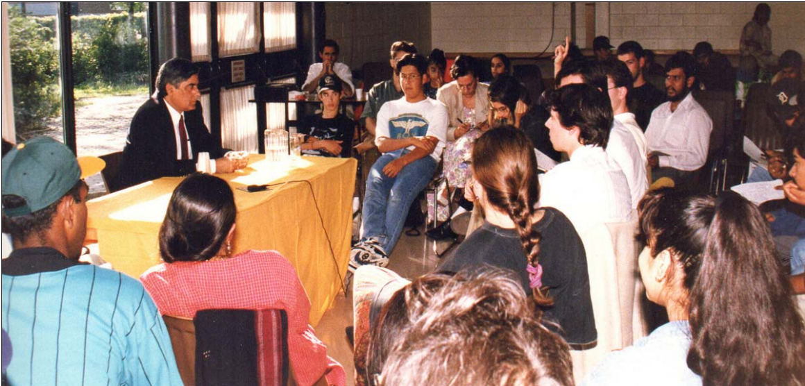
An afternoon with the youth, Toronto, August 30, 1992