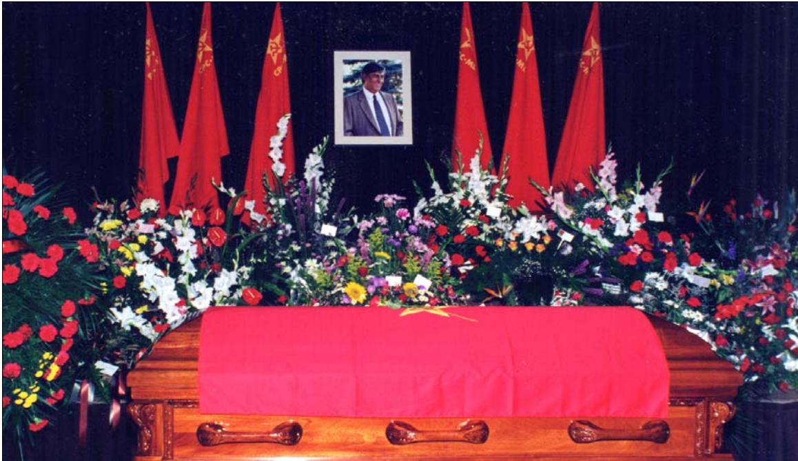
The casket was brought into the hall led by the red Party flag, inscribed with the words: Historic Initiative, in honour of the work Comrade Bains developed to transform CPC(M-L) into a mass communist party and take Canada into the 21st century on a new basis.