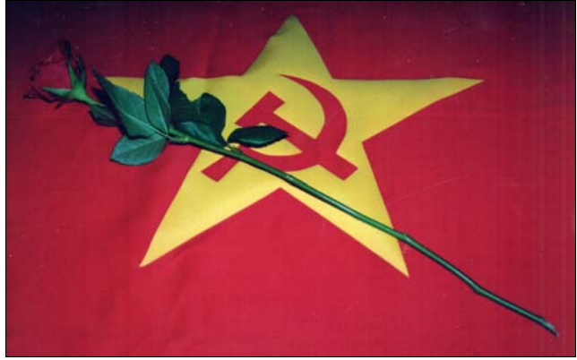
When the casket was placed at the front of the hall, a young pioneer laid a single crimson rose on the red flag of revolution and communism which draped the casket.