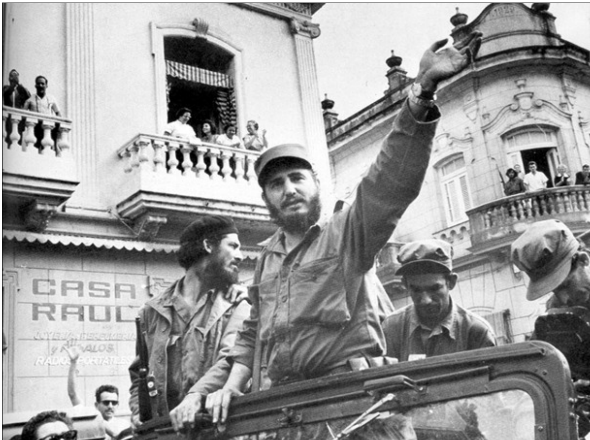
Fidel Castro and the victorious rebel forces are welcomed in Havana, January 8, 1959.