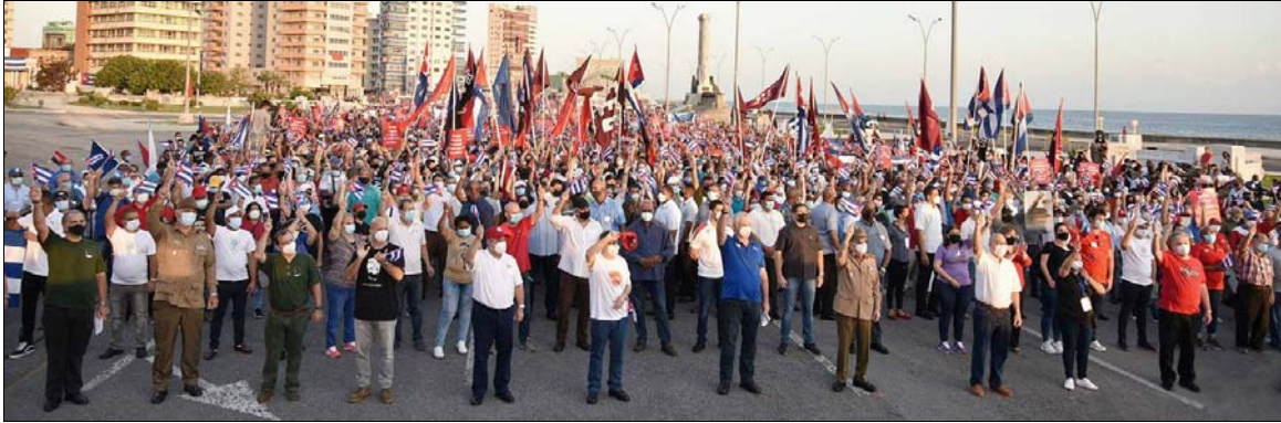
Cuba defends its sovereignty. Mass rally in Havana in defence of the revolution, July 17, 2021.

[...] We must say how we see things. It is perhaps the principle of sovereignty, is it perhaps the law, that has protected and continues to protect our country in the face of Yankee invasion? No one believes this. If it were the law, if it were the principle of sovereignty that was protecting our country, it is certain that this revolution would have disappeared from the face of the earth.