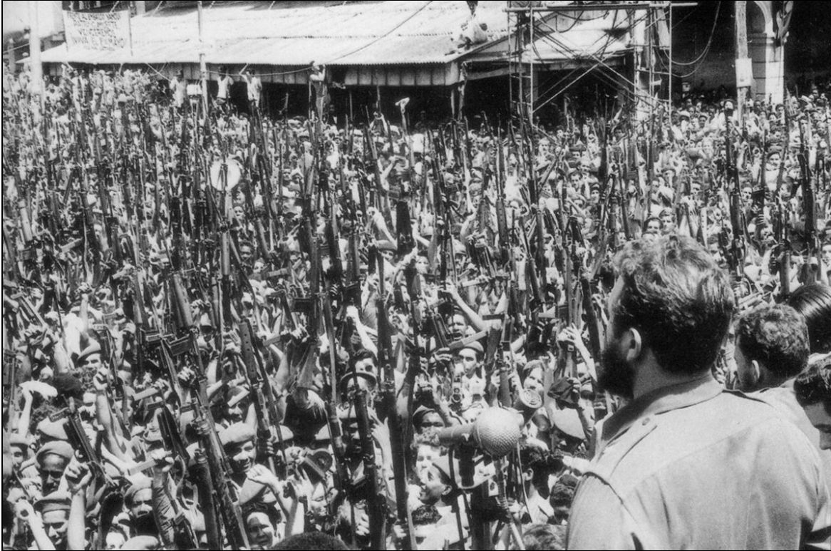
Fidel Castro, while leading the Cuban people to defeat the U.S. attempted invasion at Playa Girón, makes the historic declaration establishing the socialist character of the Cuban Revolution, April 16, 1961.