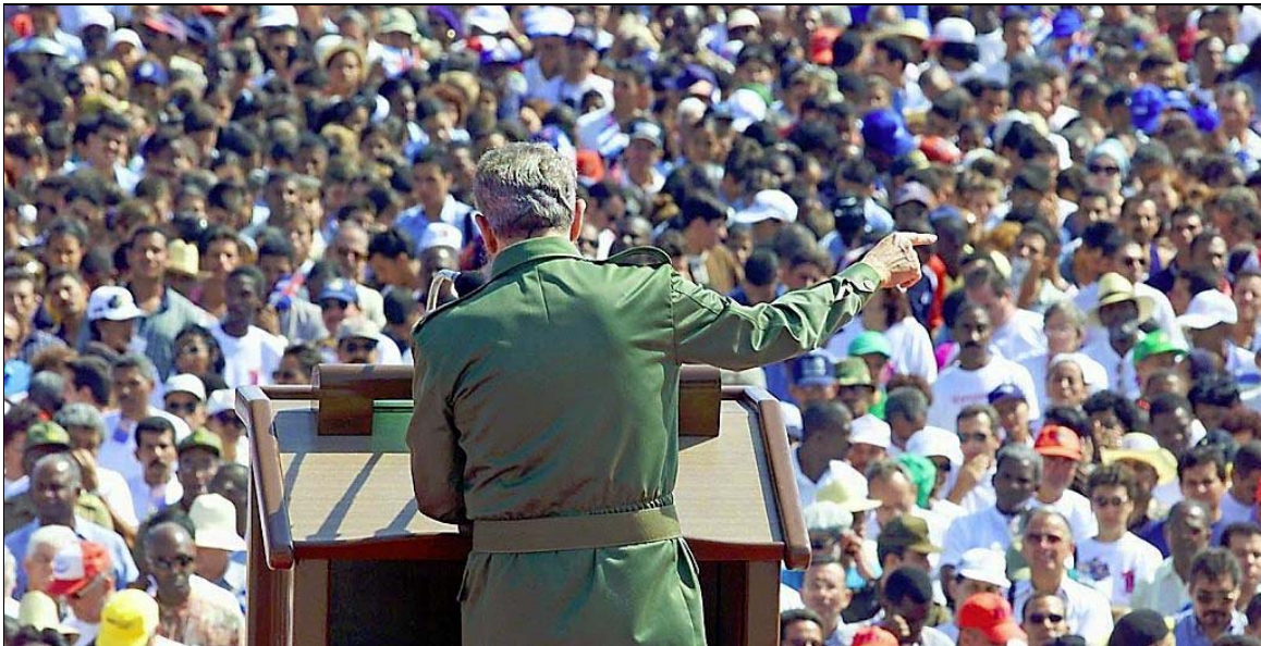
Fidel presents his "Concept of Revolution" during 2000 May Day speech in Havana.

Fidel's example and fidelity to principle continue to inspire the Cuban people on the path of independence, self-determination and human dignity.