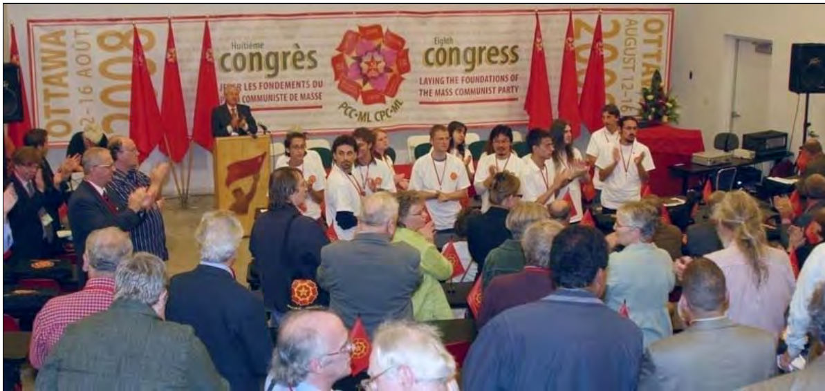
CPC(M-L)'s 8th Congress, August 2008

rate attention to organizing the workers into Groups of Writers and Disseminators and to mobilize the workers, women, youth, students and minorities to take up the work of renewal of the democratic process. The entire CPC(M-L) is organized to win over class conscious workers and their allies especially women, youth, students and minorities to take up the work of the Party as their own."