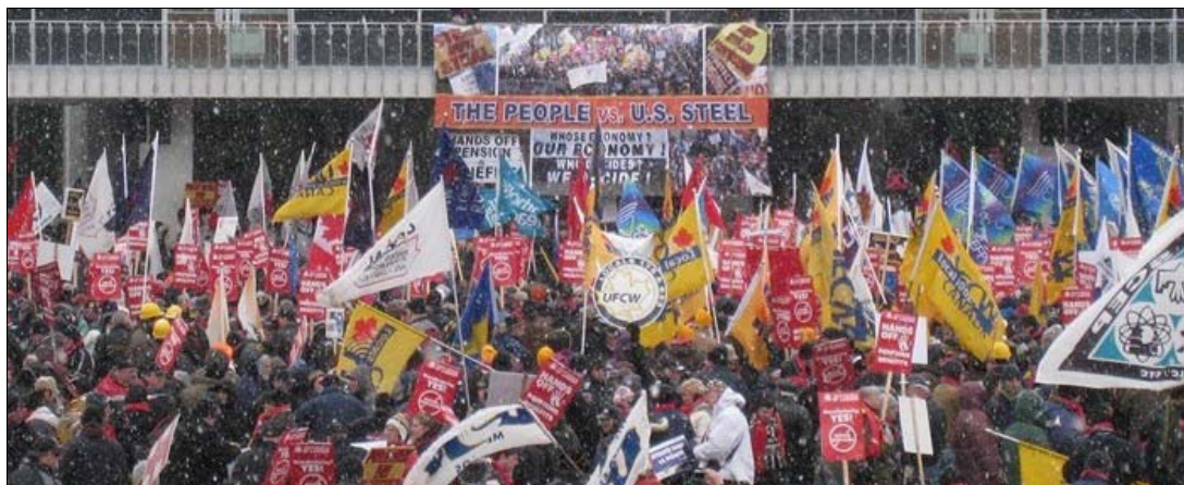
"The People vs U.S. Steel," Hamilton Day of Action, January 29, 2011.