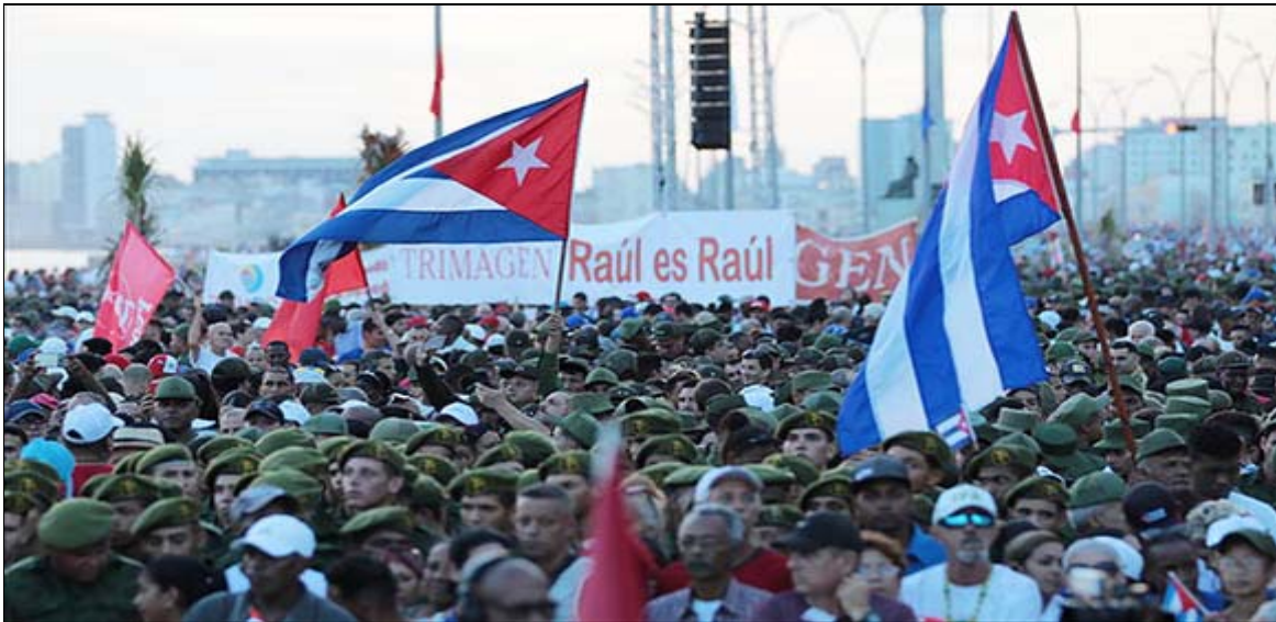
Thousands of Cubans fill the José Martí Anti-Imperialist Tribune to show their support for Raúl Castro and the Cuban Revolution, May 22, 2026.

Furthermore, the U.S. government distorts other historical truths about the event it uses as a pretext. It omits, among other details, the numerous formal complaints filed by Cuba during that period with the State Department, the U.S. Federal Aviation Administration (FAA), and the International Civil Aviation Organization (ICAO) regarding more than 25 serious and deliberate violations of Cuban airspace committed by the cited organization between 1994 and 1996, in blatant transgression of international law and U.S. legislation itself.