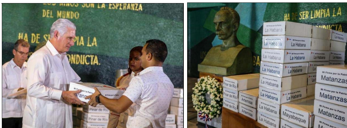
Provincial representatives present more than 6.2 million signed forms from the "My signature for the Homeland" movement to the First Secretary of the Central Committee of the Communist Party and President of the Republic, Miguel Díaz-Canel Bermúdez, May 19, 2026 as Cuba marks anniversary of the death of José Martí.

Lift the Bloqueo and we'll see how we fare.