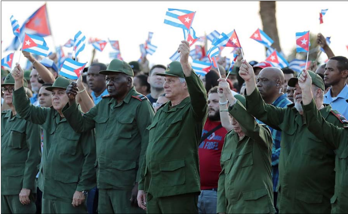
President Miguel Díaz-Canel Bermudez and other Cuban leaders at the José Martí Anti-Imperialist Tribune, May 22, 2026.

On his X account on May 20, Cuban President Miguel Díaz-Canel Bermudez posted the following: