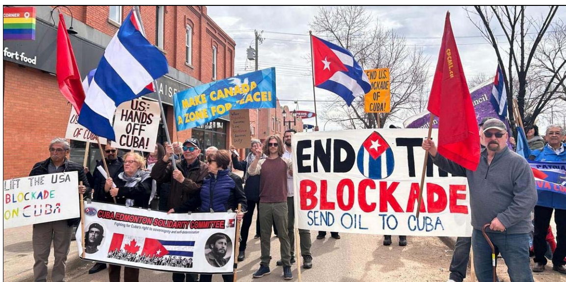
Edmonton, April 19, 2026