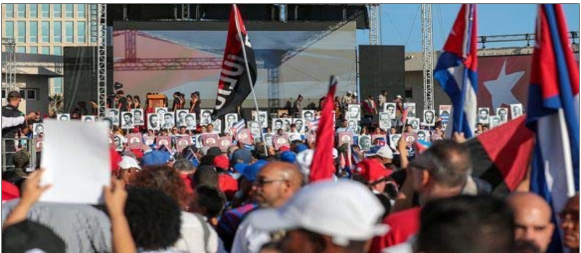
Rally at the José Martí Anti-Imperialist Tribune, May 22, 2026