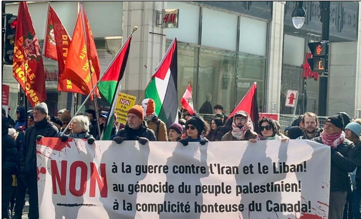
March 21, 2026

Many people pointed out that the struggle for peace does not involve massacres, aggression, drones, bombings and destruction, reminding us that peace lies in our unwavering resistance.