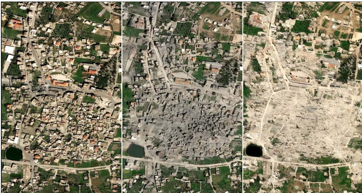
On April 14 satellite imagery shows the centre of Bint Jbell in southern Lebanon severely damaged with grey debris patterns suggesting burning consistent with demolitions.

Israeli warplanes have carried out relentless airstrikes across southern Lebanon while ground forces have infiltrated territory near the border, with bulldozers tearing down buildings and demolitions razing whole villages, increasingly following the Gaza playbook.