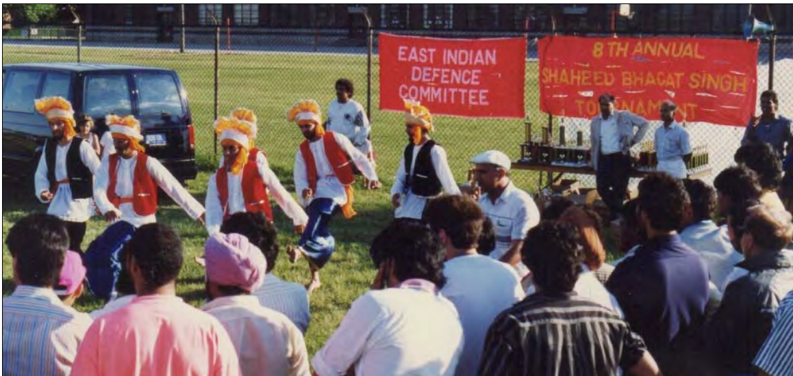
Shaheed Bhagat Singh Festival of Sports and Culture, 1990