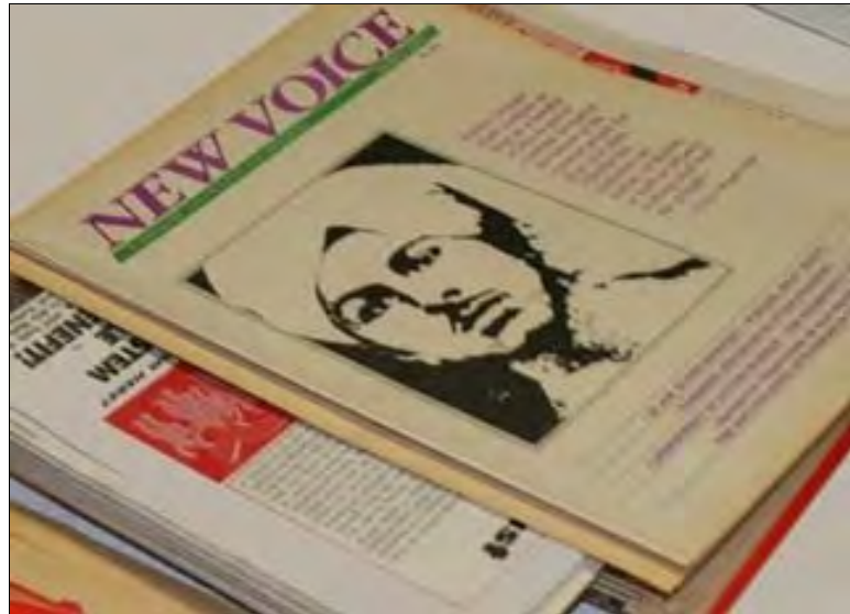
Discussion of the Indian people's striving for control over their own affairs in the Party Press and non-Party Press.