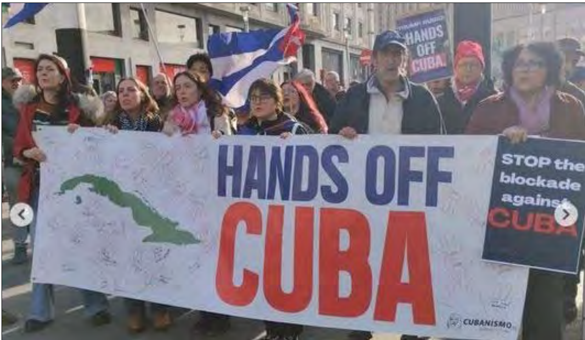
February 7, 2026