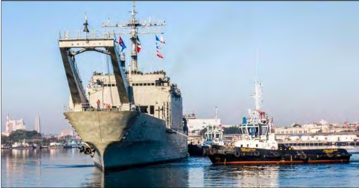
Ships carrying humanitarian aid from Mexico arrive in Havana harbour, February 12, 2026

Sheinbaum stressed that these coercive measures will impact sectors such as health and food in Cuba. "Lack of fuel directly affects hospitals and basic services, a situation that must be avoided through dialogue and respect for international law," she said.