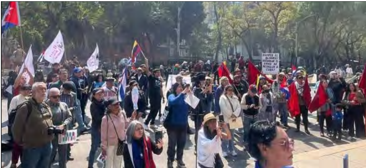
February 2, 2026