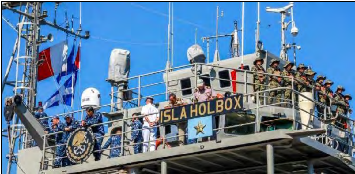
Havana, February 12, 2026

Through these actions, the Government of Mexico reaffirms the humanistic principles and spirit of solidarity that guide it, and its commitment to international cooperation among peoples, especially with those who require humanitarian assistance in situations of emergency and vulnerability. Cuba and Mexico are sister nations, heirs to a long history of solidarity that we honour today.