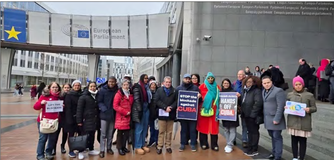
Protest at the European Parliament, January 27, 2026