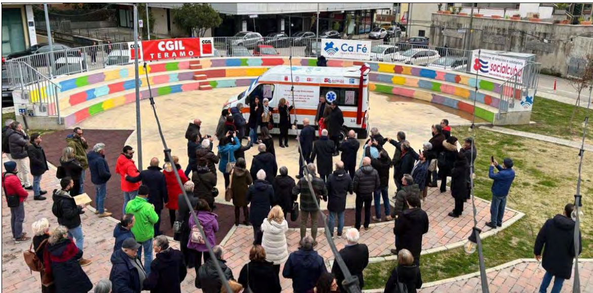
Italian workers and friends of Cuba prepare to send an ambulance to Ciego de Avila, January 30, 2026.