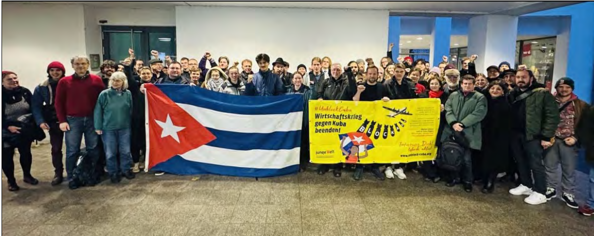
February 8, 2026