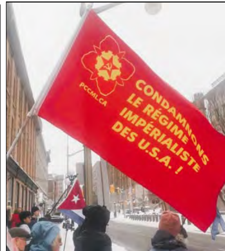
January 17, 2026