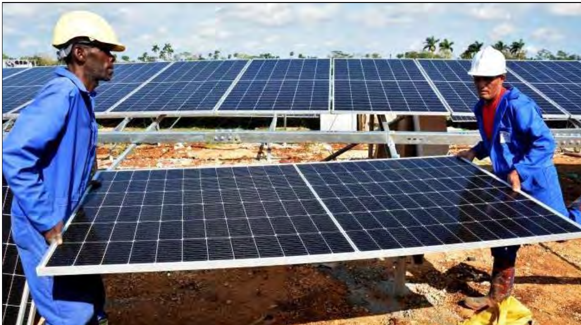
Installing solar panels in Villa Clara in Sanctis Spiritus, January 2026

blockade against Venezuela, Cuba has not received a single drop of fuel. This situation has had a broad impact on public health, the economy, transportation, and electricity generation, he added.