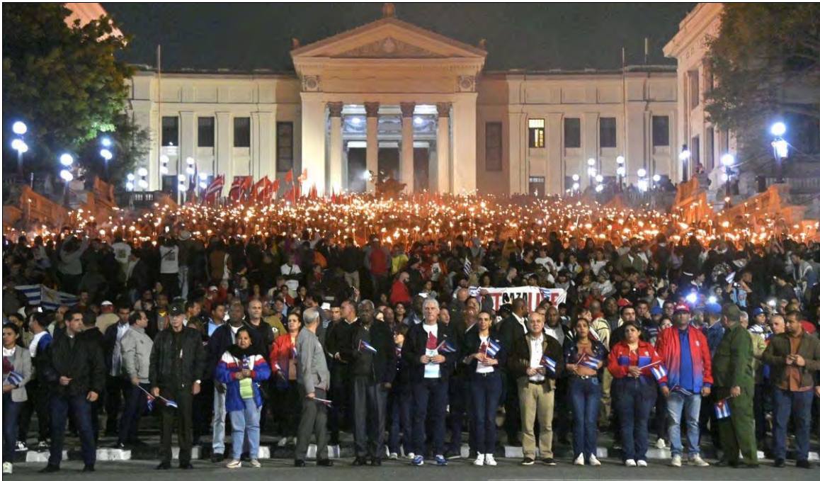
Cuban President Miguel Díaz-Canel leads the annual torchlight march to honour José Martí from the University of Havana, January 27, 2026. Díaz-Canel reaffirmed his country's determination to move forward despite U.S. threats against it.

– Communist Party of Canada (Marxist-Leninist) – February 12, 2026