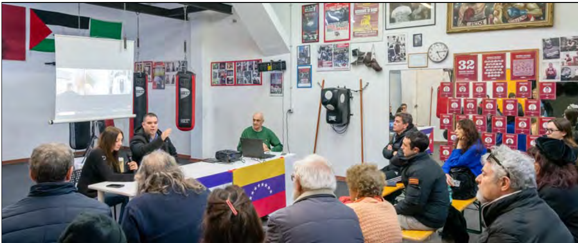
February 3, 2026