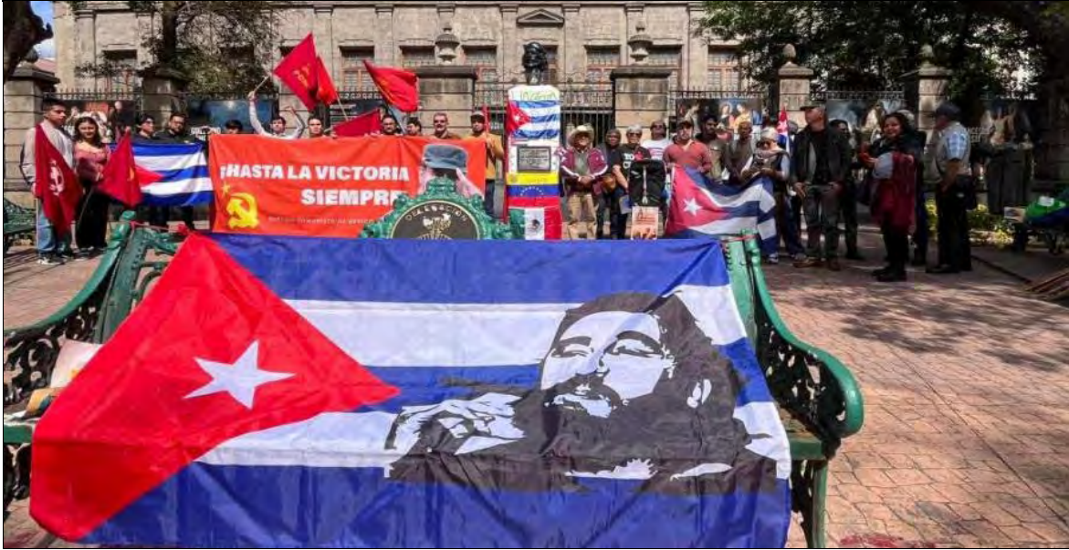
January 24, 2026