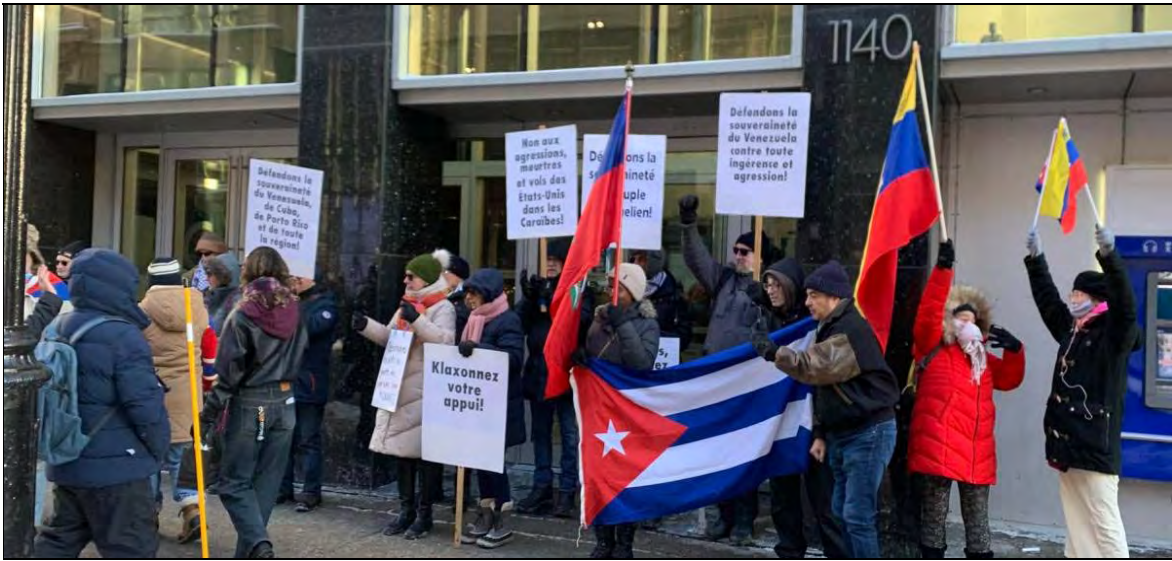
February 7, 2026