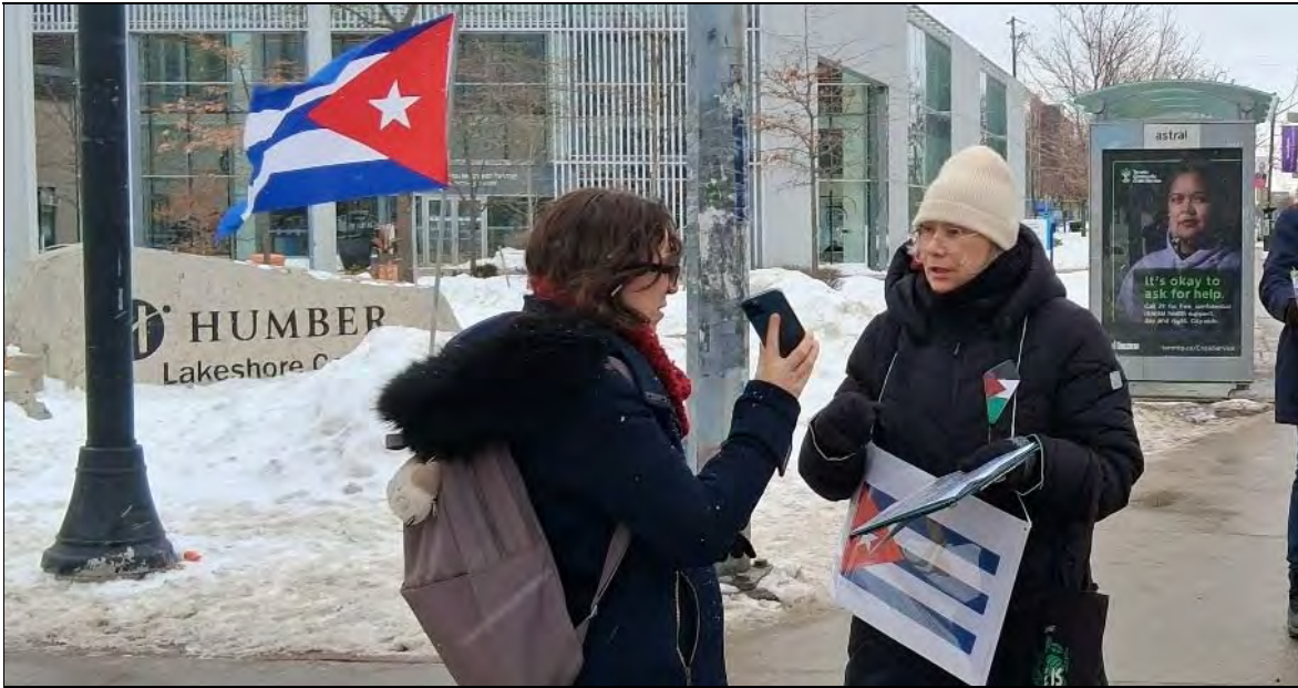
Collecting signatures on e-petition at Humber College in Etobicoke, February 11, 2026