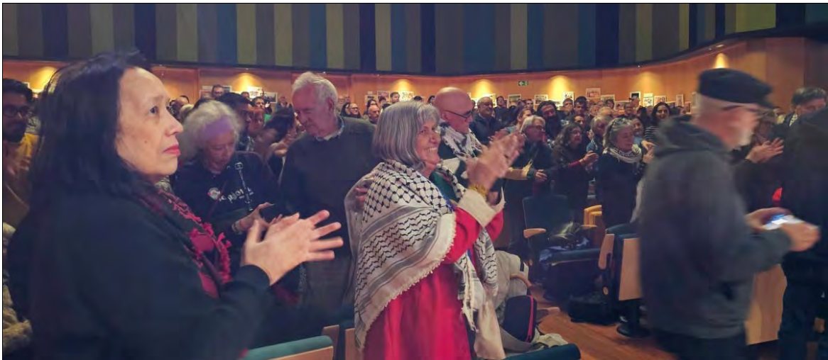
February 1, 2026