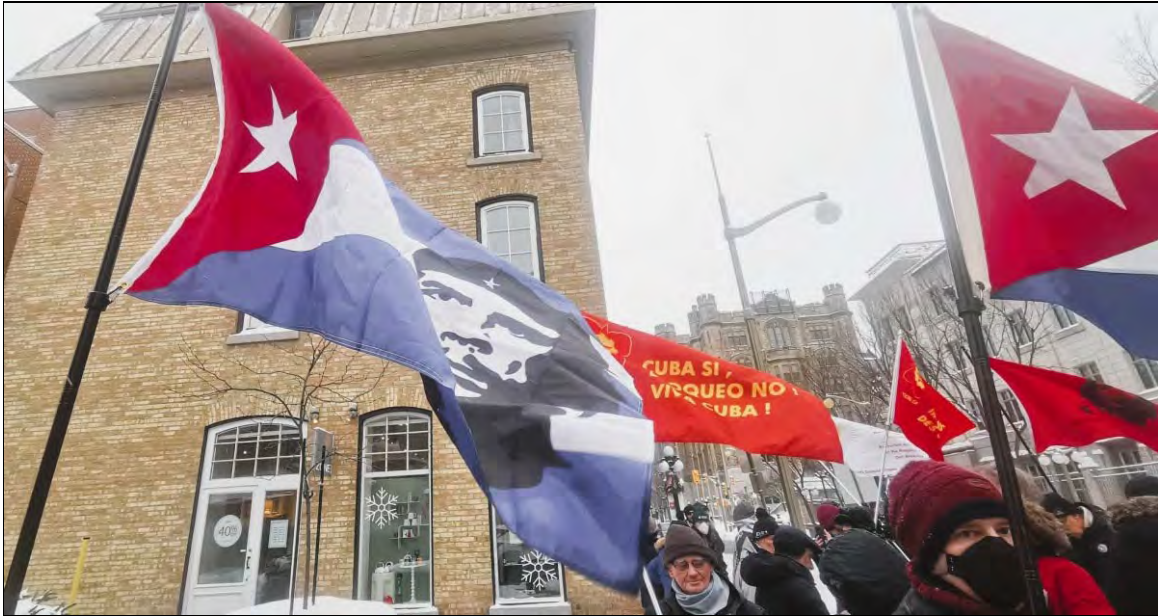
Ottawa, January 17, 2026

This is a blatant attempt to suffocate an already challenged economy due to more than sixty years of the blockade. It is meant to deprive the Cuban people of their basic needs and their capacity to have economic and diplomatic relations with anyone of their choosing, which is their fundamental right. It is an unabashed application of the initial aim of the blockade which was to make the Cuban people suffer.