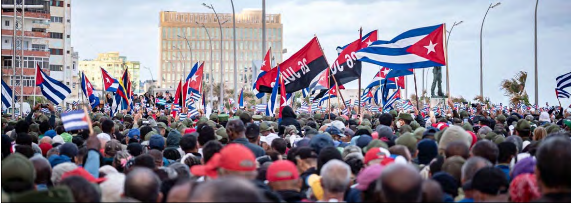
March of the Fighting People, Havana, January 16, 2026

The Revolutionary Government condemns in the strongest terms the new escalation by the U.S. government against Cuba in its efforts to impose a total blockade on fuel supplies to our country.