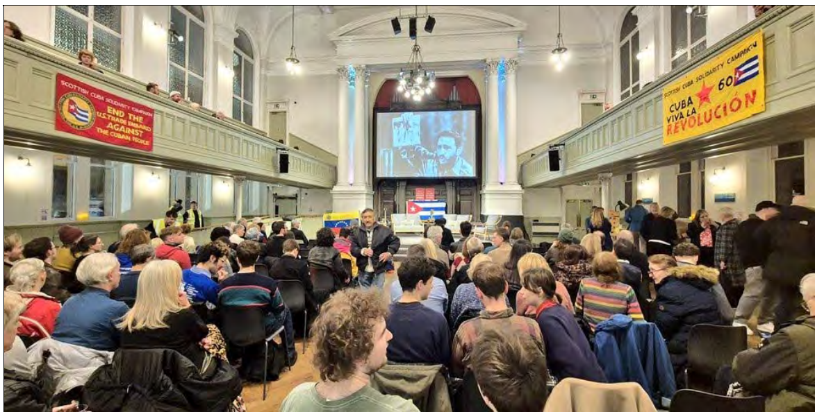
February 2, 2026