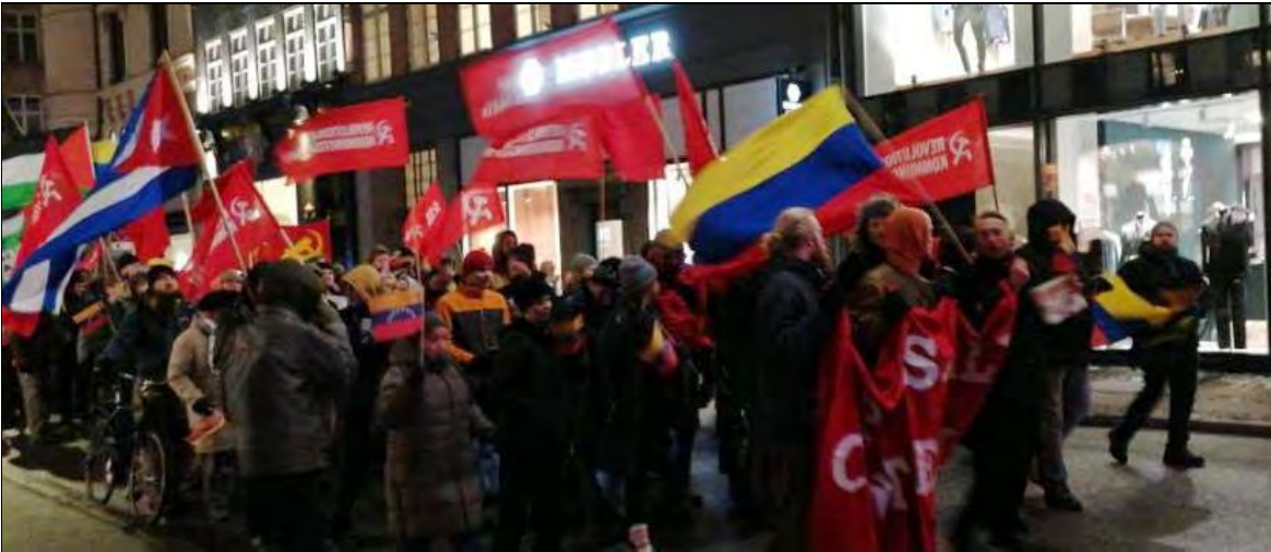
January 22, 2026