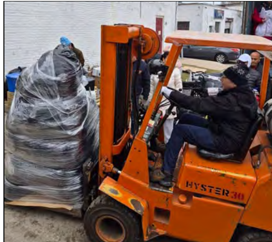
Action to load container bound for Cuba, December 6, 2025