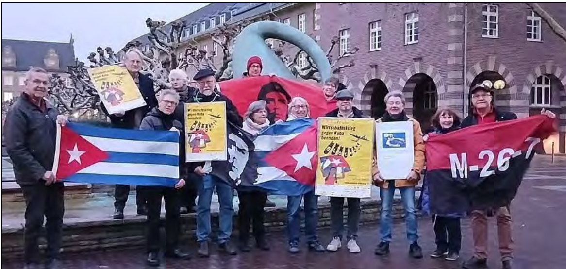
February 8, 2026