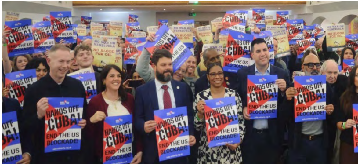
Scenes from the Latin America Adelante! Conference, with solidarity with Cuba front and centre throughout the proceedings, February 7, 2026.