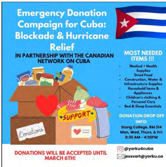
Posters for York University Donation Campaign for Cuba, February 20, 2026, Packing Party