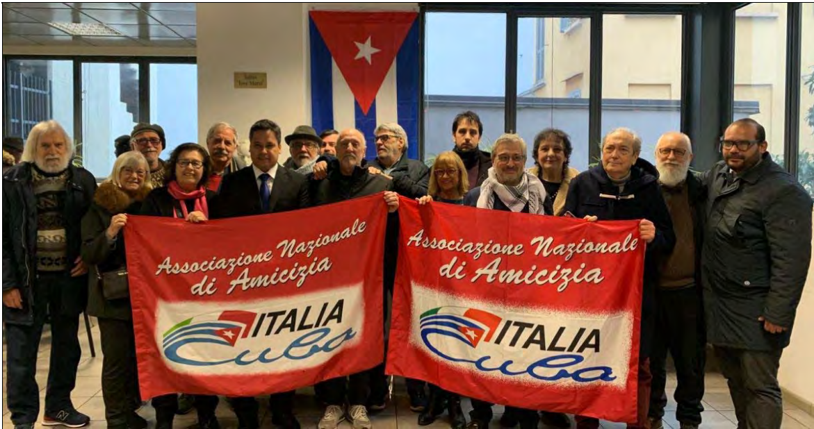
February 10, 2026