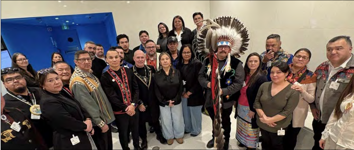
Representatives of Indigenous Peoples in Quebec travel to Quebec City to participate in discussions on the Constitution of Quebec bill, February 5, 2026.

The condescending reception given to the APNQL delegation by the Minister of Justice during the hearing was matched only by the contemptuous act of refusing entry to the National Assembly to members of the delegation carrying an Eagle Staff.