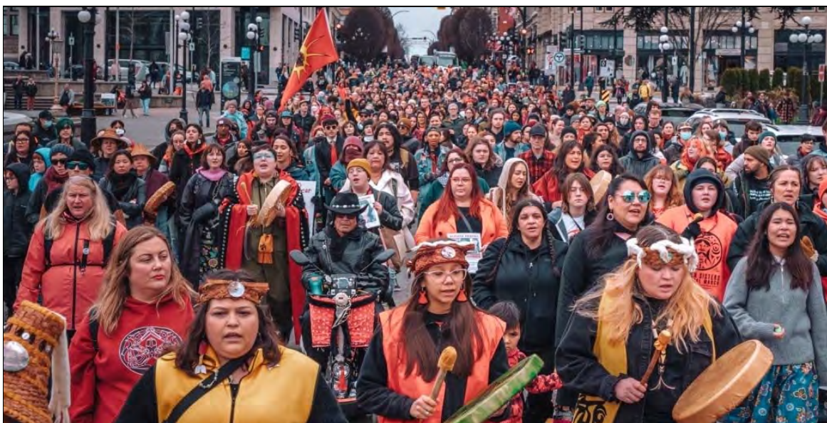
Women's Memorial March, Victoria, February 10, 2024

Justice matters and ending impunity is essential. Remembrance and honouring are equally vital, because missing and murdered Indigenous women and girls are not statistics, they are human