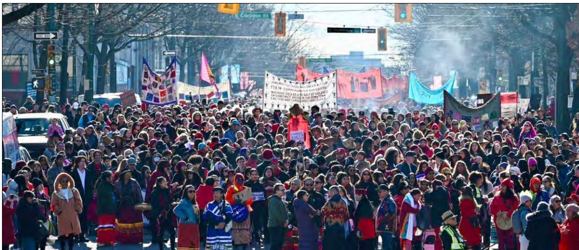
34th Annual Women's Memorial March, Vancouver, February 14, 2025