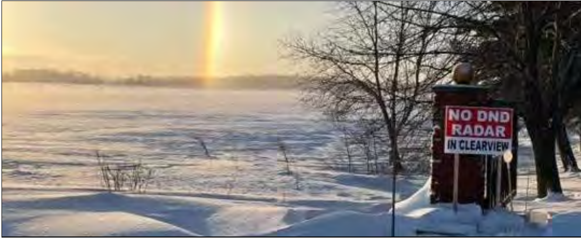
Proposed Clearview receiver site for the Arctic Over-the-Horizon Radar

OTHR) project. Residents and local councils are greatly concerned that the land was purchased and plans made without notifying them and these major military installations are being presented as a done deal.