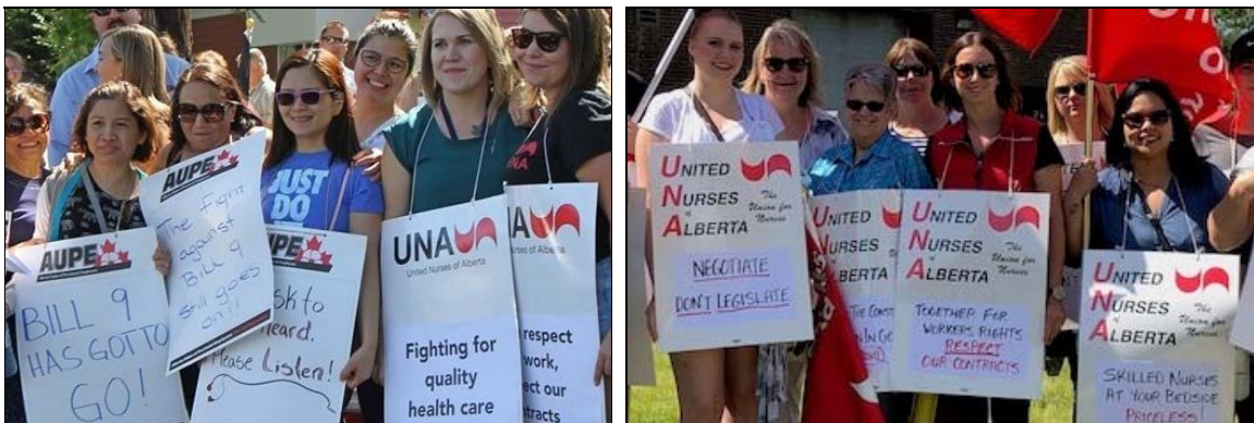
Pickets over the summer in Lethbridge (left) and Red Deer against Bill 9.

The report of the "Blue Ribbon Panel" established by the Alberta government says the $600 million cut in investments in social programs it recommends should only be the beginning in a process to reduce annual provincial spending by billions of dollars. The demanded cuts are particularly severe in health care and advanced education, as well as in primary and secondary school education, public sector wages and benefits, and spending on fixed provincial assets. The report says austerity will be, "a significant challenge because it will require government not only to accommodate the effects of both population growth and inflation but also reduce spending substantially below current levels." [1]