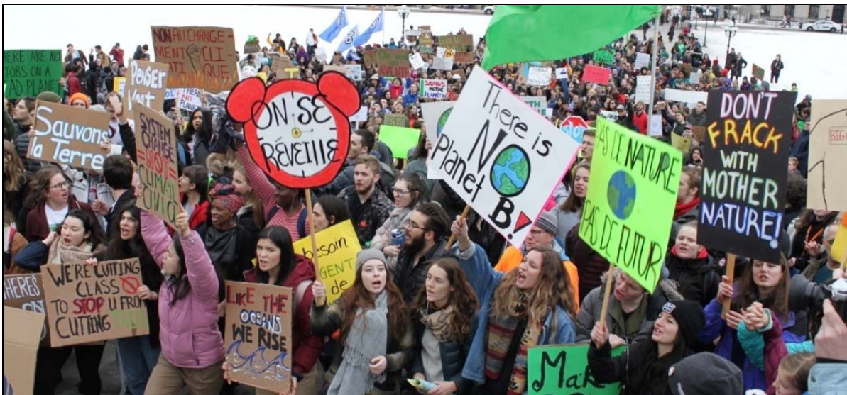
Youth take to Parliament Hill for Student Climate Strike, March 15, 2019.