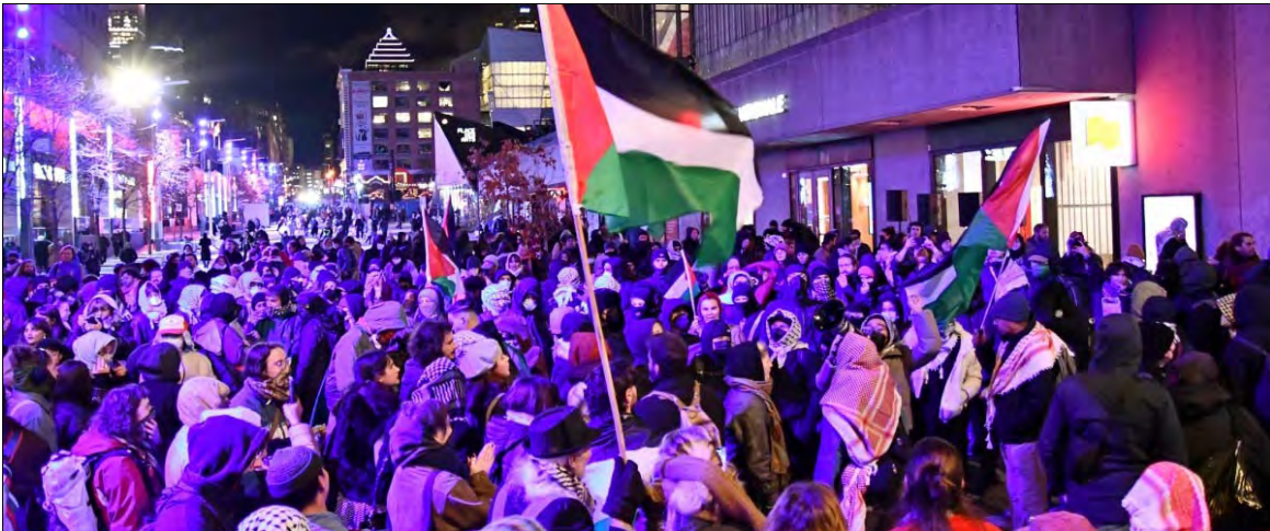
Montreal, November 22

The media hype since the demonstration against NATO in Montreal on Friday, November 22 has raised a lot of questions and anger in Quebec. From the Mayor of Montreal, to Premier Legault, to the chief of police of Montreal and Prime Minister Justin Trudeau, with one voice they blame the youth and the people of Quebec for the violence at the demonstration saying it was unacceptable, anti-Semitic, unprecedented and that it has no place in Quebec.