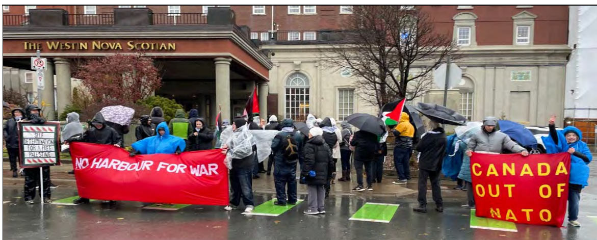
Demonstration against the Halifax International Security Forum, November 23, 2024