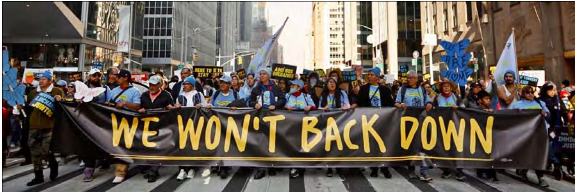
March in New York City, November 9, 2024, days after the U.S. election

because their worldview of various blocs who oppose one another has fallen apart. Whatever the people decided, they proved that they believe the future belongs to a modern society where discussion takes place based on experience, views and interests, not by being grouped into a box based on one's innate characteristics.