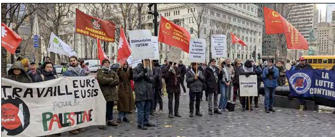
Demonstration in Montreal November 23, 2024, against NATO Parliamentary Assembly

In relation to anti-NATO demonstrations held in Montreal during the NATO Parliamentary Assembly meetings from November 22 to 25, the director of the Montreal police service stated several times in various interviews and newspapers that in connection with the conflict in the Middle East, of the 450 to 500 demonstrations over the last 14 months, only 2.5 per cent have "gotten out of hand." Those allegedly responsible for violence were part of a "far-left group" known to the police for 20 years, he said, adding that the group had "nothing to