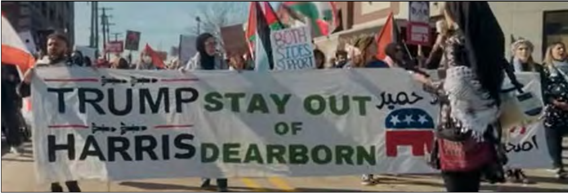
Dearborn, Michigan, November 2, 2024

The people of the United States will continue to organize for change during Trump's second term. The stability and the secure future they desire can only be guaranteed when the people themselves exercise decision-making power, not through outmoded and outdated political processes which serve to legitimize one clique or the other at the head of the ruling class. The solution they will work out will necessarily lead to the balanced, proportionate development of the economy and society according to the maximum satisfaction of the people, the opposite of the present-day anarchy and civil war conditions ripping apart the old society.