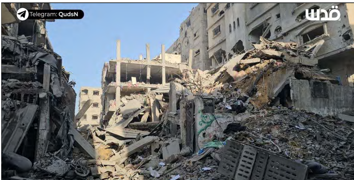
Destruction left by Israeli massacre carried out in Beit Lahiya in Northern Gaza, October 28-29, 2024.

Francesca Albanese, UN Special Rapporteur on the situation of human rights in the Palestinian territory occupied since 1967, announced on social media that her report titled "Genocide as colonial erasure" is now publicly available in all UN official languages.