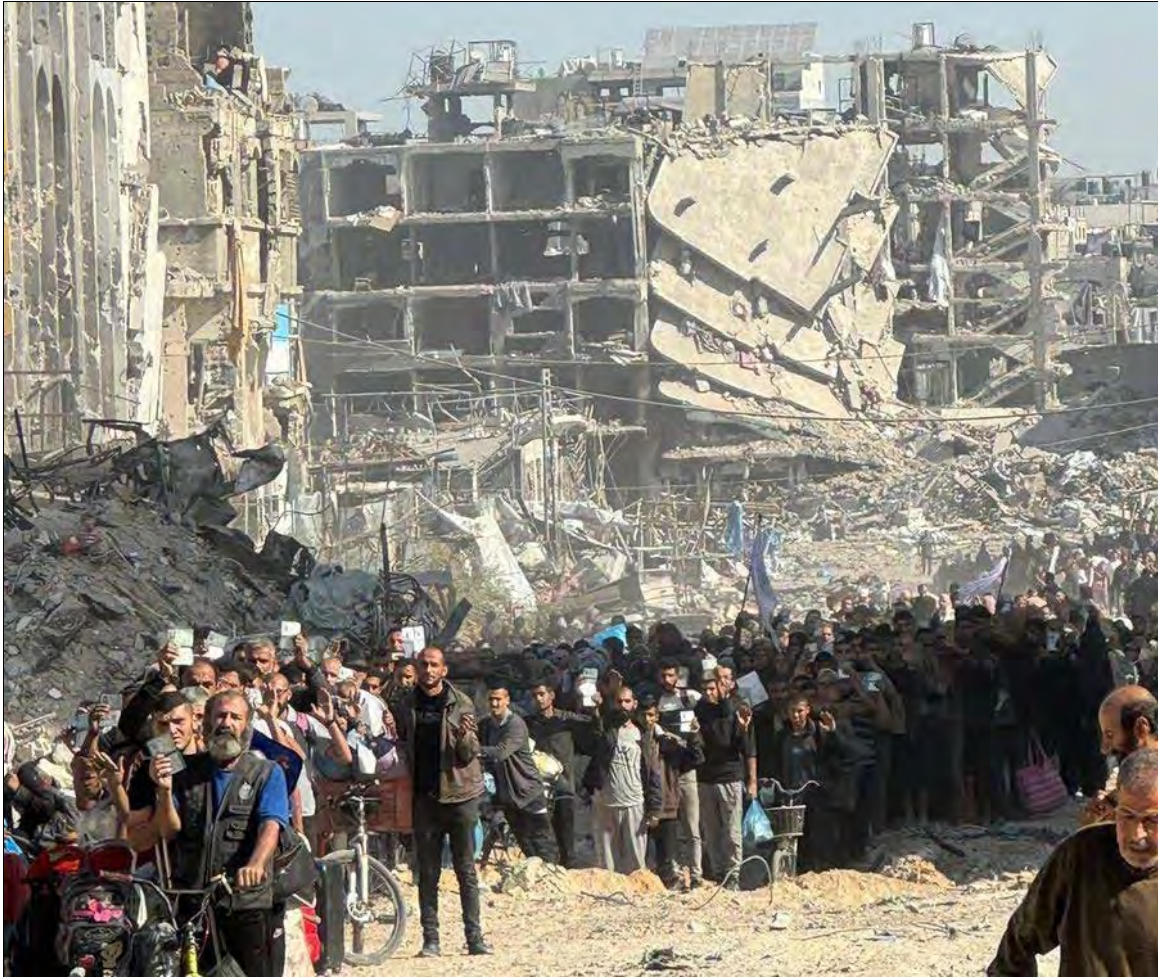
Families in Jabalia are forced to flee by U.S./Zionist aggression, October 21, 2024.

documented similar extrajudicial killings of civilians by Israeli snipers.