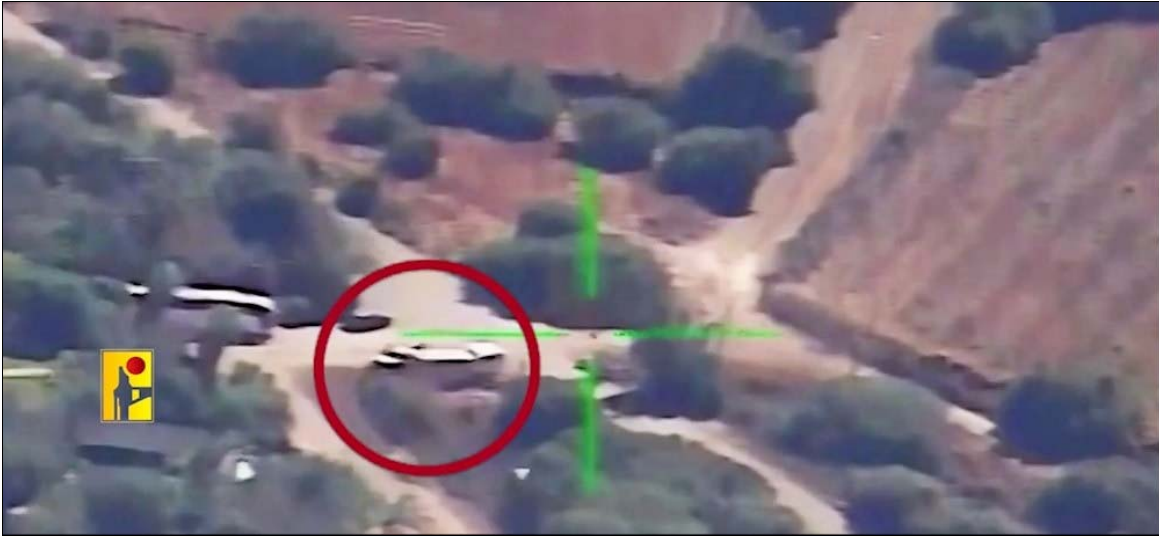
Hezbollah targets Israeli soldiers in northern occupied Palestine, October 27, 2024

On the evening of Saturday, October 26, the Lebanese Resistance Movement Hezbollah issued an evacuation directive to Israeli settlers in 25 settlements in northern occupied Palestine, mirroring similar actions by Israeli occupation forces who had previously issued evacuation orders in various areas across Lebanon. Hezbollah said that Israeli forces had stationed military units in these settlements, effectively turning them into operational outposts.