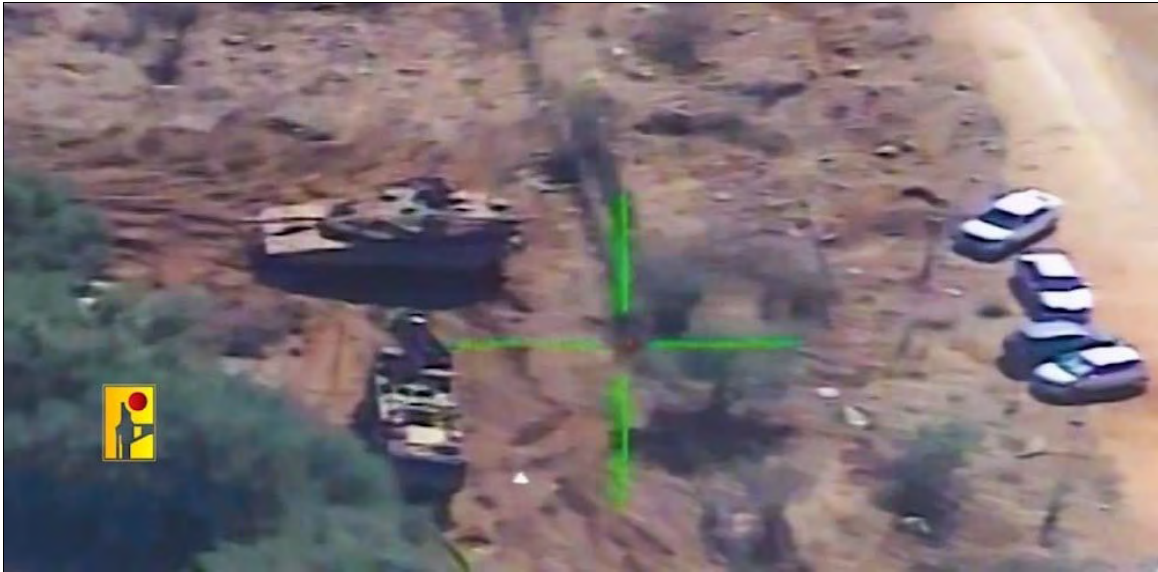
Resistance targets Merkava tank in northern occupied Palestine, October 25, 2024

The U.S. use of force to impose its hegemony and control countries and peoples who do not submit to its dictate has now given rise to the extreme violence of the U.S./Zionist forces in northern Gaza. Neither the U.S. nor its Genocide Cartel can continue to claim these atrocities are "collateral damage" while Israel is "defending itself." Once again, the peoples of the world are reduced to spectators while the U.S. gives itself and is given carte blanche to make deals to reach whatever transitory settlement it thinks it can cobble together prior to the U.S. election, meanwhile giving the Zionists time to commit the most abhorrent crimes with impunity.