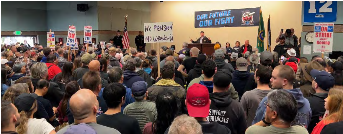
Boeing workers strike rally, October 15, 2024, day 33 of their strike.

the fight for empowerment by persisting in defiantly speaking in our own name and refusing to allow the rich and their candidates to speak for us -- will carry forward the fight for change that favours the people.