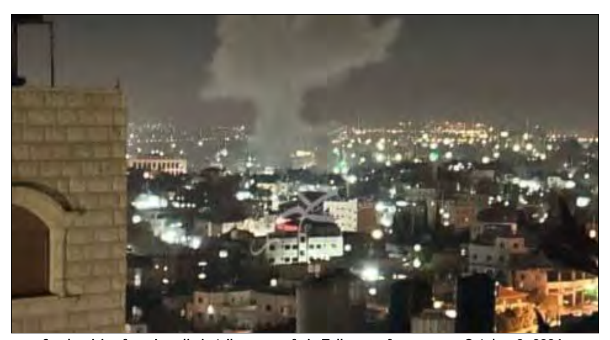
Smoke rising from Israeli airstrike on a cafe in Tulkarm refugee camp, October 3, 2024.

Eighteen Palestinians were killed and several others were injured in an Israeli airstrike on the evening of October 3 that targeted a café in the Tulkarm refugee camp, located in the northern occupied West Bank. Israeli warplanes launched at least one missile at the café in the al-Hamam neighbourhood while several Palestinians, mainly women and children, were present.