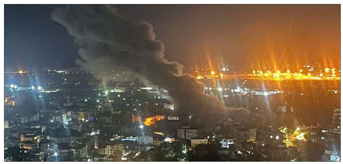
Air strikes on Beirut, Lebanon continue overnight October 4-5, 2024.

On October 4, for the 12th consecutive day, Israel continued its bloody war on Lebanon. At dawn on Friday, October 4, the Israeli occupation army launched the most violent bombing yet on the southern suburb of Beirut, amid news of a new assassination crime. Security sources told Reuters that the Israeli strike on the southern suburb of Beirut was larger than the one that killed Hezbollah Secretary-General Sayyed Hassan Nasrallah, during which 83 bunker-buster bombs were launched. Al Jazeera Beirut bureau chief.