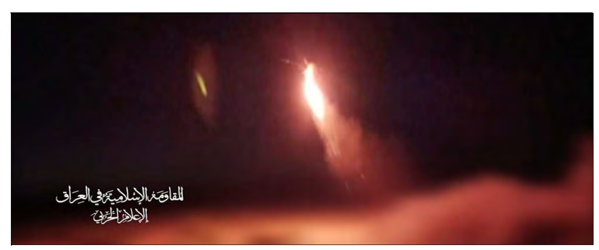
Image from video released by Iraqi resistance on October 4 operations

- Targeted three Israeli military sites in three separate operations in the occupied Golan Heights and Tabariyya with a barrage of drones.