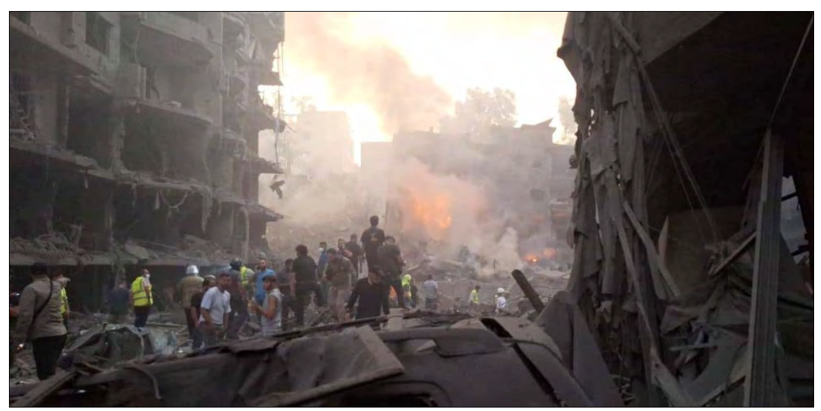
Destruction following massive bombing of southern suburbs of Beirut, September 27, 2024

While this is devastating fire power, the history of humankind has confirmed time and time again that it is not weapons which are decisive in battle but the justice of the cause of the Resistance fighters who stay true to their aim.