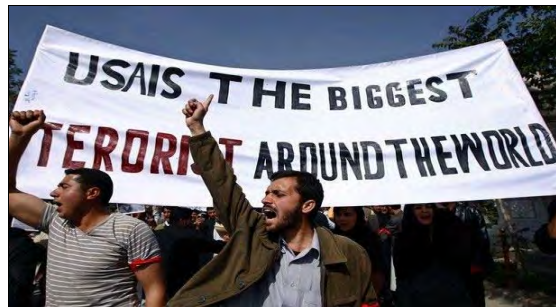
Demonstration in Kabul, Afghanistan, May 10, 2009.

The result is not only the U.S./NATO proxy war in Ukraine and the massive militarization and provocations in the Asia-Pacific region to threaten China, along with continued attempts to spawn colour revolutions in Africa, Latin America and the Caribbean, militarization of the border with Mexico and efforts to keep all other countries in check. No, the result is U.S. genocide of the Palestinian people which is the clearest evidence of what the U.S. democracy stands for. It is the genocide at home of Black people with racist police killings and mass incarceration, of Indigenous Peoples, colonization of Puerto Rico which persists and more.