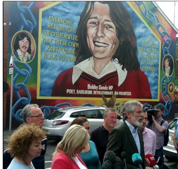
Gerry Adams and Sinn Féin candidates speak to press following election.

"We need the progressive parties to work together.