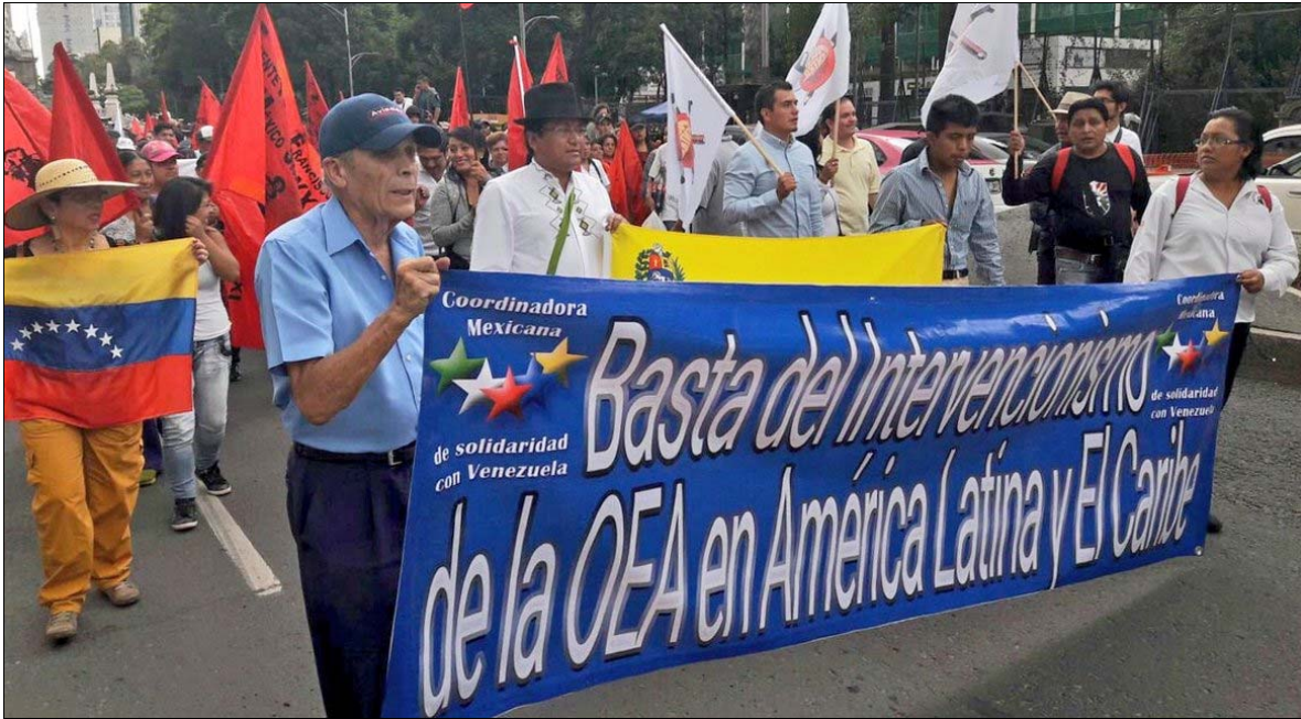
"Enough of OAS interventionism in Latin America and the Caribbean," Mexico City, June 16, 2017

A statement from Mexico's foreign ministry said the country would continue pushing at the General Assembly to pass a resolution expressing "concern" over a list of spurious allegations against Venezuela, in line with Foreign Minister Luis Videgaray's stated opinion that "Venezuela has ceased to be a functioning democracy."