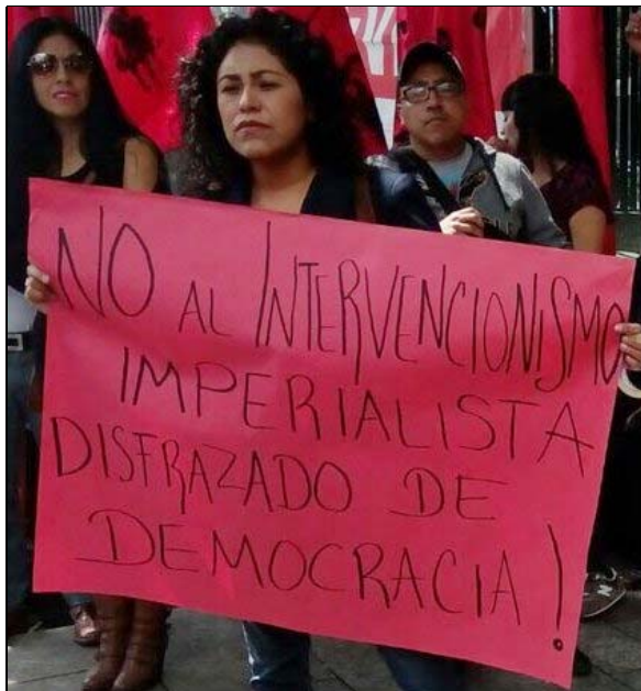
"No to imperialist interventionism dressed up as democracy"

The Cancun meeting, like last year's General Assembly in Santo Domingo, Dominican Republic, is bound to be a forum for the forces that uphold Venezuela's sovereignty and right to self-determination to battle it out with the minority led by the U.S. that give themselves the right to meddle in Venezuela's affairs. The U.S. will seek to divide and bully the others into supporting its dirty scheme against the Bolivarian project of the Venezuelan people first begun in 1999 under President Hugo Chávez. This is consistent with the way the U.S. has used the OAS since its founding in 1948 -- as an instrument to facilitate its domination of Latin America and the Caribbean through military invasions, occupations, military and electoral coups d'état and blackmail of all kinds.