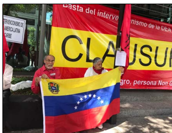
Banner declares OAS meeting "closed."

Originally scheduled to take place in Mexico City, the venue was changed last month by the host government "for logistical reasons." A local newspaper, Yucatan Times , reported that the main reason for the last minute change in location had to do with security, based on the fact that on April 26 a group of farm workers forced their way into the Saint Lazarus Legislative Palace which houses the Mexican Chamber of Deputies and occupied it for at least three hours, during which time people were prevented from entering or leaving the building.