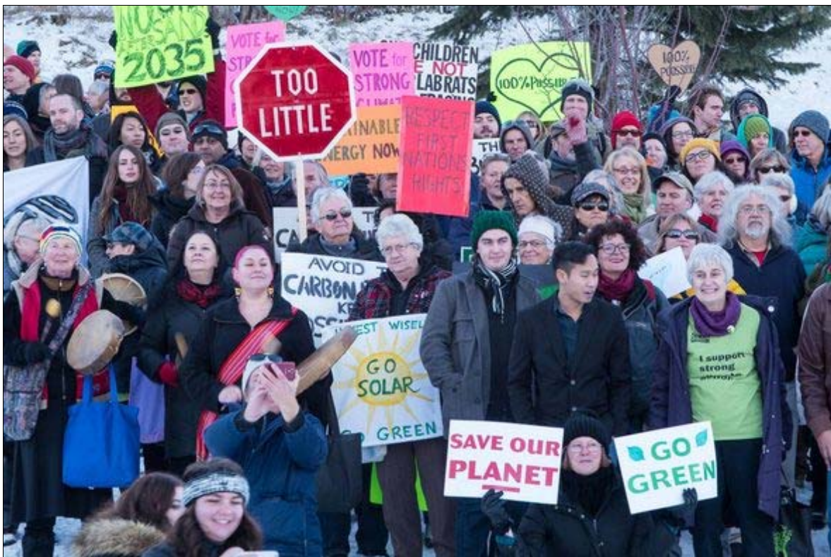
Calgarians rally in support of action on climate change, November 28, 2015.