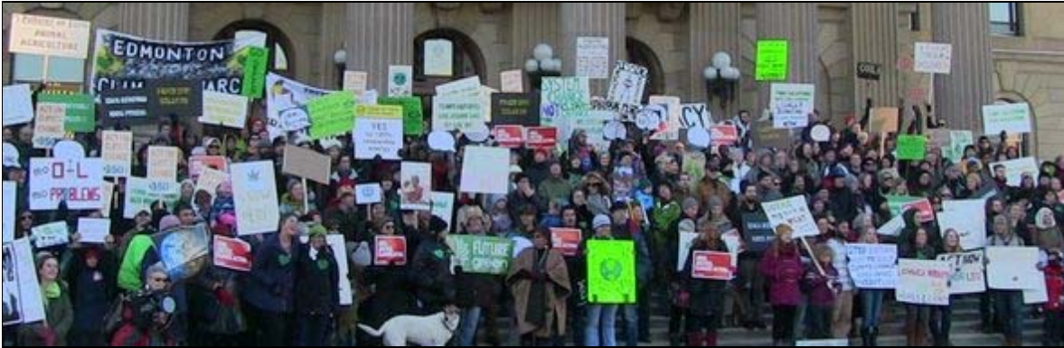
Peoples' Climate Change Rally, Edmonton, November 28, 2015.

Alberta Premier Rachel Notley and Environment Minister Shannon Phillips brought together representatives of First Nations, environmental organizations, and the biggest global oil and gas monopolies operating in the oil sands to announce on November 22, the government's Climate Leadership Plan.